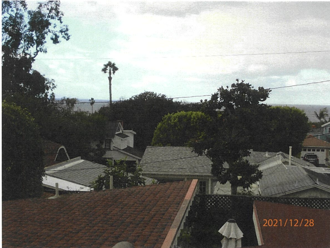
1279 Temple Terrace

The photograph above was taken from the master bedroom on the upper level of the primary residential structure.