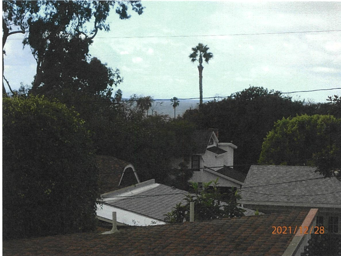
1279 Temple Terrace

The photograph above was taken from the master bedroom on the upper level of the primary residential structure.