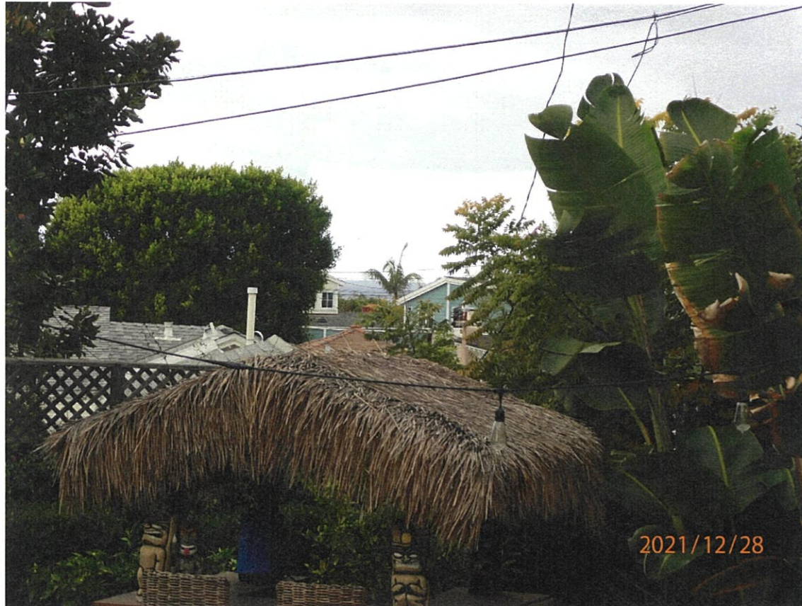
1279 Temple Terrace

The photograph above was taken from the living room on the main level of the primary residential structure.