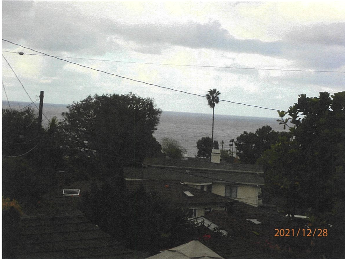
1279 Temple Terrace

The photograph above was taken from the master bedroom on the upper level of the primary residential structure.