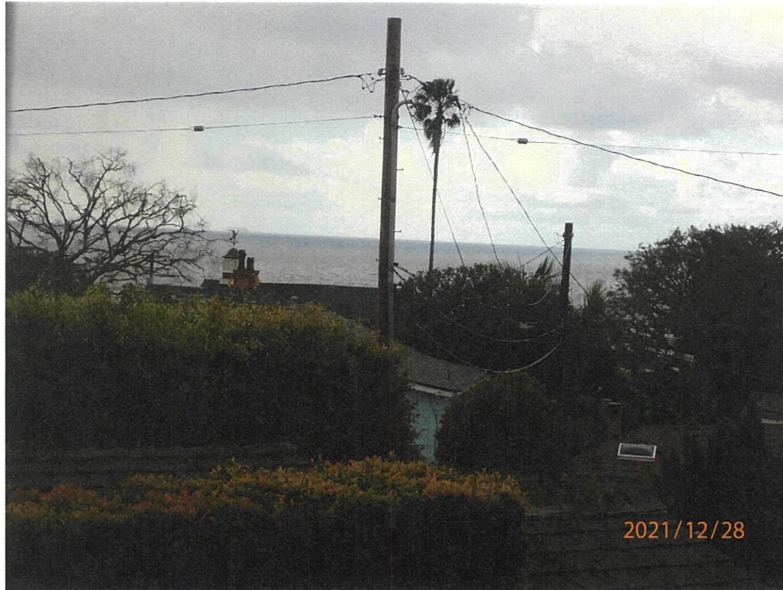
1279 Temple Terrace

The photograph above was taken from the master bedroom on the upper level of the primary residential structure.