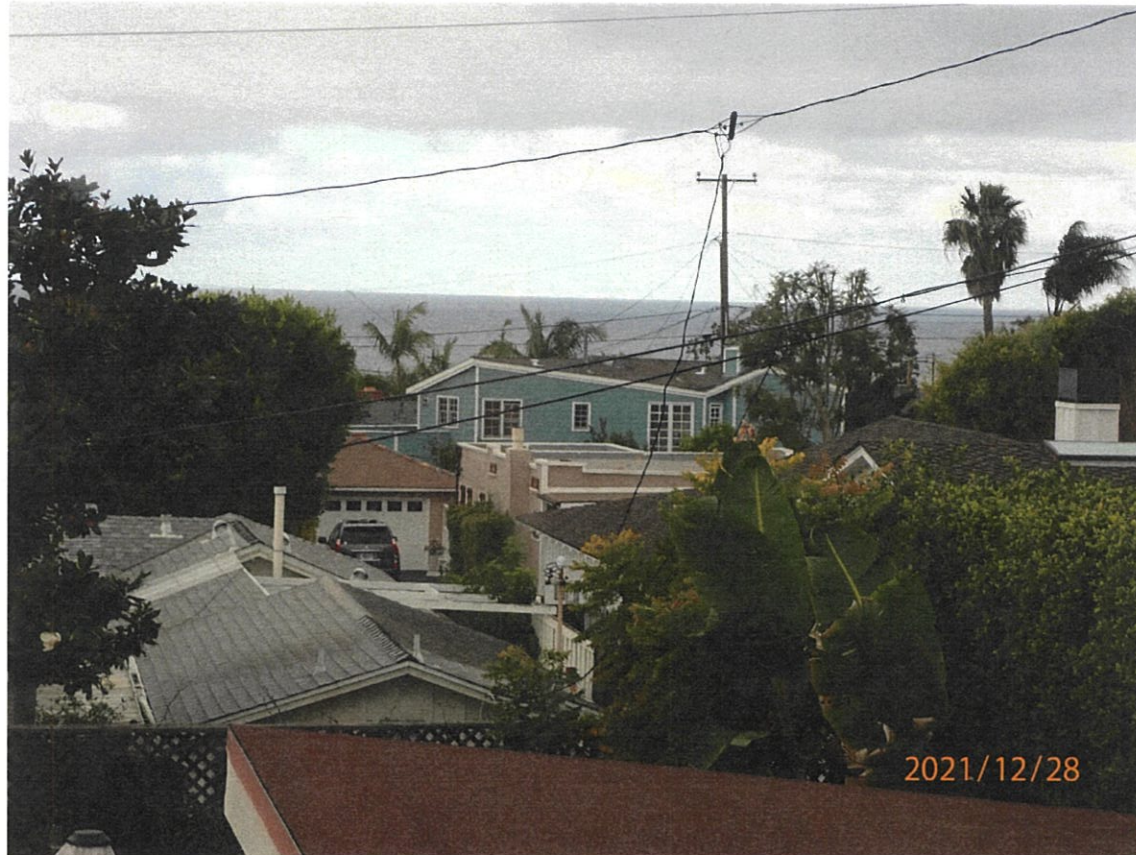
1279 Temple Terrace

The photograph above was taken from the master bedroom on the upper level of the primary residential structure.