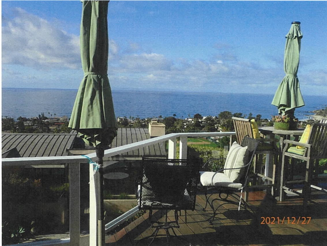
807 Buena Vista Way

The photograph above was taken from the living room on the main level of the primary residential structure.