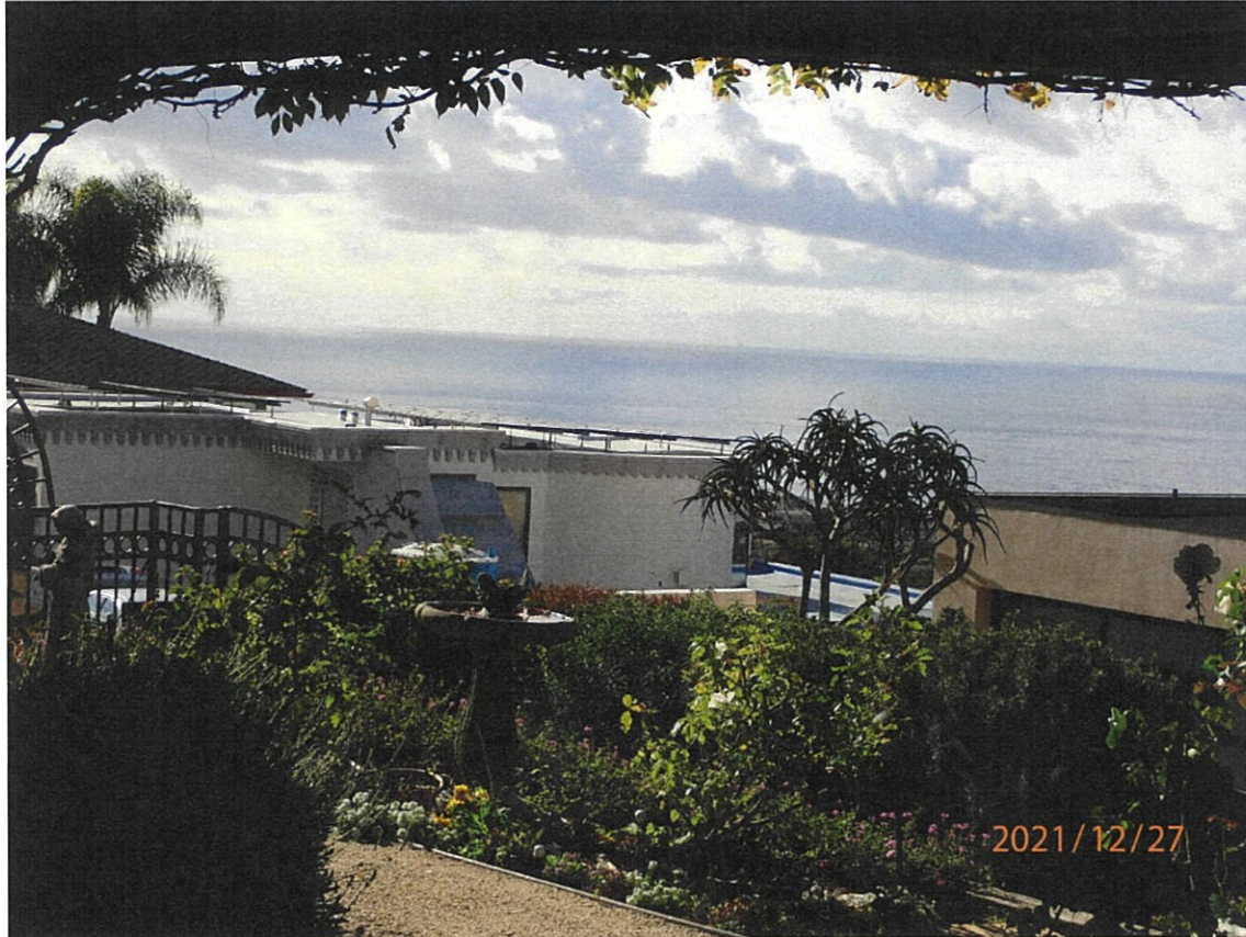
807 Buena Vista Way

The photograph above was taken from the office on the lower level of the primary residential structure.