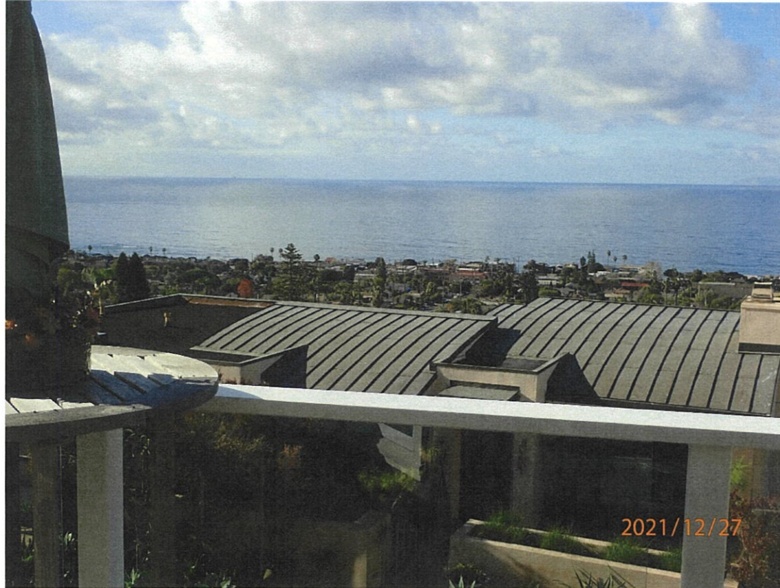
807 Buena Vista Way

The photograph above was taken from dining room on the main level of the primary residential structure.