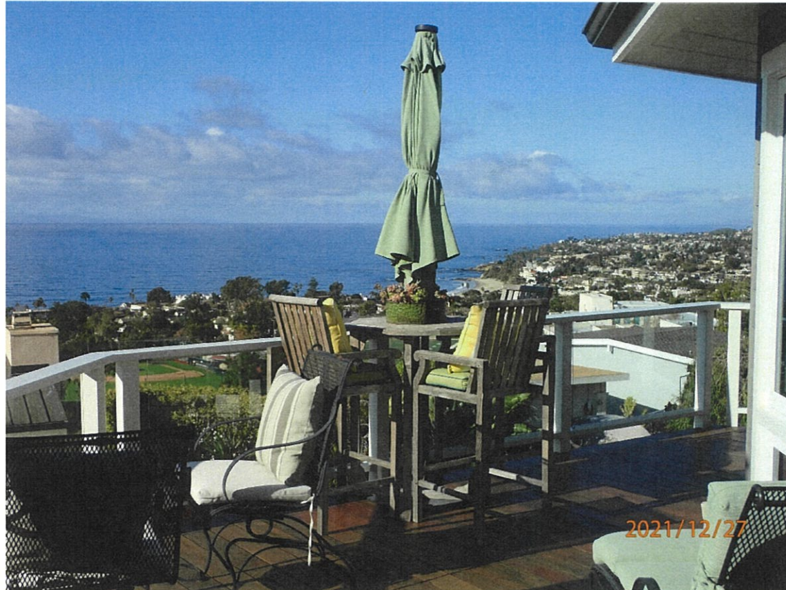
807 Buena Vista Way

The photograph above was taken from the living room on the main level of the primary residential structure.