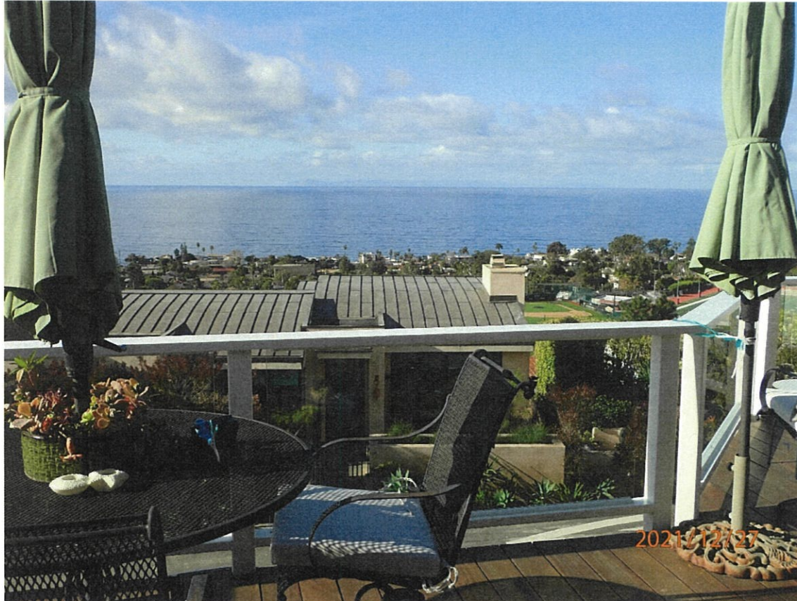
807 Buena Vista Way

The photograph above was taken from the living room on the main level of the primary residential structure.