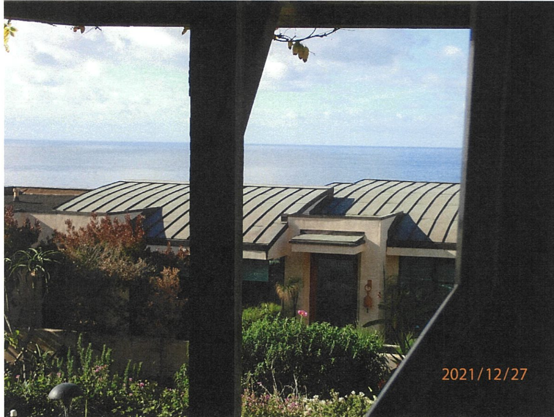
807 Buena Vista Way

The photograph above was taken from the office on the lower level of the primary residential structure.