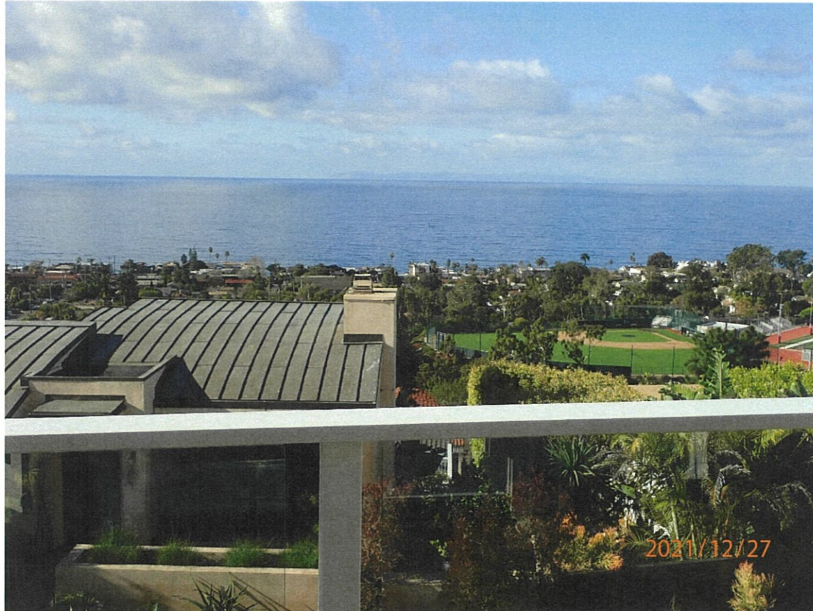
807 Buena Vista Way

The photograph above was taken from dining room on the main level of the primary residential structure.