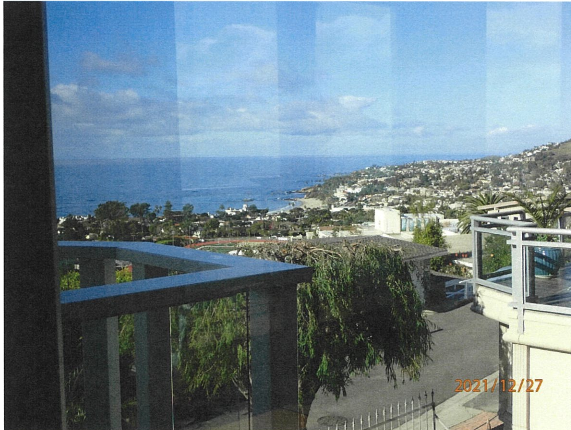
807 Buena Vista Way

The photograph above was taken from the dining room on the main level of the primary residential structure.