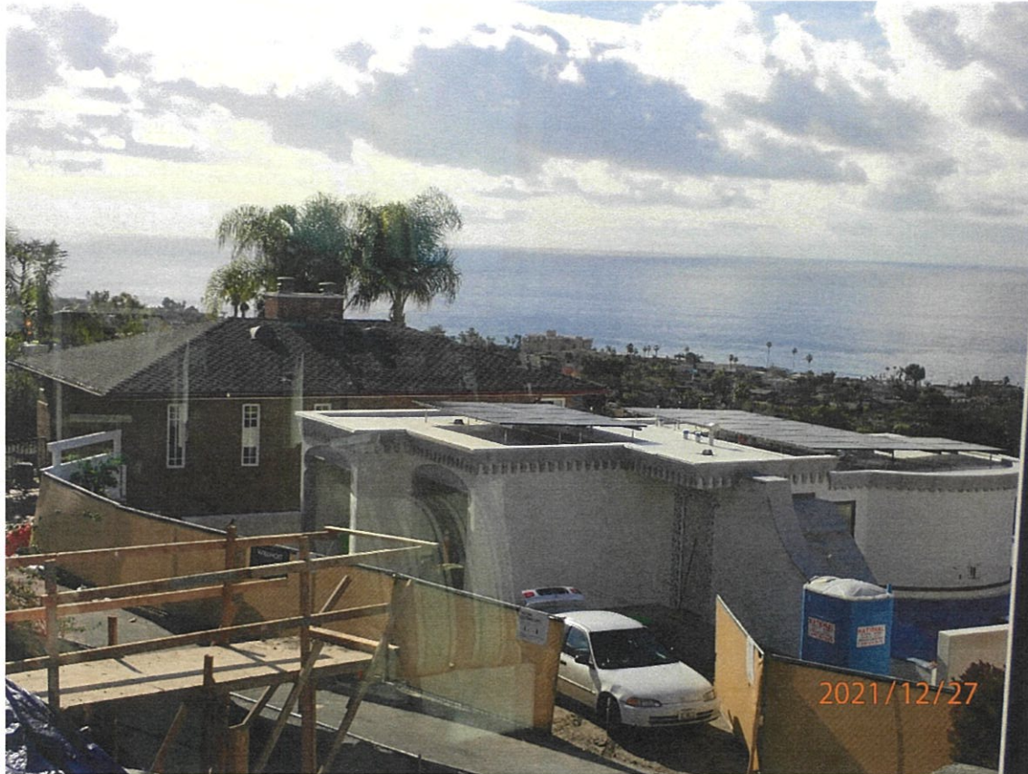
807 Buena Vista Way

The photograph above was taken from the living room on the main level of the primary residential structure.