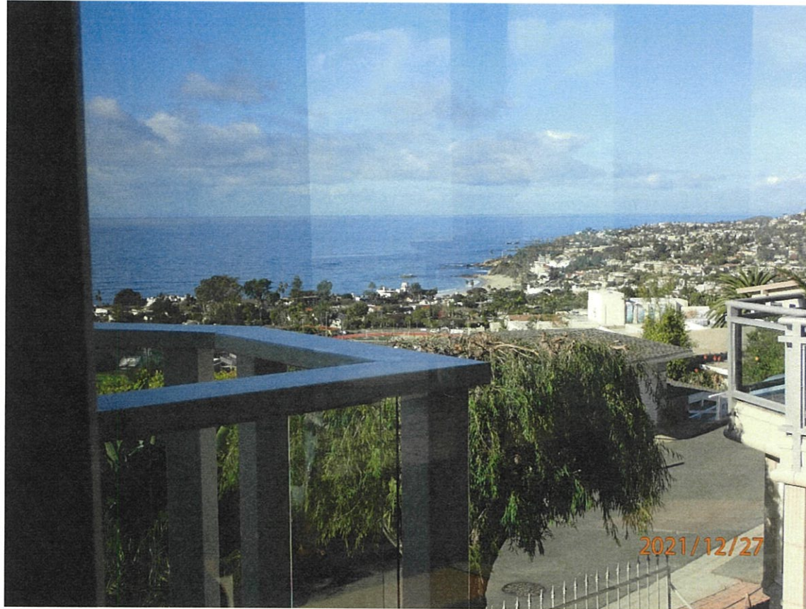
807 Buena Vista Way

The photograph above was taken from sitting in the dining room on the main level of the primary residential structure. Visual scene description: Catalina Island, Main Beach, Hotel Laguna, Heisler Park, whitewater and the ocean horizon.