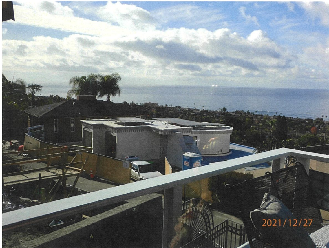
807 Buena Vista Way

The photograph above was taken from the living room on the main level of the primary residential structure.