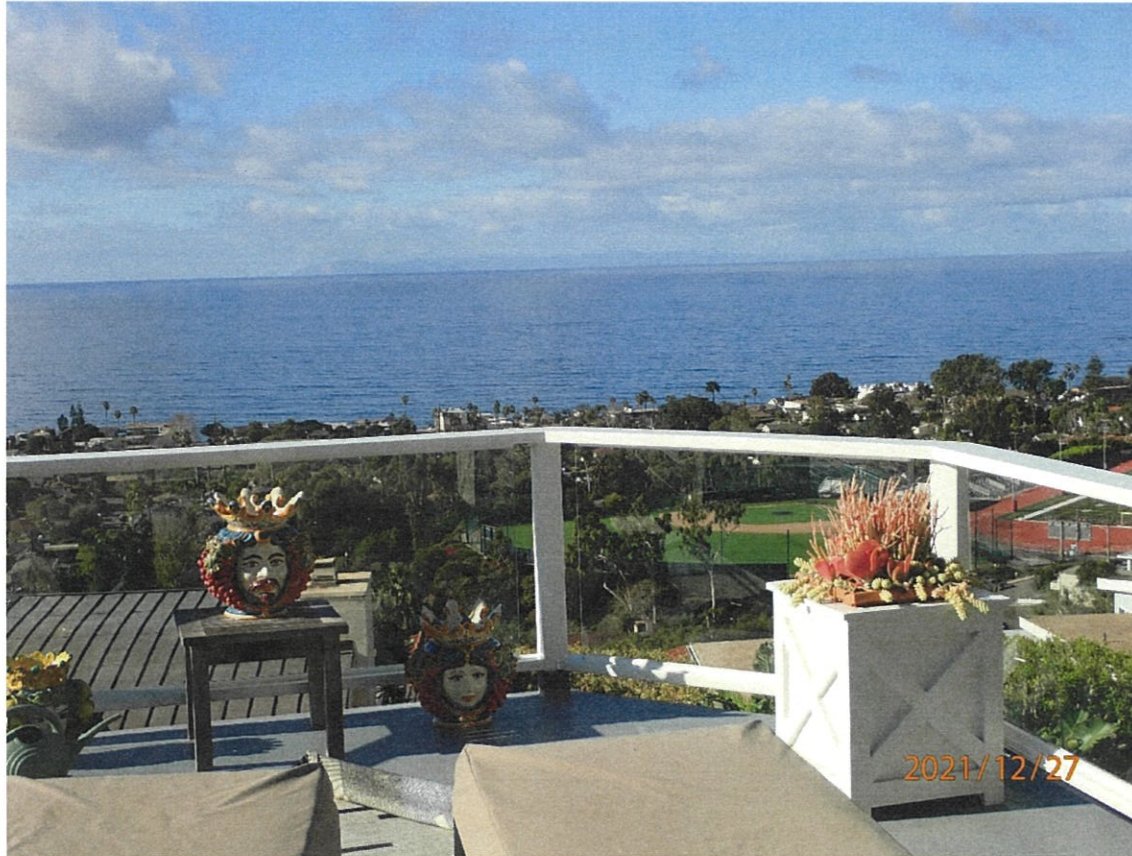
807 Buena Vista Way

The photograph above was taken from the master bedroom on the upper level of the primary residential structure. Visual scene description: Catalina Island, Main Beach, Hotel Laguna, Heisler Park, whitewater and the ocean horizon.