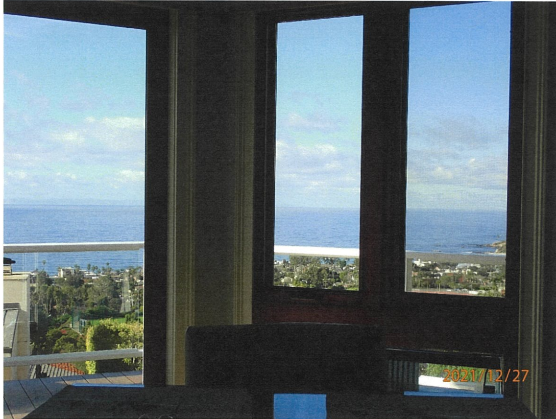
807 Buena Vista Way

The photograph above was taken from sitting in the dining room on the main level of the primary residential structure.