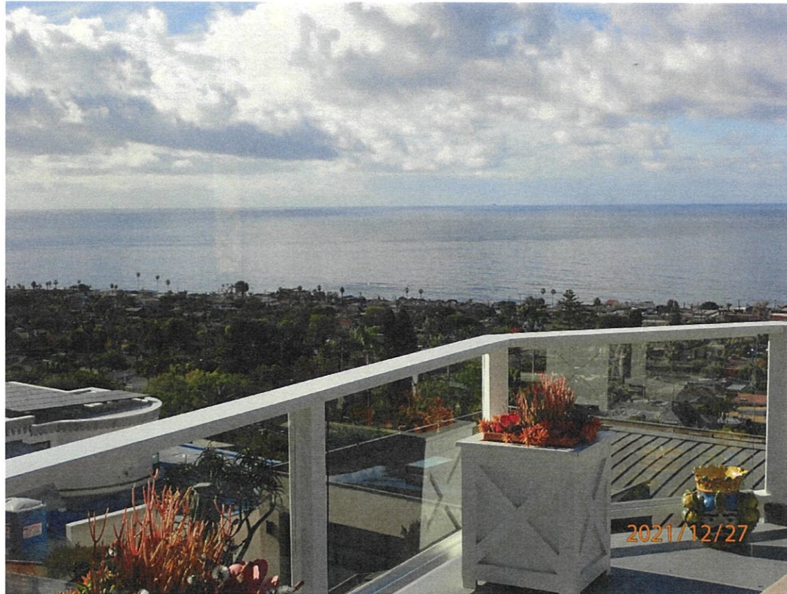
807 Buena Vista Way

The photograph above was taken from the master bedroom on the upper level of the primary residential structure. Visual scene description: Catalina Island, Main Beach, Hotel Laguna, Heisler Park, whitewater and the ocean horizon.