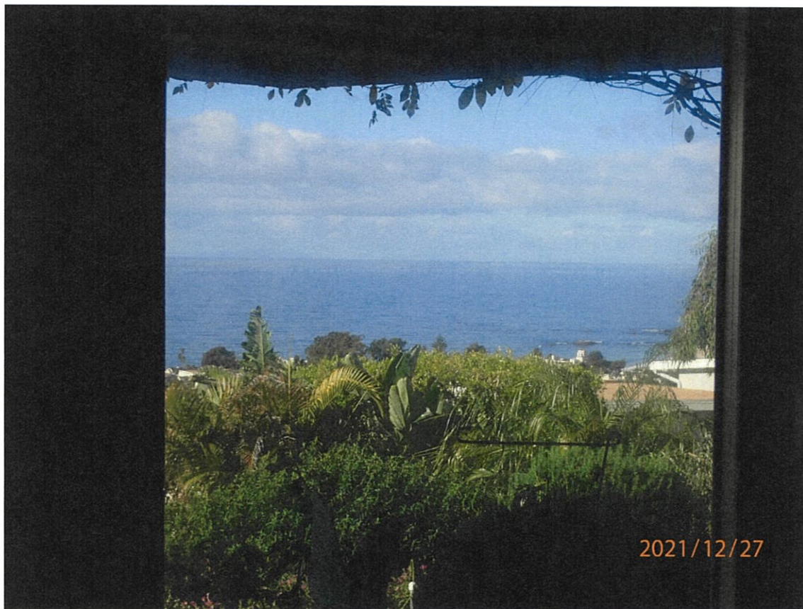
807 Buena Vista Way

The photograph above was taken from the guest bedroom on the lower level of the primary residential structure.