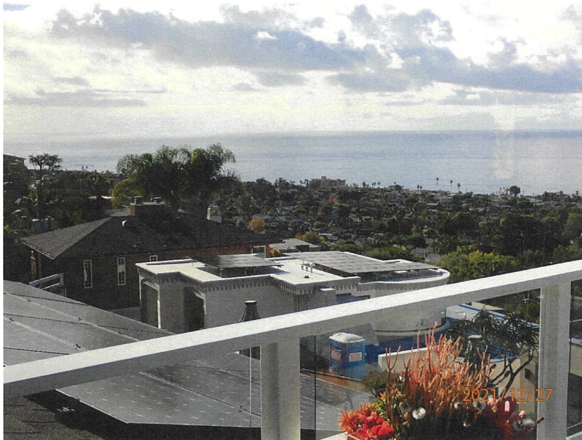
807 Buena Vista Way

The photograph above was taken from the master bedroom on the upper level of the primary residential structure. Visual scene description: Catalina Island, Main Beach, Hotel Laguna, Heisler Park, whitewater and the ocean horizon.