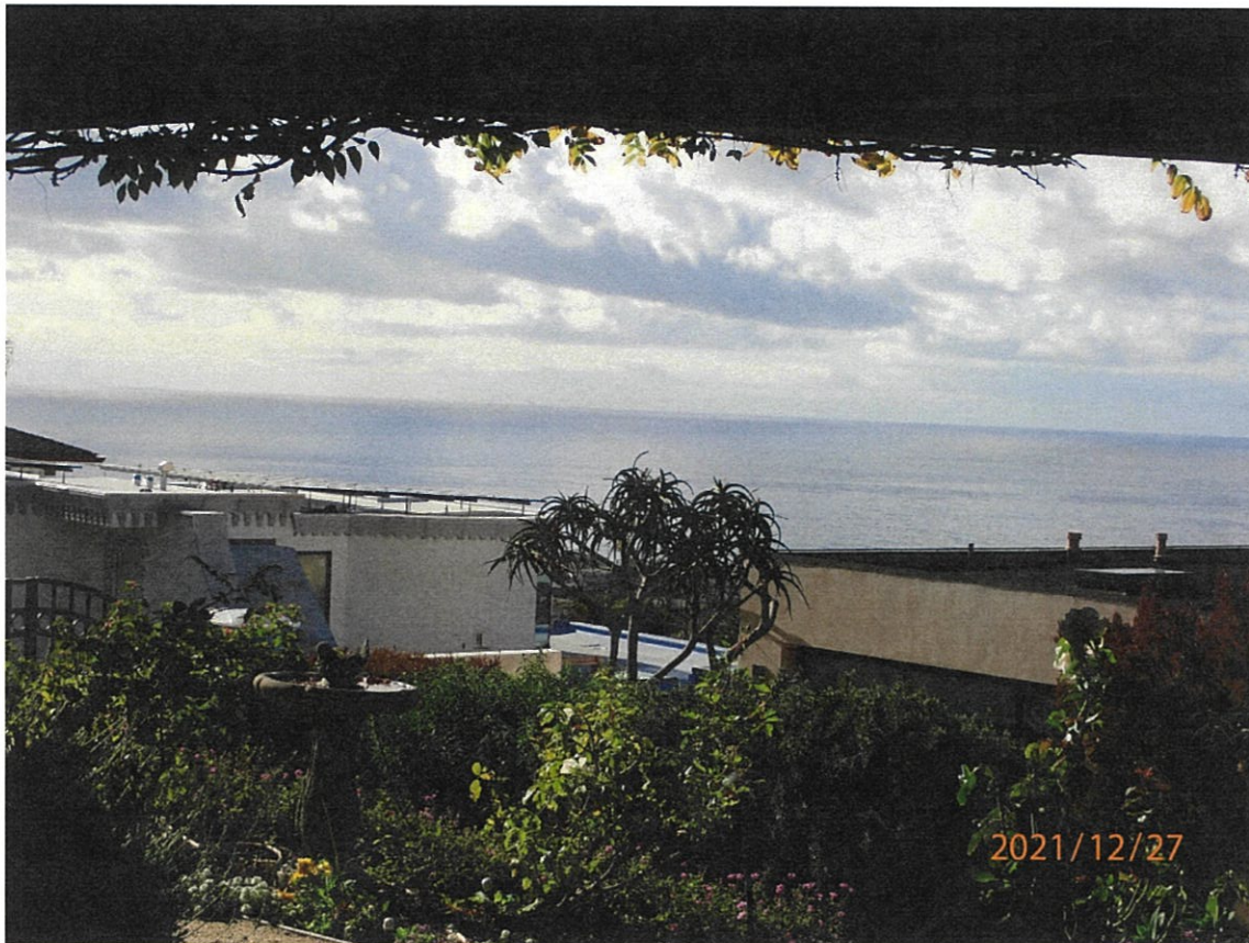
807 Buena Vista Way

The photograph above was taken from the guest bedroom on the lower level of the primary residential structure.