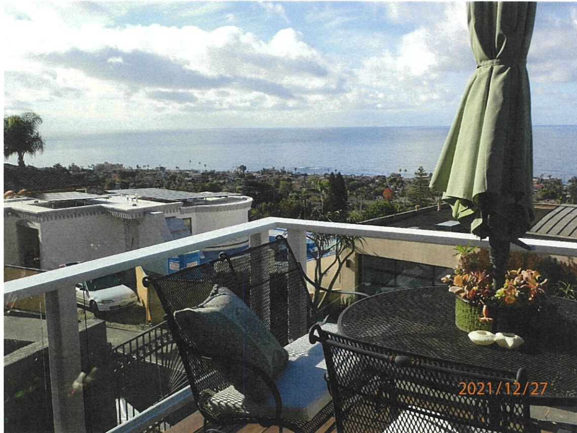
807 Buena Vista Way

The photograph above was taken from the living room on the main level of the primary residential structure.