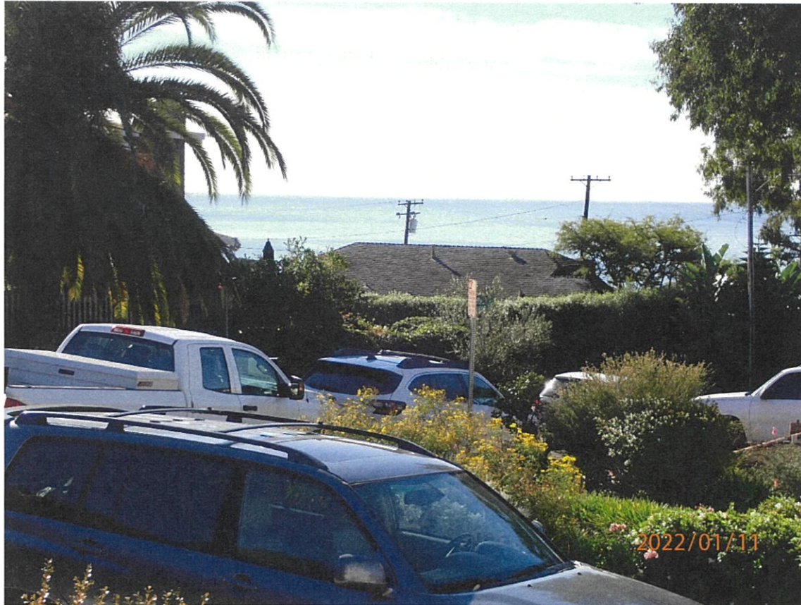
464 Linden St.

The photograph above was taken from the living room/dining room on the main level of the primary residential structure.