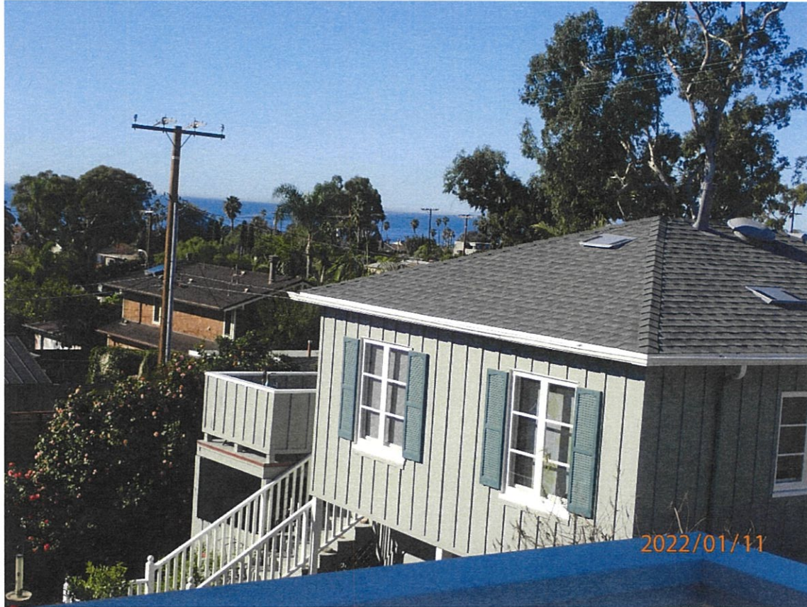
464 Linden St.

The photograph above was taken from the master bedroom on the upper level of the primary residential structure.