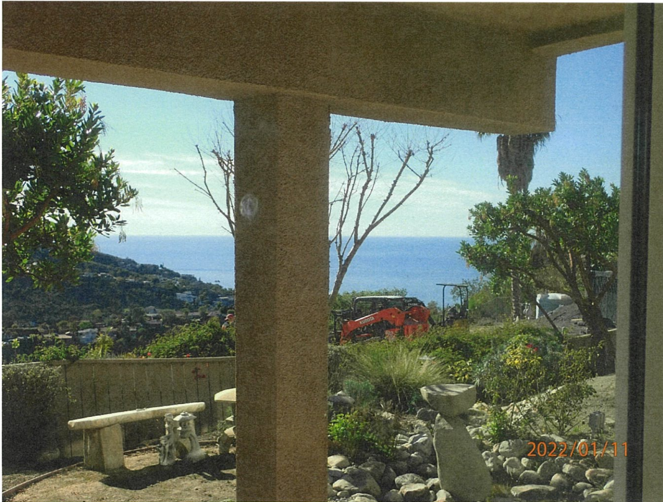
2125 Temple Hills Drive

The photograph above was taken from the family room on the lower level of the primary residential structure.