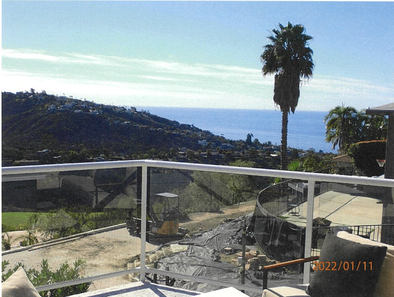
2125 Temple Hills Drive

The photograph above was taken from the dining room/living room on the main floor of the primary residential structure.