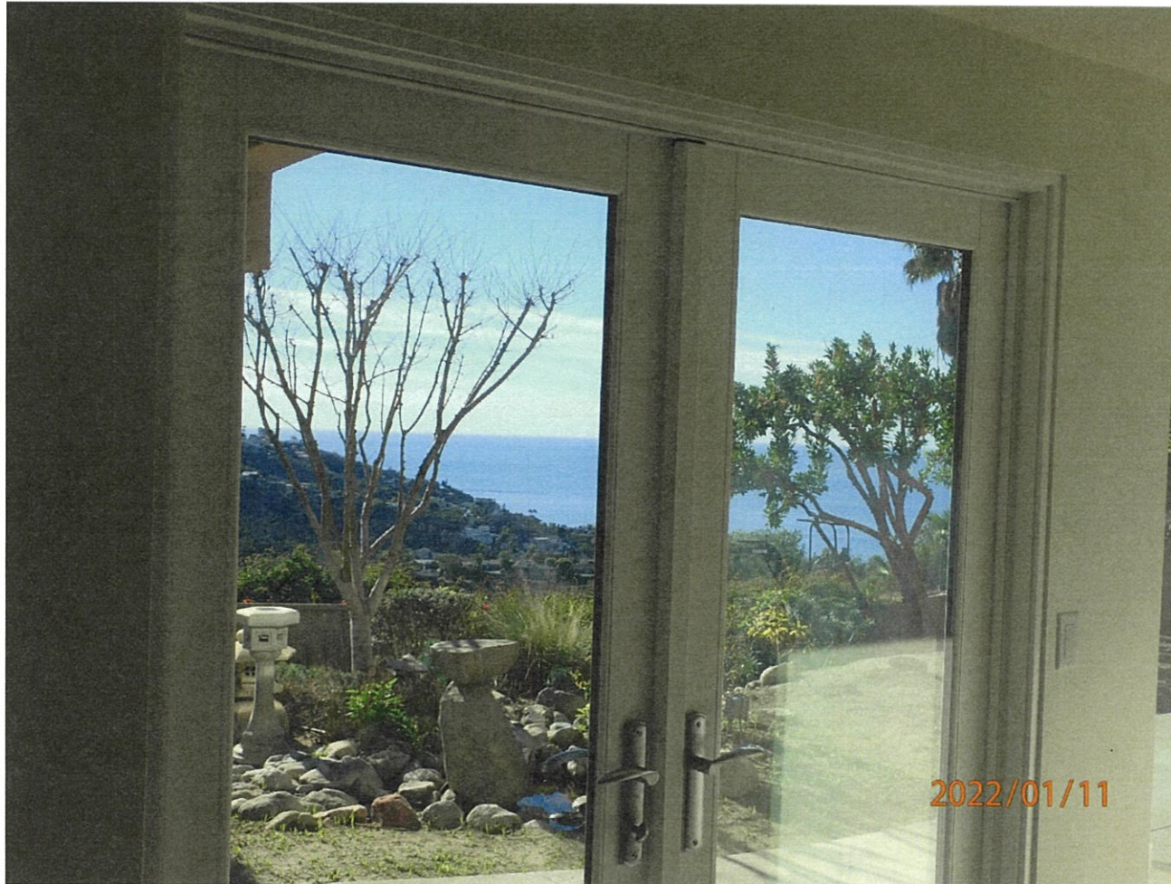
2125 Temple Hills Drive

The photograph above was taken from the family room on the lower level of the primary residential structure.