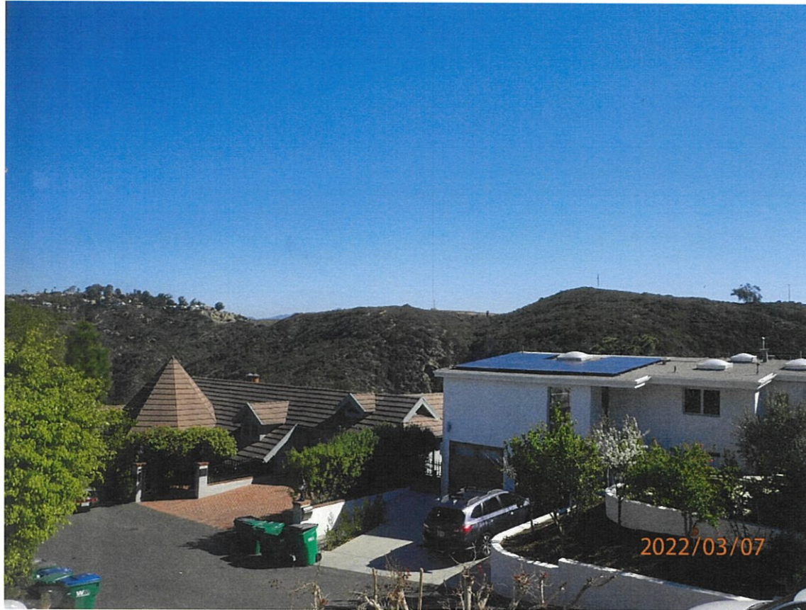
1211 Miramar St.

The photograph above was taken from the office on the upper level of the primary residential structure.