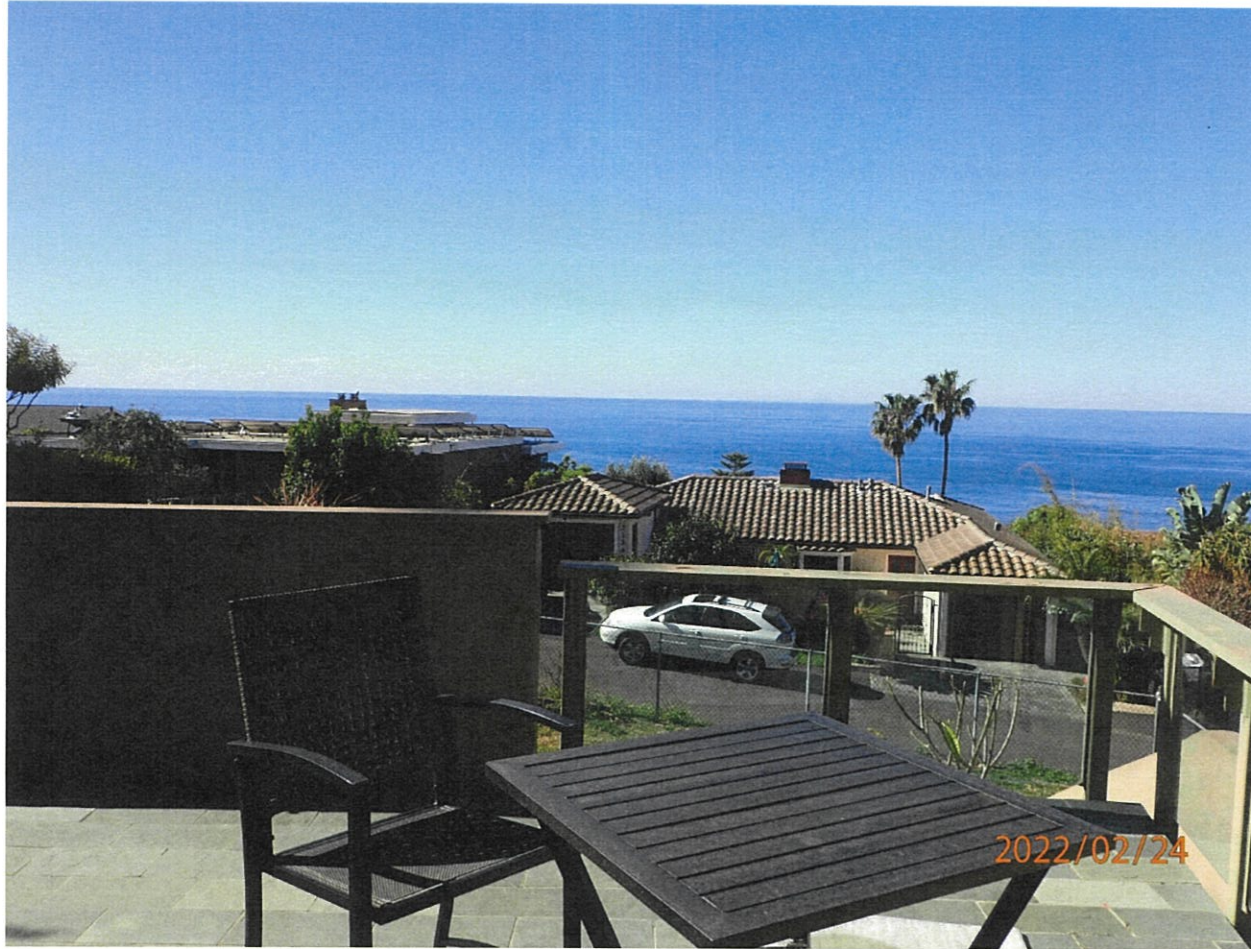
31341 Pedro Street

The photograph above was taken from the playroom on the lower level of the primary residential structure.