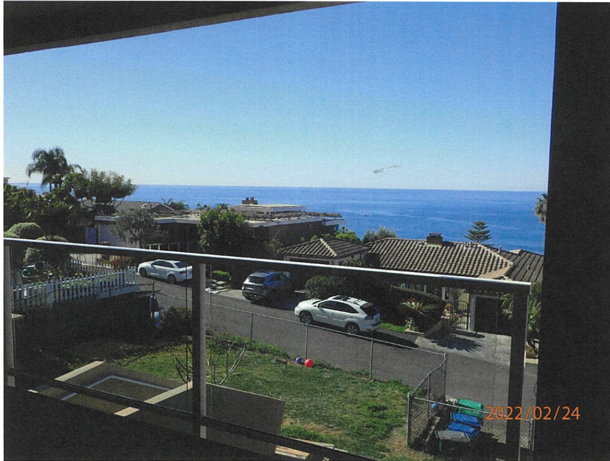
31341 Pedro Street

The photograph above was taken from the master bedroom on the lower level of the primary residential structure. Visual scene description: San Clemente Island and Catalina Island, Camel Point and the ocean horizon.