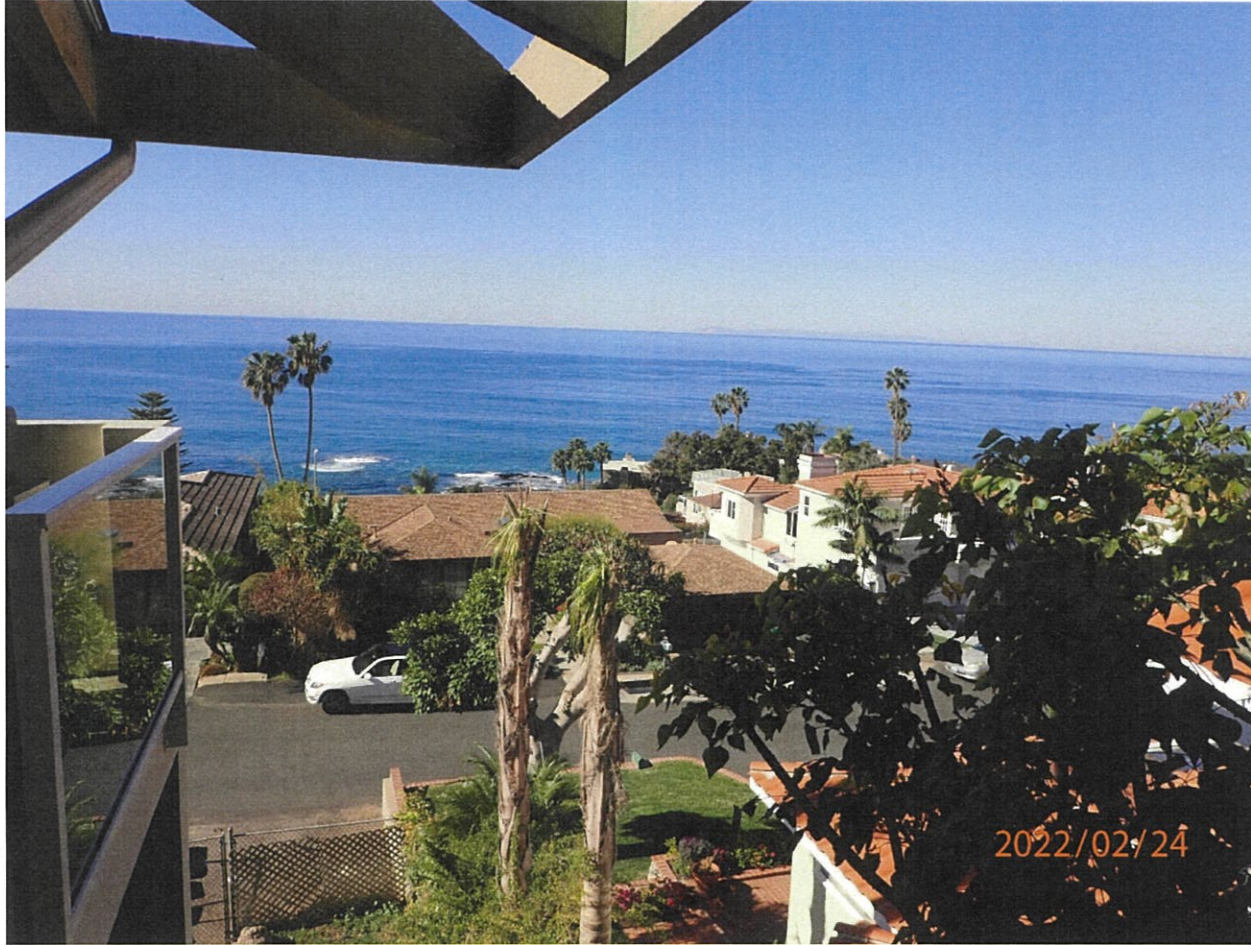
31341 Pedro Street

The photograph above was taken from the dining room/kitchen on the main upper level of the primary residential structure. Visual scene description: San Clemente Island and Catalina Island, Camel Point and the ocean horizon.