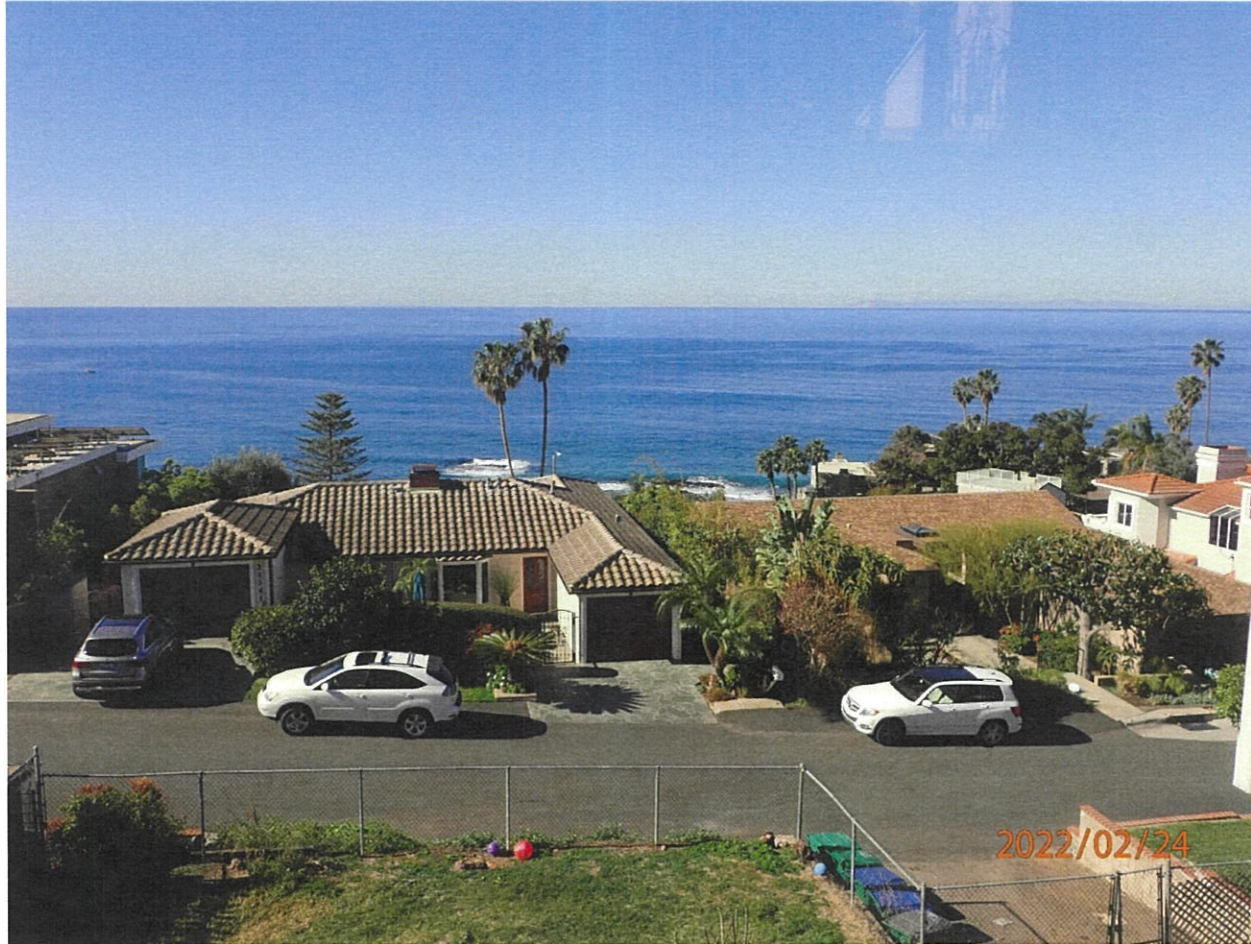
31341 Pedro Street

The photograph above was taken from the living room on the main upper level of the primary residential structure. Visual scene description: San Clemente Island and Catalina Island, Camel Point and the ocean horizon.