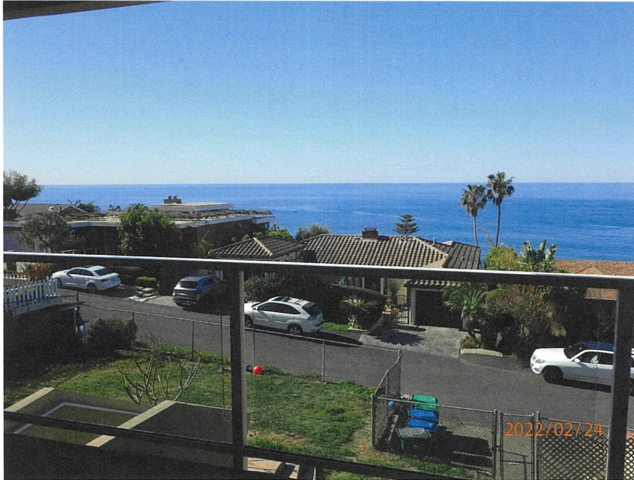
31341 Pedro Street

The photograph above was taken from the master bedroom on the lower level of the primary residential structure.