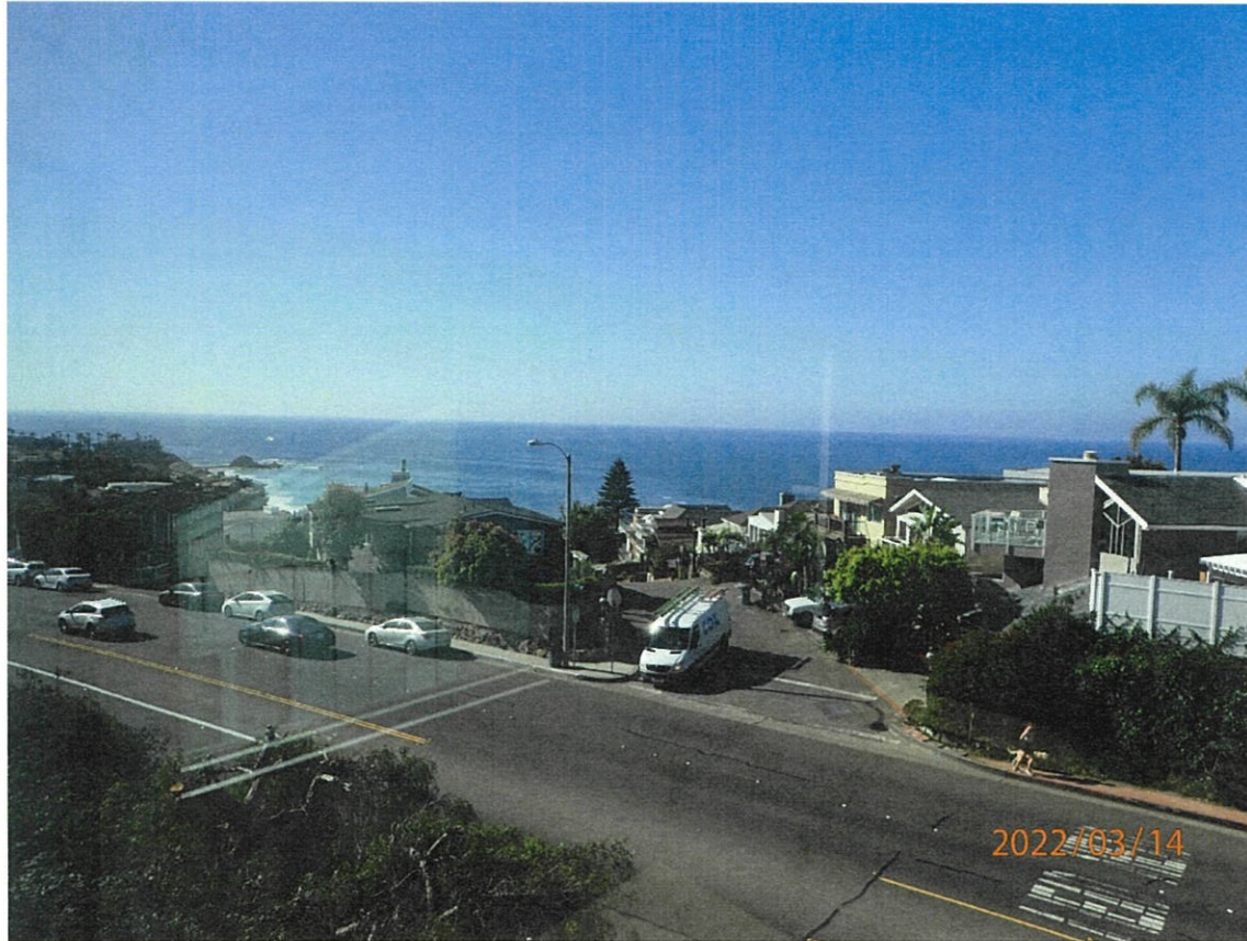
2742 S. Coast Hwy. & 2744 S. Coast Hwy.

The photograph above was taken from the living room/kitchen on the main level of the primary residential structure at 2742 SChy.