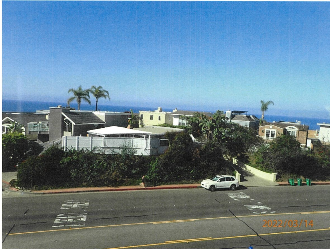
2742 S. Coast Hwy. & 2744 S. Coast Hwy.

The photograph above was taken from the living room/kitchen on the main level of the primary residential structure at 2742 SCHy.