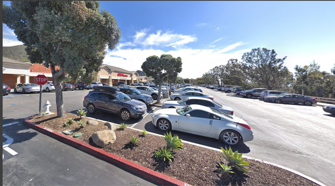
Aliso Creek Shopping Center (strip mall development)