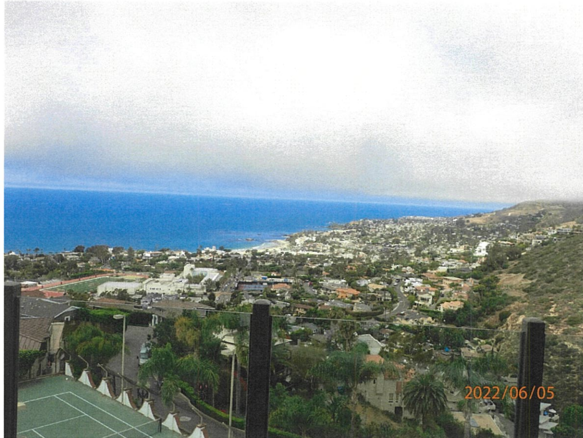
1640 Thurston Dr.

The photograph above was taken from the dining room on the main level of the primary residential structure.