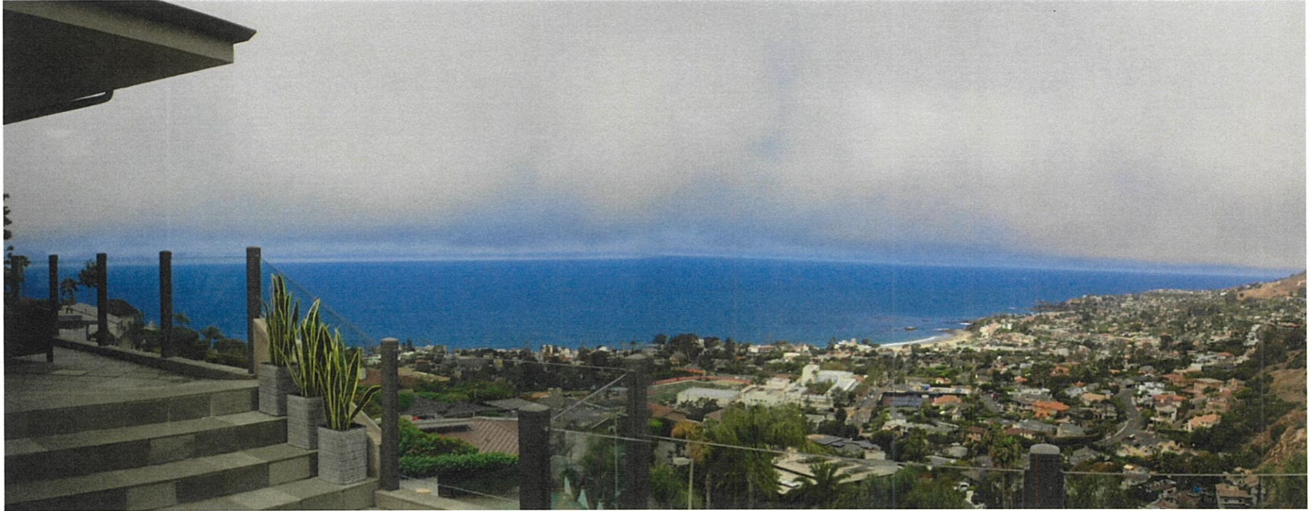
1640 Thurston Dr.

The photograph above was taken from the bar area on the main level of the primary residential structure.