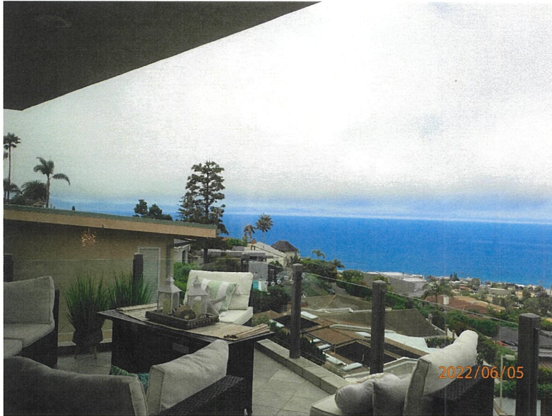
1640 Thurston Dr.

The photograph above was taken from the dining room on the main level of the primary residential structure.