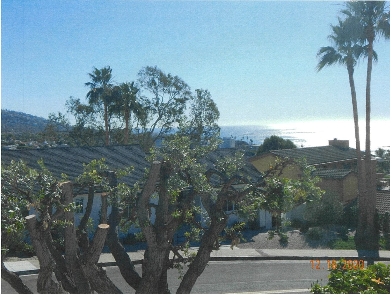
528 Poplar Street

The photograph above was taken from the living room on the main level of the primary residential structure.