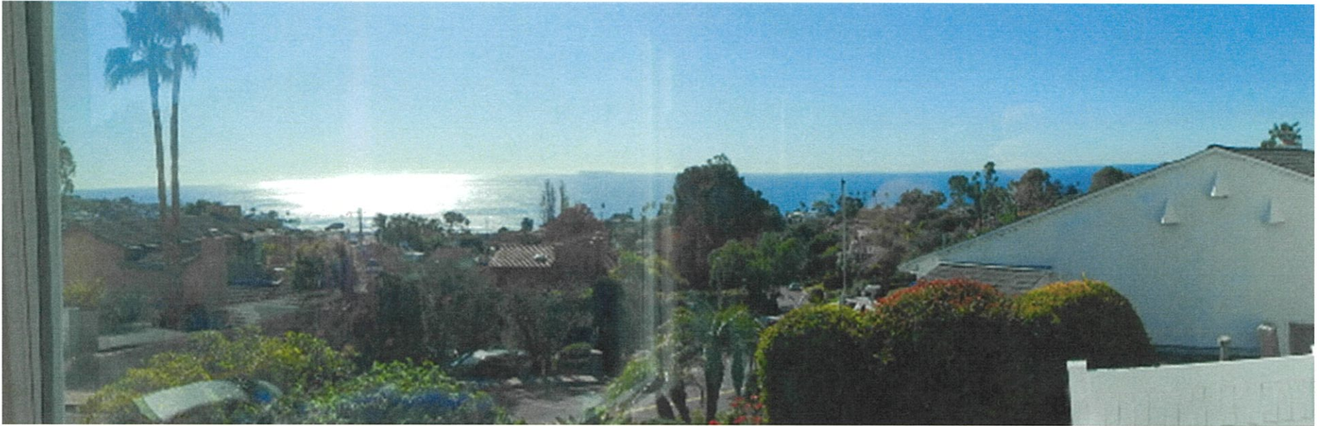
528 Poplar Street

The photograph above was taken from the living room on the main level of the primary residential structure.