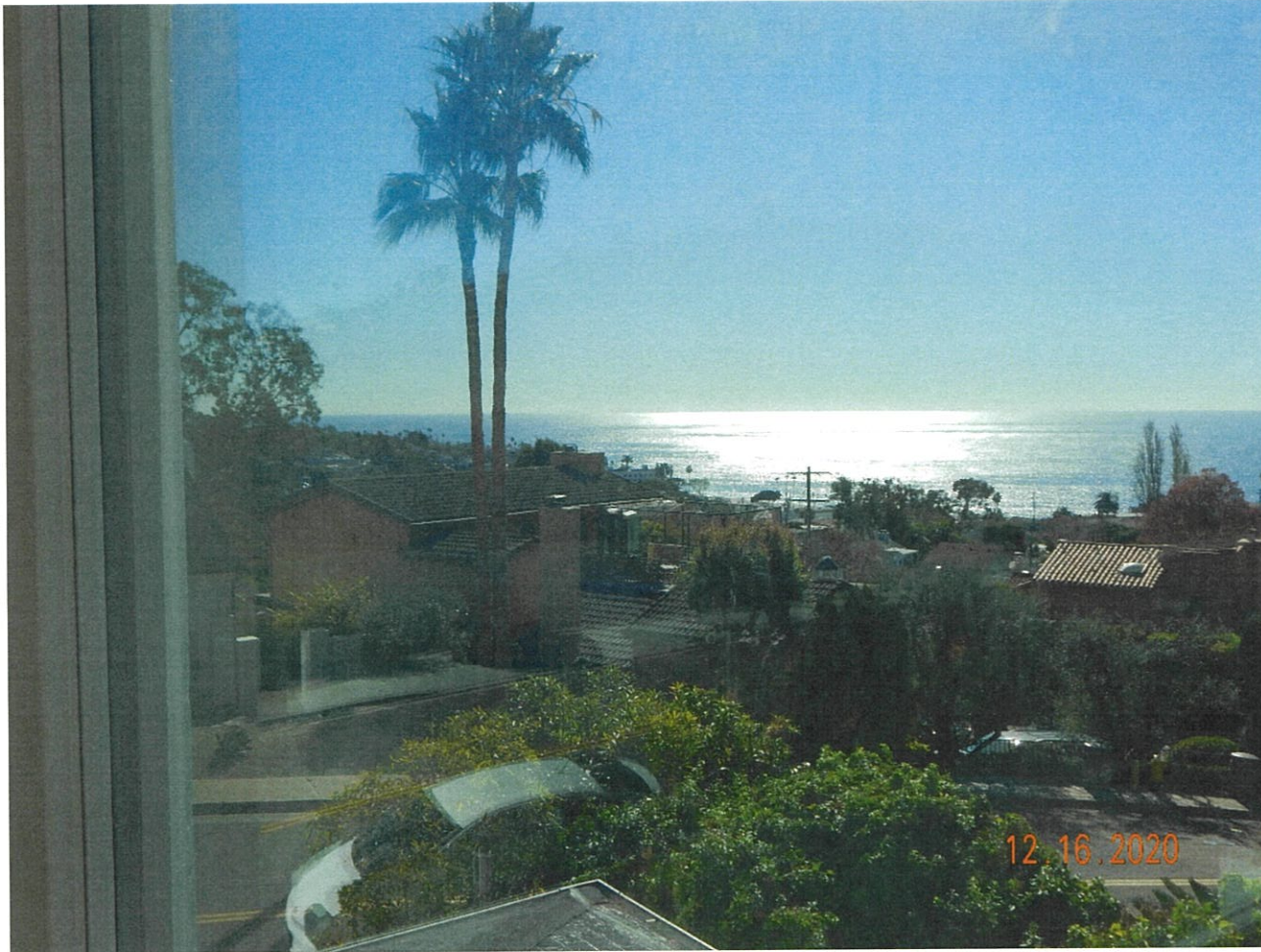
528 Poplar Street

The photograph above was taken from the living room on the main level of the primary residential structure.