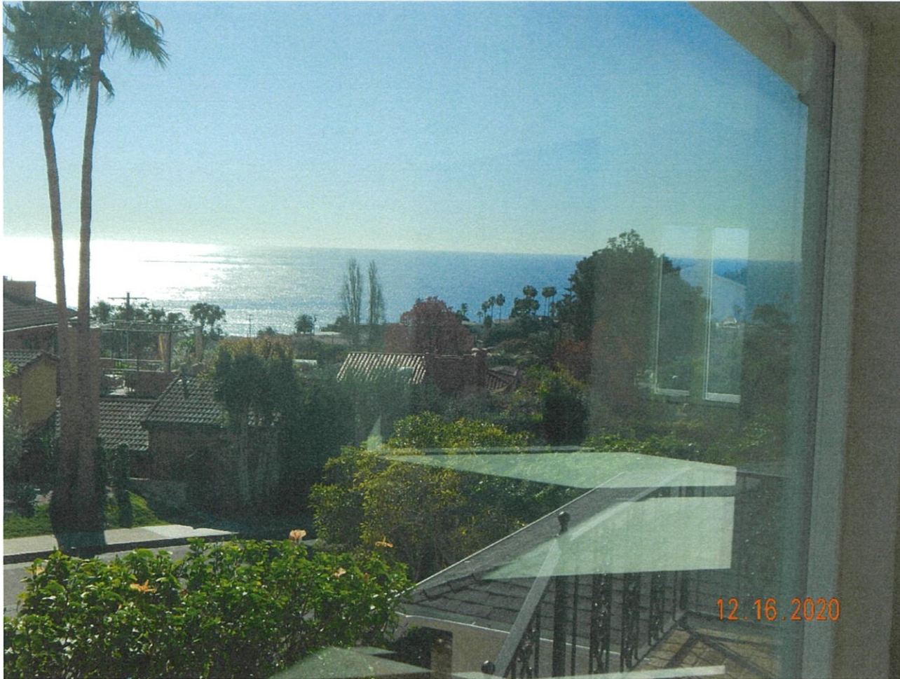
528 Poplar Street

The photograph above was taken from the living room on the main level of the primary residential structure.