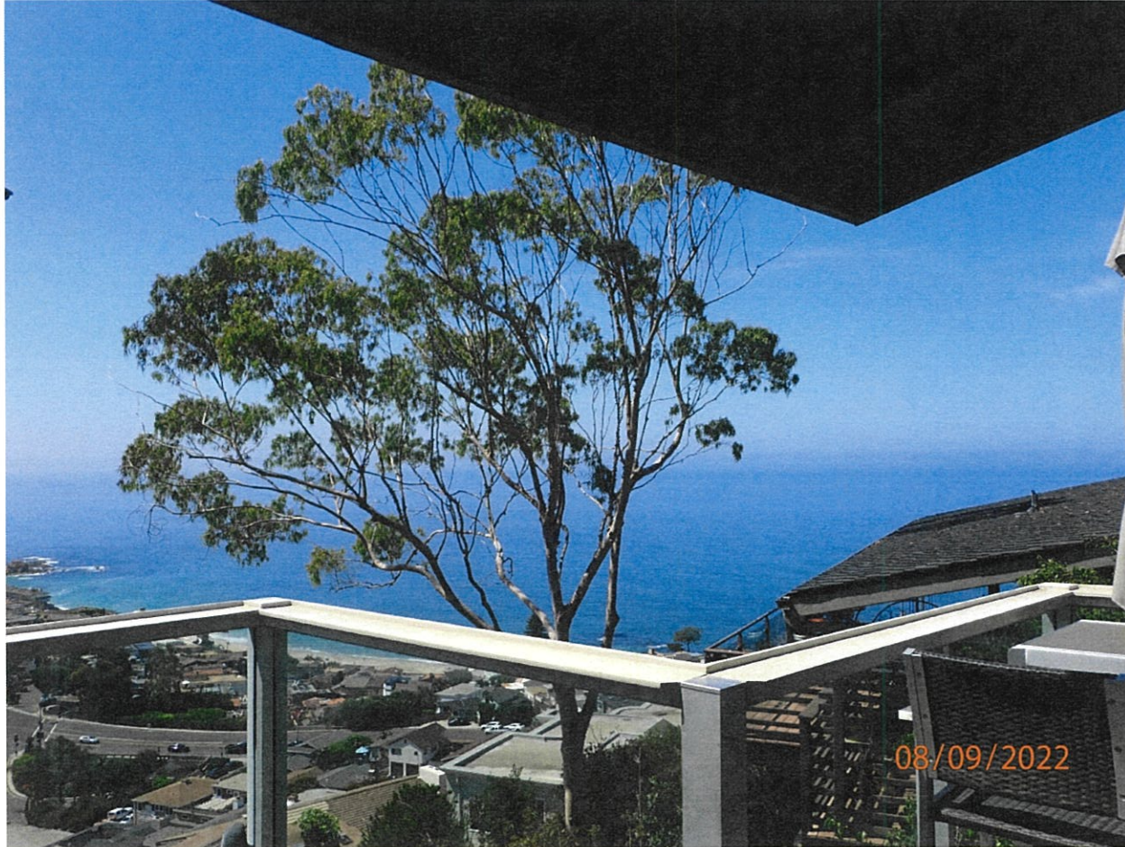
2702 Pala Way

The photograph above was taken from the living room on the main level of the primary residential structure.