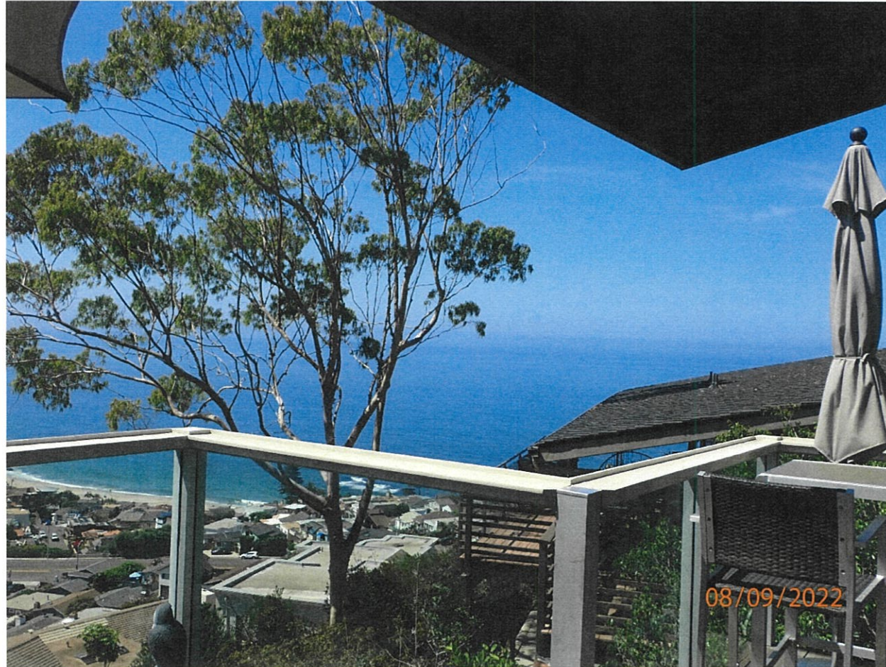
2702 Pala Way

The photograph above was taken from the living room on the main level of the primary residential structure.