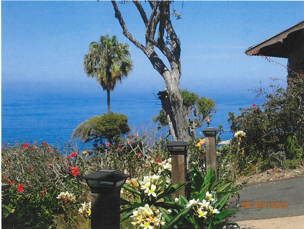
2702 Pala Way

The photograph above was taken from the office on the main level of the primary residential structure.