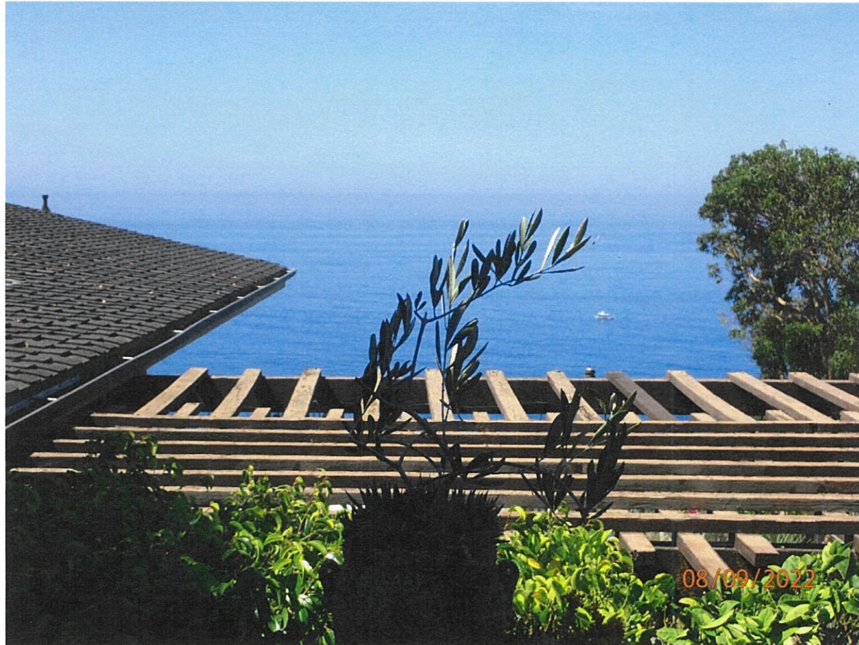
2702 Pala Way

The photograph above was taken from the office on the main level of the primary residential structure.