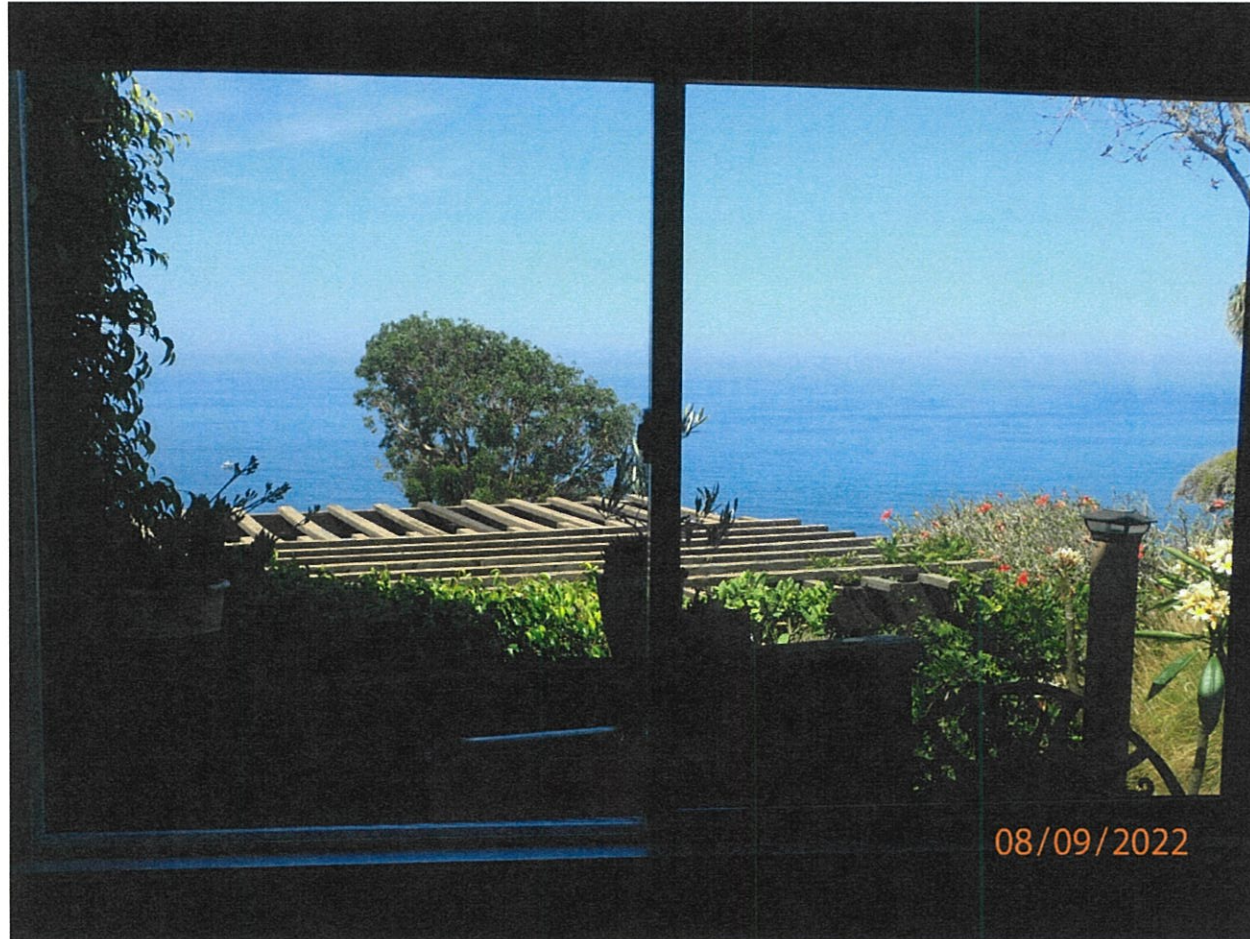
2702 Pala Way

The photograph above was taken from the office on the main level of the primary residential structure.