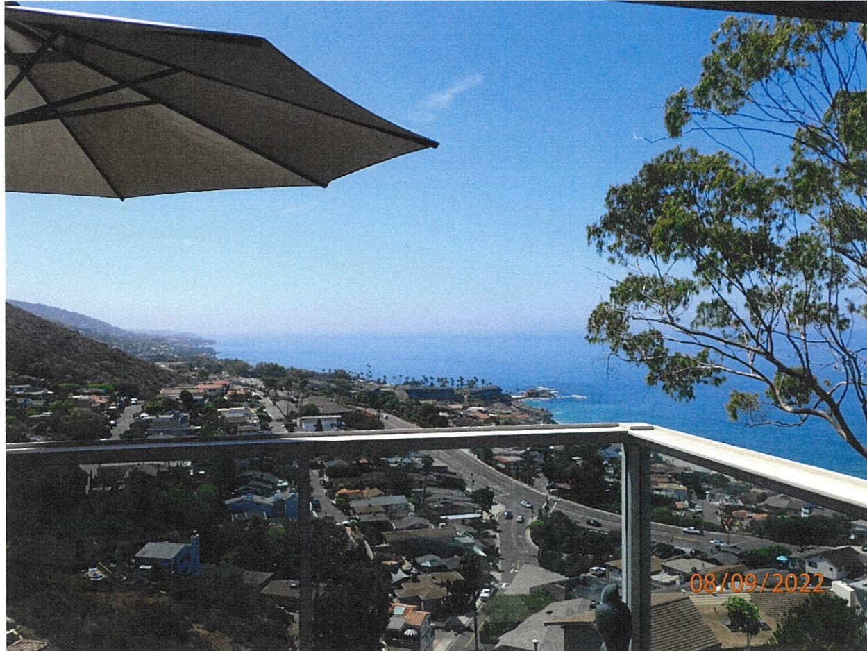
2702 Pala Way

The photograph above was taken from the living room on the main level of the primary residential structure.