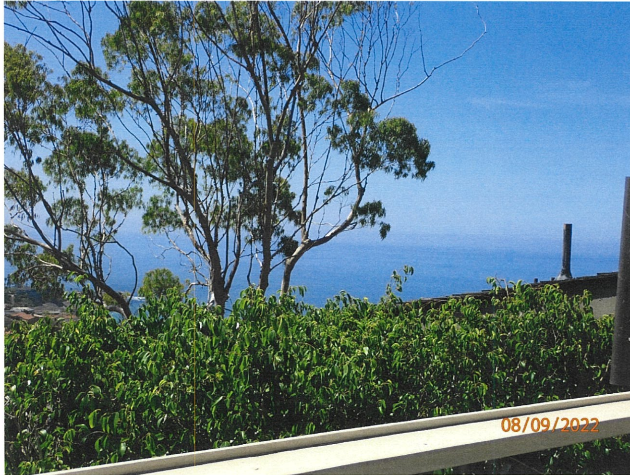
2702 Pala Way

The photograph above was taken from the primary bedroom on the main level of the primary residential structure.