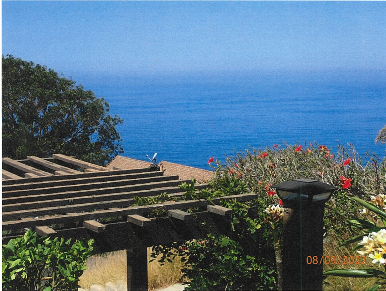
2702 Pala Way

The photograph above was taken from the office on the main level of the primary residential structure.