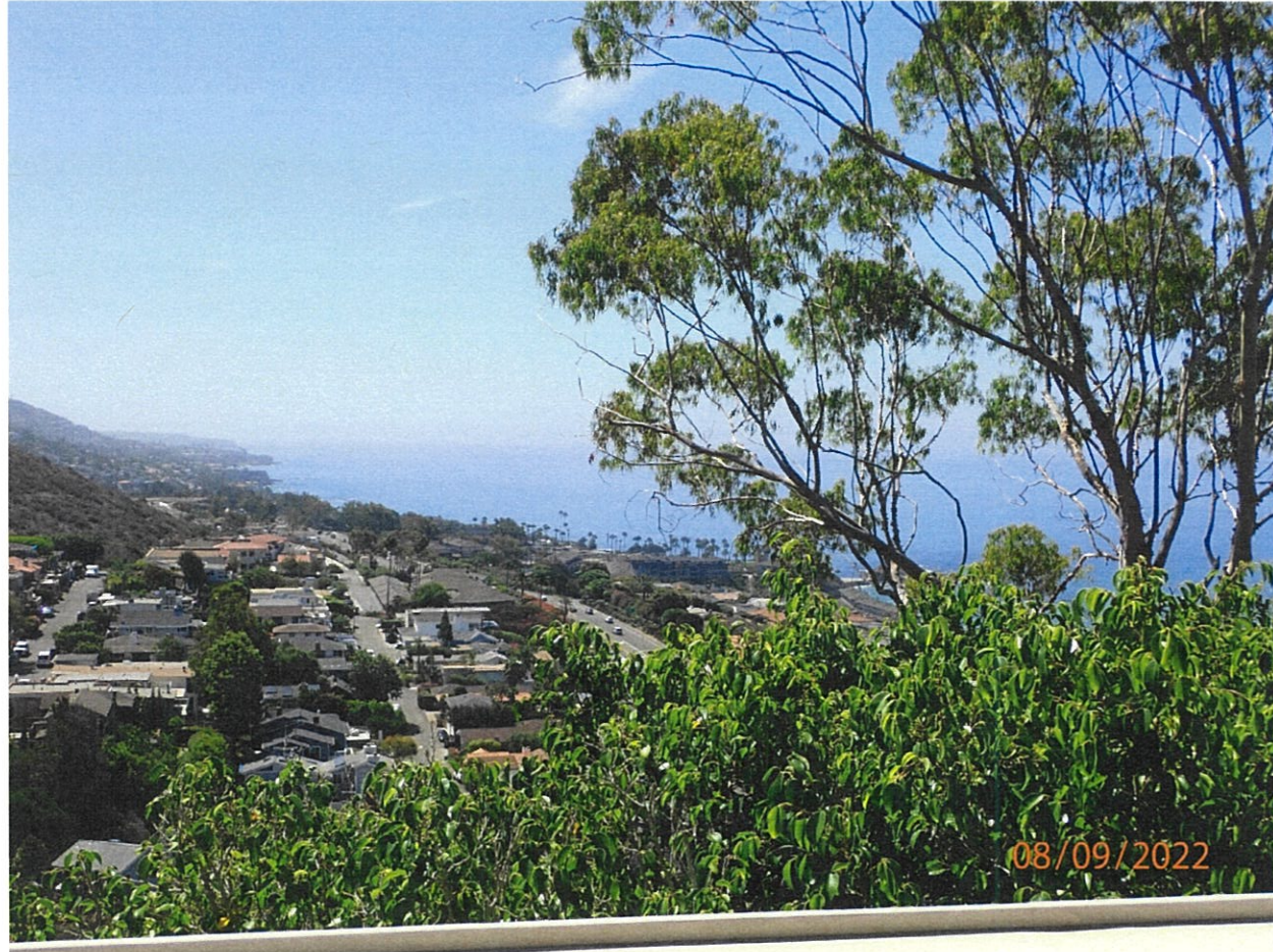
2702 Pala Way

The photograph above was taken from the primary bedroom on the main level of the primary residential structure. Visual scene: San Clemente Island, Victoria Beach, Goff Island, Christmas Cove, Lagunita Beach, whitewater and the ocean horizon.