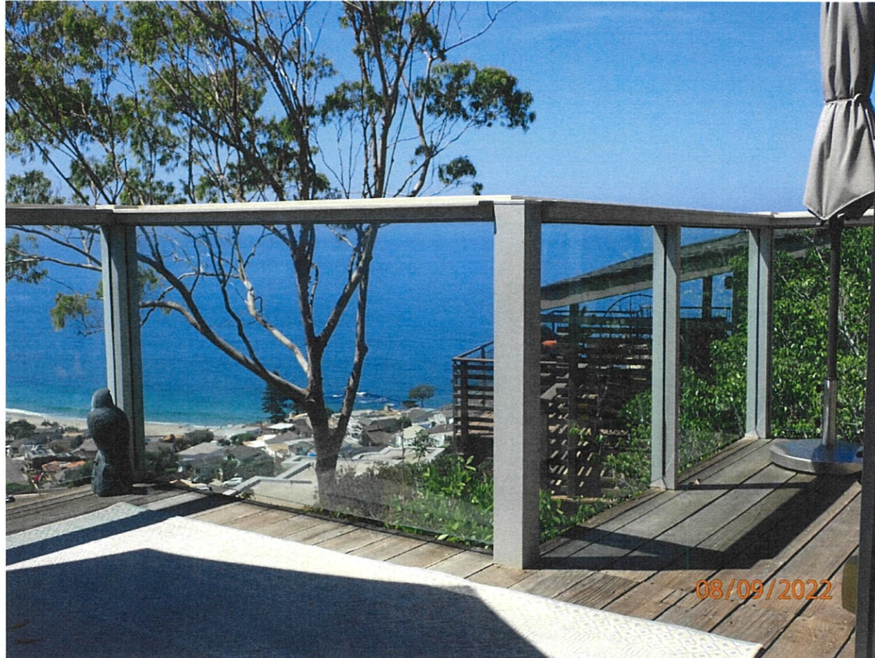
2702 Pala Way

The photograph above was taken sitting in the living room on the main level of the primary residential structure.