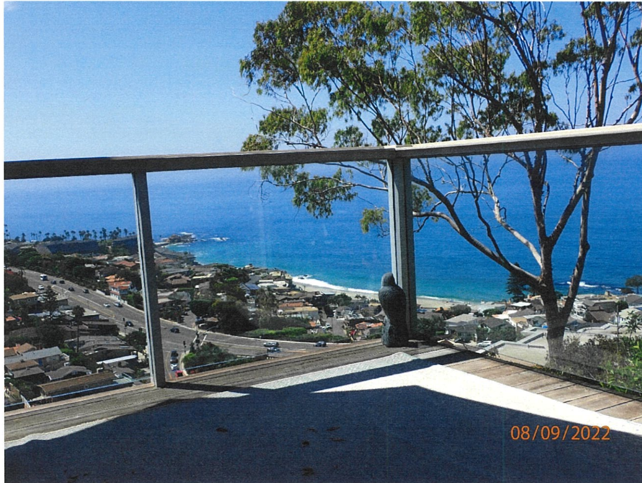
2702 Pala Way

The photograph above was taken sitting in the living room on the main level of the primary residential structure.