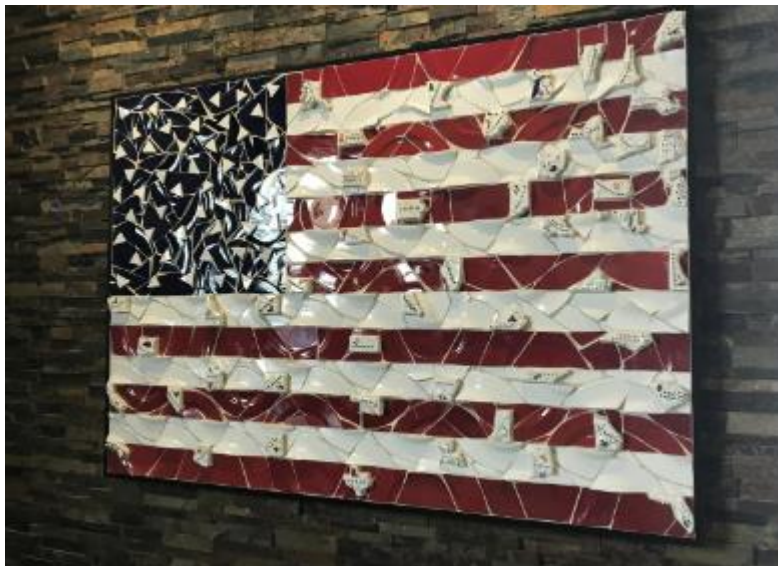
Sample of work