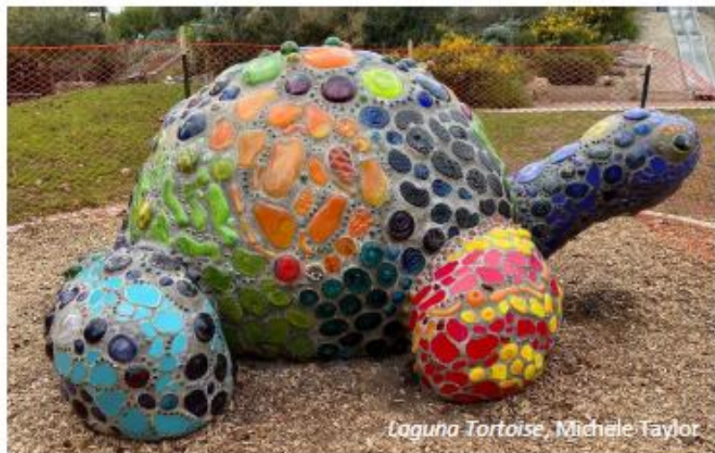
Laguna Tortoise, Michele Taylor

"Streamline Bench" is scheduled to be cleaned and relocated to the corner of Ocean Avenue and Beach Street.