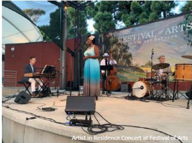
Artist in Residence Concert at Festival of Arts

Arts & Economic Prosperity Report: The City has funded for participation in its fourth consecutive "Arts & Economic Prosperity Report." City staff, Commissioners, local organizations, and volunteers have been collecting surveys for Americans for the Arts' sixth economic impact study of the nonprofit arts and culture industry in the United States.