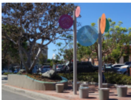
"Road Blossoms" Laguna Beach, 2015 by Shin Gray Studio

Yearly Treatment: The perimeters will be swept and cleared of any dirt, cobwebs, and other detritus. The cement surfaces will be power washed, or scrubbed with soap and water in order to effectively clean the structure. After cleaned and dried, the cement sculpture will then be sealed using a premium concrete sealer.