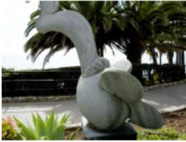
"2001 #1", 1999, by Jerry Rothman

Yearly Treatment: The sculpture will be cleared of dirt, dust, cobwebs, and any imperfections using soft clean cloths and/or clean, dry brushes. The cleaned concrete surfaces will then be sealed to protect the surface from crumbling. The stainless steel bench will be passivated. The surrounding area will then be treated with an all natural bug repellent to help reduce cobwebs. Any concrete repairs will be addressed.