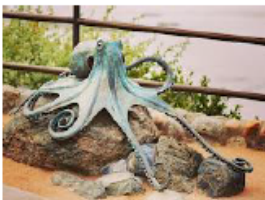
"Tidepool Kraken", 2017 by Casey Parlette

Yearly Treatment: The perimeters will be swept and cleared of any dirt, cobwebs, and other detritus. The cement surfaces will be power washed, or scrubbed with soap and water in order to effectively clean the structure. After cleaned and dried, the cement sculpture will then be sealed using a premium concrete sealer. Natural bug repellent will be applied to the surrounding areas.