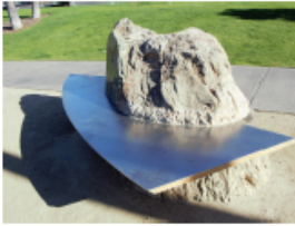
"Rock Pile Carve", 2000 by George Stone