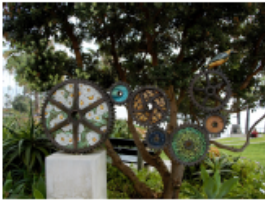
"Time Connected", 2012 by Scott and Naomi Schoenherr

Yearly Treatment: The sculpture will be cleared of any surrounding dirt, cobwebs, etc. using a broom and brushes. The ceramic mosaic will be cleaned using products to address lime and hard water deposits. After cleaning the surface it will then be sealed with a grout sealer where applicable. The perimeter will be treated with an all natural bug spray to reduce cobweb buildup.