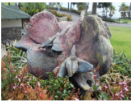
"In Central Park", 1999, by Jerry Rothman

Yearly Treatment: The sculpture will be cleared of dirt, dust, cobwebs, and any imperfections using soft clean cloths and/or clean, dry brushes. The ceramic surface will be cleaned using products to address lime and hard water deposits. After cleaning the surface it will then be sealed with a grout sealer. The surrounding area will then be treated with an all natural bug repellent to help reduce cobwebs.