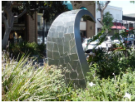
"North and South Waves", 2003 by Larry Gill

Yearly Treatment: The sculpture will be cleared of dirt, dust, cobwebs, and any imperfections using soft clean cloths and/or clean, dry brushes. The cleaned bronze surfaces will then be waxed to protect the metal. The surrounding area will then be treated with an all natural bug repellent to help reduce cobwebs. The concrete pedestal will be sealed, when needed, with a premium concrete sealer.