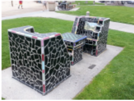
"Canyon Chess and Checkers", 1981 by Marlo Bartels

Yearly Treatment: The sculpture will be cleared of dirt, dust, cobwebs, and any imperfections using soft clean cloths and/or clean, dry brushes, or air pressure. The cleaned surfaces will then be refinished with patina, paint, and then sealed, when necessary- in order to protect the metal. The surrounding area will then be cleared and treated with an all natural bug repellent to help reduce cobwebs. The concrete base will be cleared of hard water deposits, and re-painted with an outdoor black satin paint. The lighting components will be addressed, either refitted or re-installed.