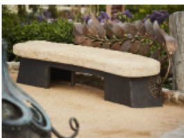
"Strand of Life", 2017 by Casey Parlette

Yearly Treatment: The sculpture will be cleared of dirt, dust, cobwebs, and any imperfections using soft clean cloths and/or clean, dry brushes. The cleaned bronze surfaces will then be waxed to protect the metal. The surrounding area will then be treated with an all natural bug repellent to help reduce cobwebs.