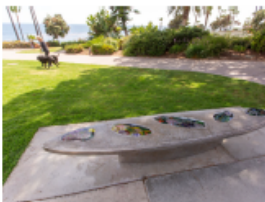
"Tidepool Paddleboard", 2012 by Larry Gill and Gavin Heath

Yearly Treatment: The sculpture will be cleared of any surrounding dirt, cobwebs, etc. and the ceramic surfaces will be cleaned using products to address lime and hard water deposits. After cleaning the surface it will then be sealed with a grout sealer. Any missing or broken tiles will be addressed as needed.