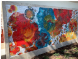
"Outburst", 2021 by Lynn Basa

Yearly Treatment: The sculpture will be cleared of any surrounding dirt, cobwebs, etc. and the ceramic surfaces will be cleaned using products to address lime and hard water deposits. After cleaning the surface it will then be sealed with a grout sealer. Any graffiti or broken and missing tiles will be addressed.