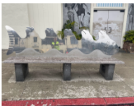
"Five Frog Bench", 2004 by Jon Alabaster

Yearly Treatment: The sculpture will be cleared of any surrounding dirt, cobwebs, etc. and the ceramic surfaces will be cleaned using products to address lime and hard water deposits. After cleaning the surface it will then be sealed with a grout sealer, and concrete surfaces will be sealed with a premium concrete sealer. Missing tiles will be addressed.