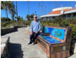
"Al's Bench", 2021 by Marlo Bartels

The sculpture will be cleared of dirt, dust, cobwebs, and any imperfections using soft clean cloths and/or clean, dry brushes. The ceramic surface will be cleaned using products to address lime and hard water deposits. After cleaning the surface it will then be sealed with a grout sealer. The surrounding area will then be treated with an all natural bug repellent to help reduce cobwebs.