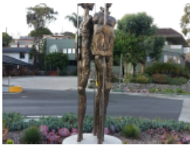
"Warriors United", 2013 by Cheryl Ekstrom