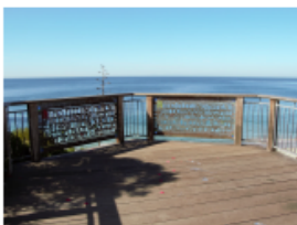
"Of Sight and Sound", 2002

Yearly Treatment: The sculpture will be cleared of dirt, dust, cobwebs, and any imperfections using soft clean cloths and/or clean, dry brushes. The cleaned bronze surfaces will then be waxed to protect the metal. The surrounding area will then be swept and power washed to remove algae and debris buildup. Then the area will be treated with an all natural bug repellent to help reduce cobwebs. Any graffiti will be removed with acetone prior to waxing or sealing.