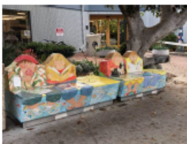
"Another Beautiful Day in Paradise", 2007 by Helma Bovenizer and Valerie Gorrell

Yearly Treatment: The perimeters will be swept and cleared of any dirt, cobwebs, and other detritus. The surfaces will be cleaned with lacquer thinner in order to effectively clean the structure. After cleaned and dried, the sculpture will then be sealed using a premium stone sealer.