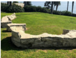
"A Rocky Ledge", 1984 by Julia Klemek and Leslie Robbins

Yearly Treatment: The sculpture will be cleared of dirt, dust, cobwebs, and any imperfections using soft clean cloths and/or clean, dry brushes. The cleaned ceramic surfaces will then be sealed, if applicable to, with grout sealer in order to protect it. The surrounding area will then be treated with an all natural bug repellent.