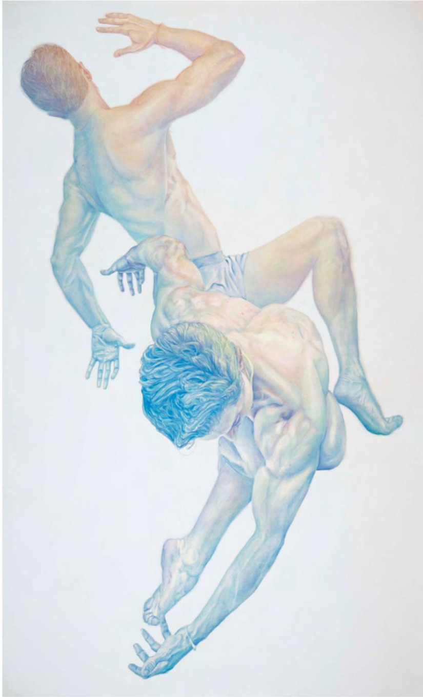
"Connor" 2022, Oil on Canvas, 64 x 40