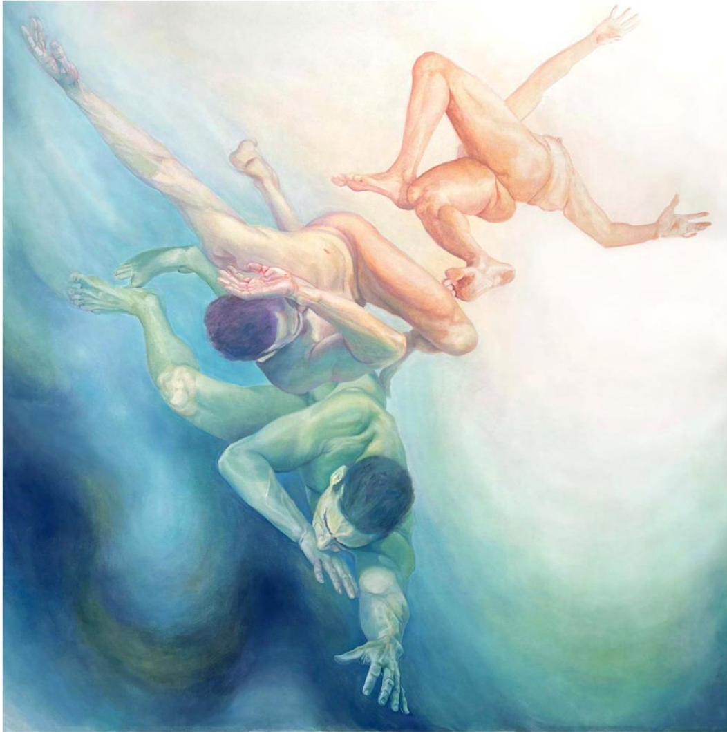
"White Male Dealing With His Shit" 2021, Oil on Canvas, 48x48 in