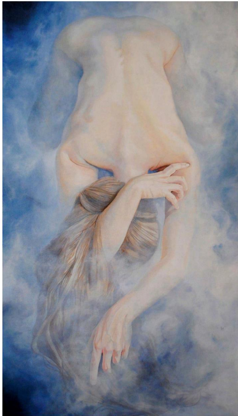
"Isola" 2020, Oil on Canvas, 20 x 40 in