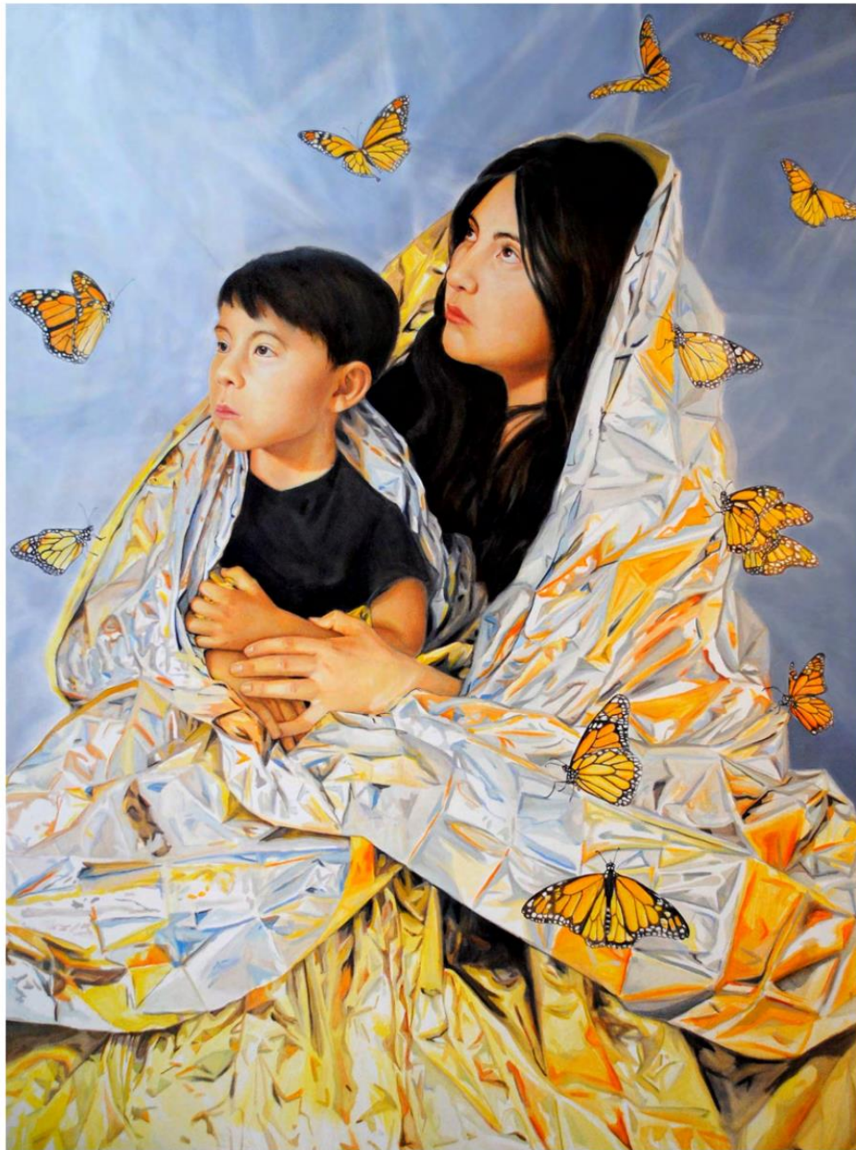
"A New Home" 2020, Oil on Canvas, 36x48 in