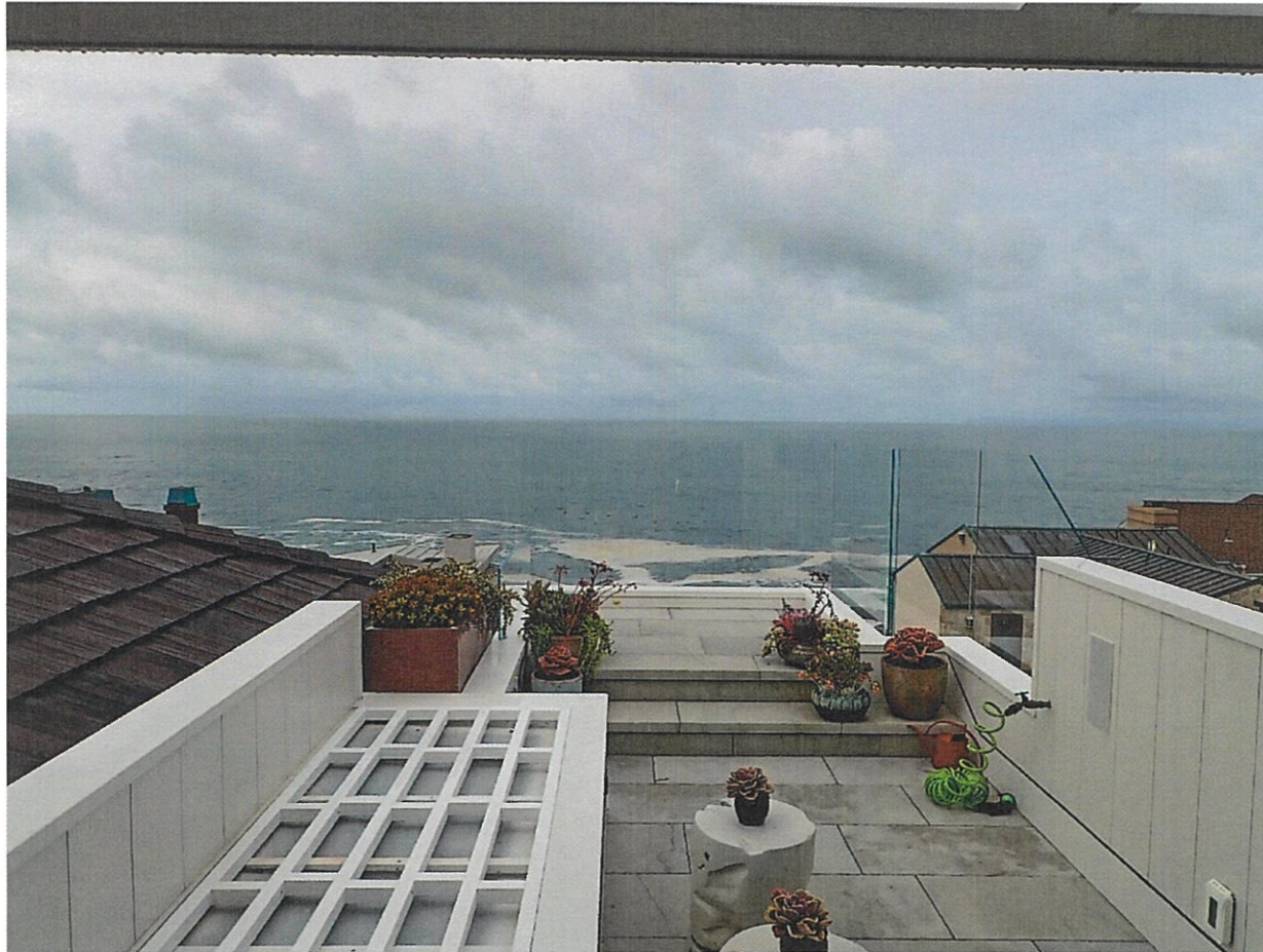
2040 Ocean Way

The photograph above was taken from the upstairs level of the primary residential structure.