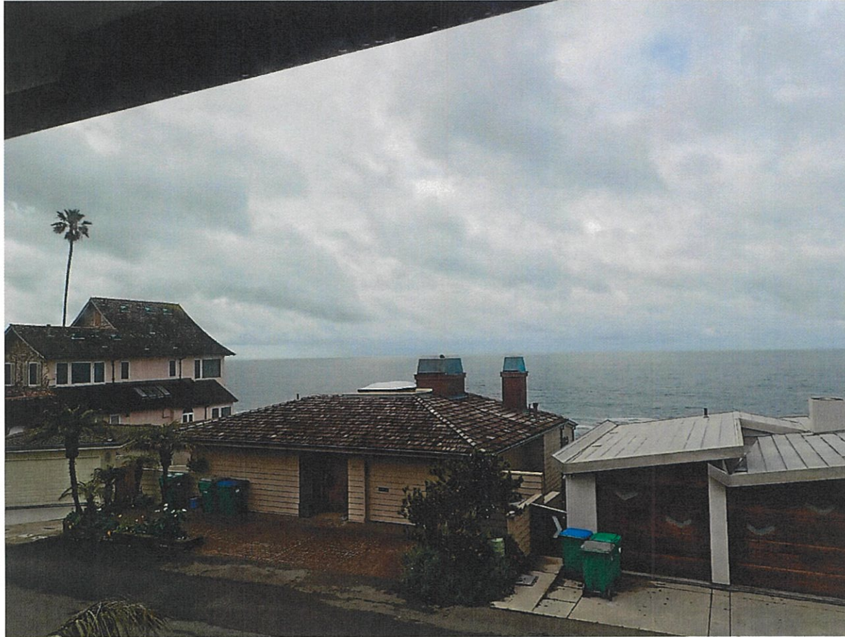
2040 Ocean Way

The panoramic photograph above was taken from the living room on the main level of the primary residential structure. Visual scene description: Ocean horizon.