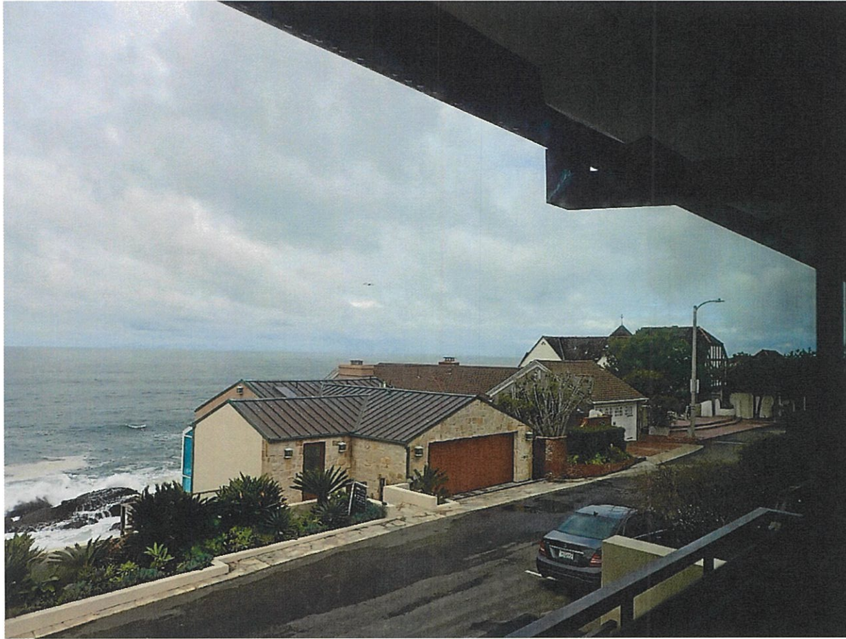
2040 Ocean Way

The panoramic photograph above was taken from the living room on the main level of the primary residential structure. Visual scene description: Catalina Island and ocean horizon.