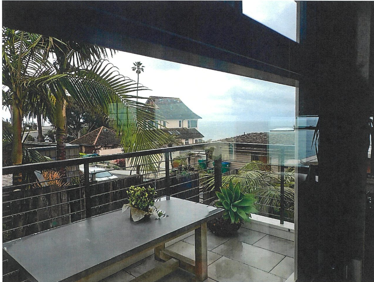
2040 Ocean Way

The photograph above was taken from the primary residential structure.