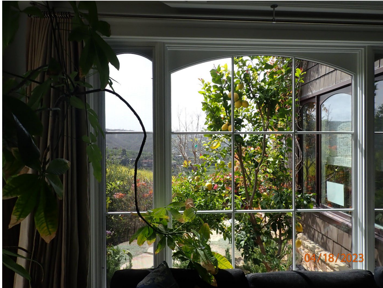
2001 Rim Rock Canyon Rd

The photograph above was taken from the main level of the primary residential structure.