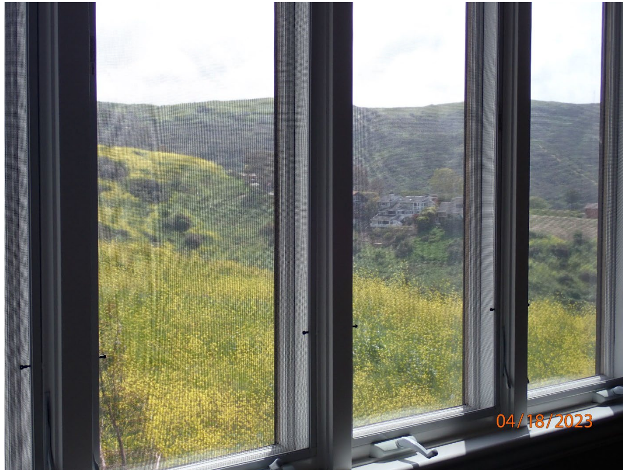
2001 Rim Rock Canyon Rd

The photograph above was taken from the upstairs level of the primary residential structure.