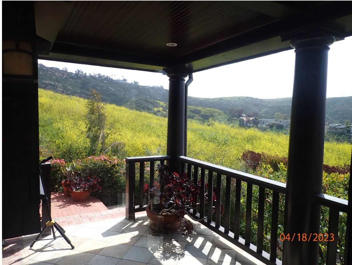
2001 Rim Rock Canyon Rd

The photograph above was taken from the main level of the primary residential structure.