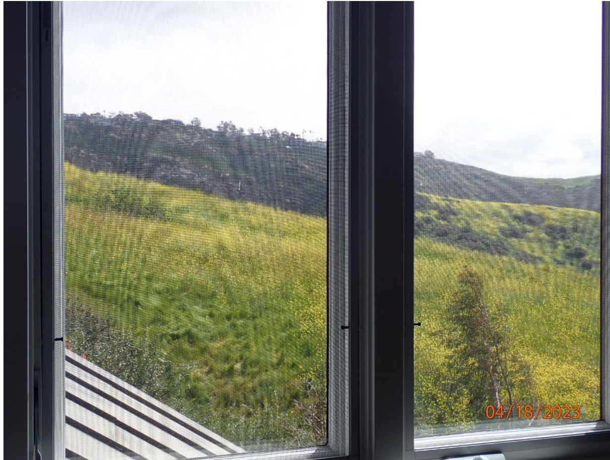
2001 Rim Rock Canyon Rd

The photograph above was taken from the upstairs level of the primary residential structure.