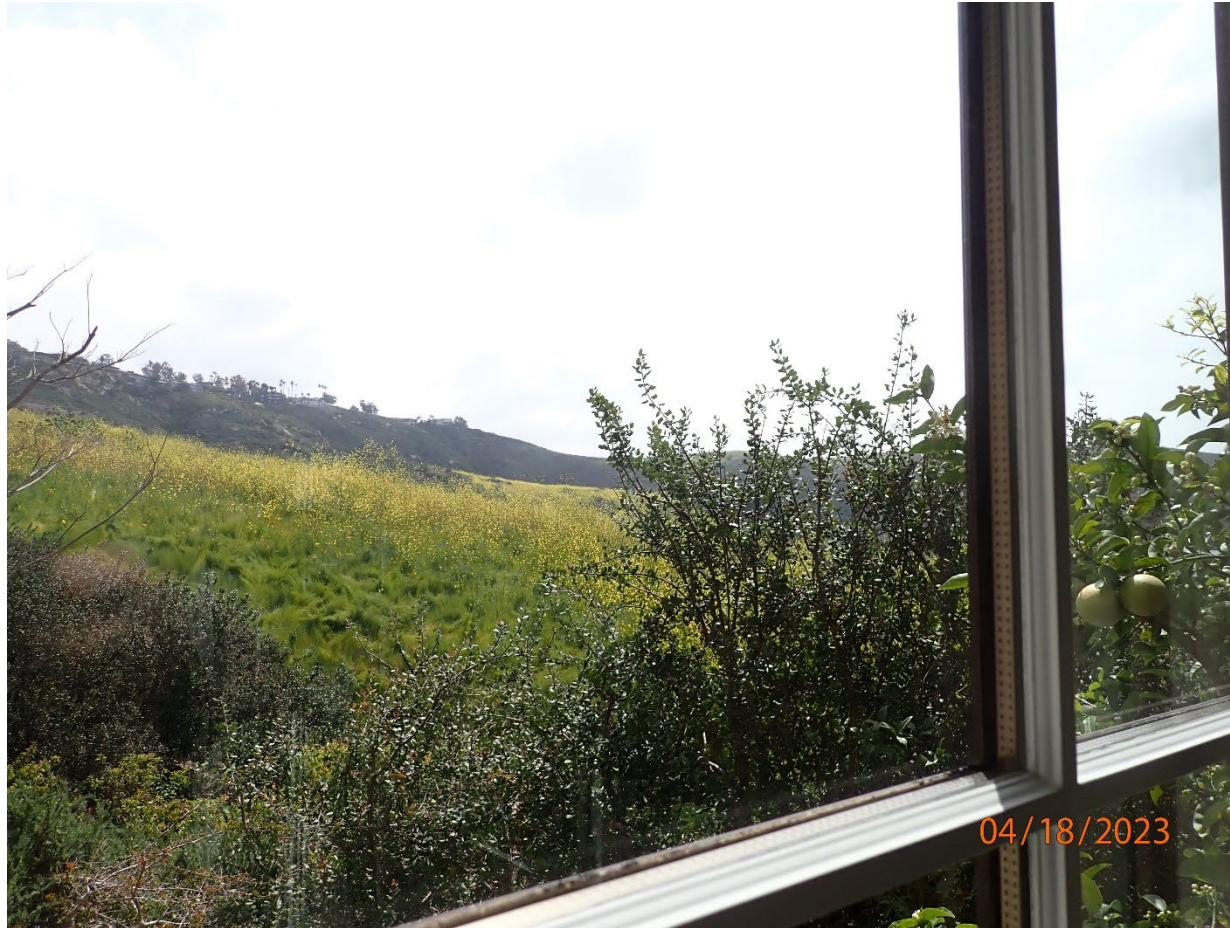
2001 Rim Rock Canyon Rd

The photograph above was taken from the main level of the primary residential structure.