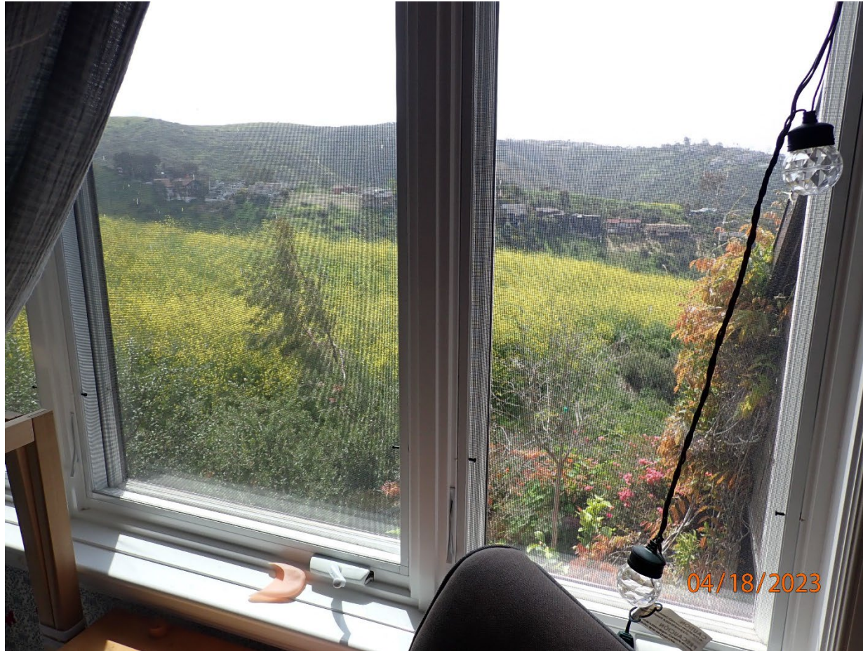
2001 Rim Rock Canyon Rd

The photograph above was taken from a secondary bedroom on the upstairs level of the primary residential structure.