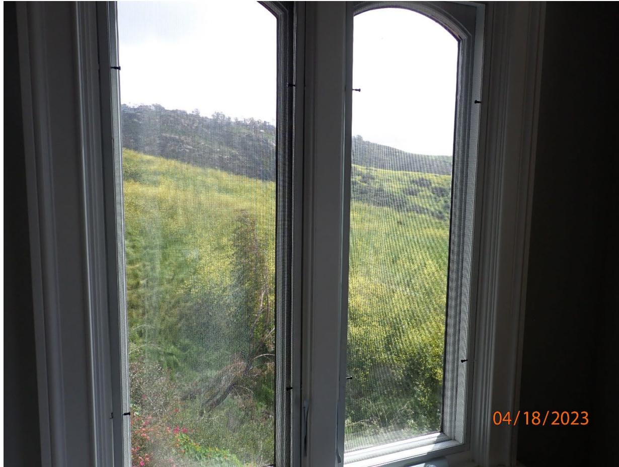
2001 Rim Rock Canyon Rd

The photograph above was taken from the upstairs level of the primary residential structure.