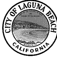
EXHIBIT A (December 20, 2023 Coastal Development Permit Exemption)