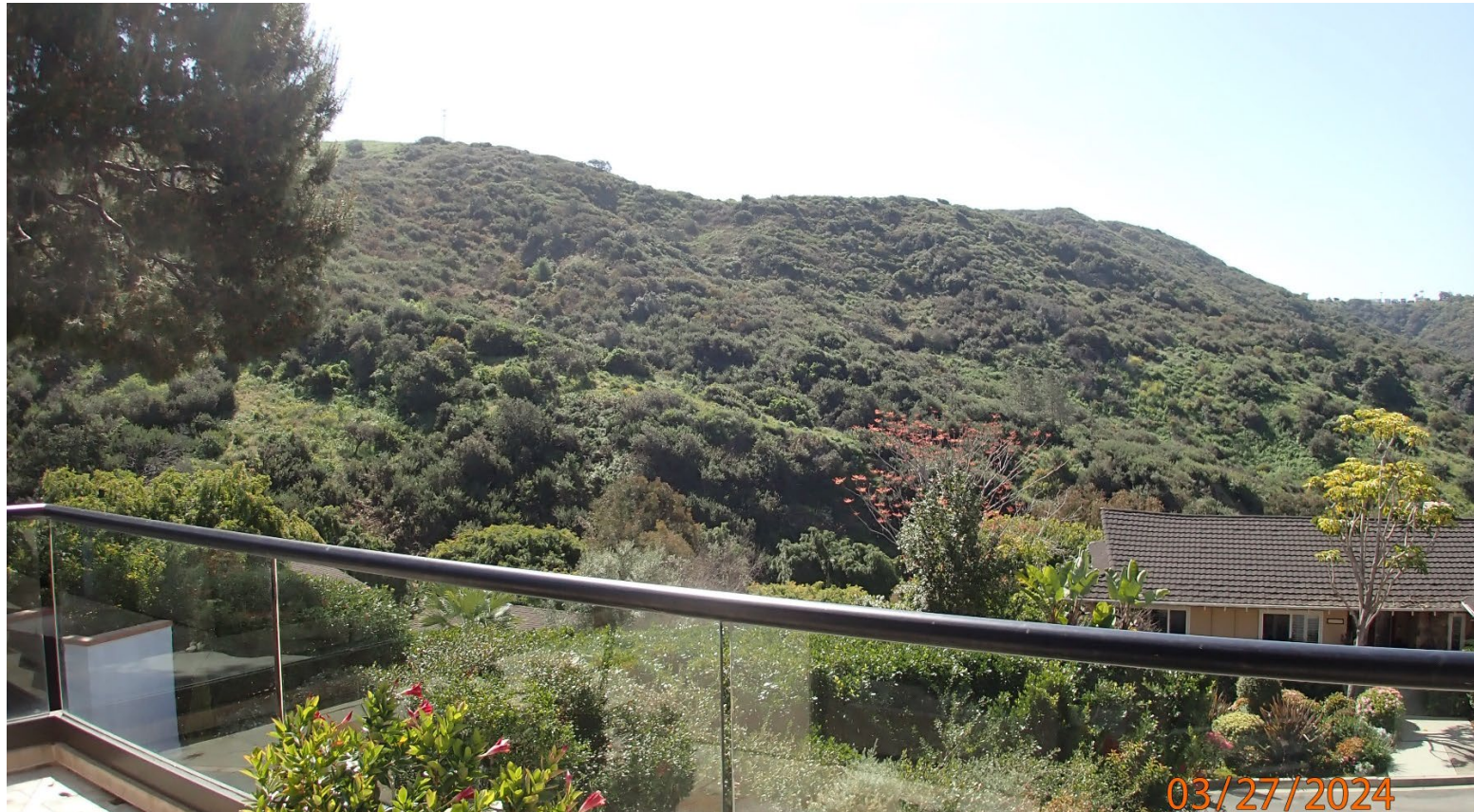
1323 Morningside Drive

The photograph above was taken from the master bedroom on the main level of primary residential structure. Visual scene description: ridgeline.