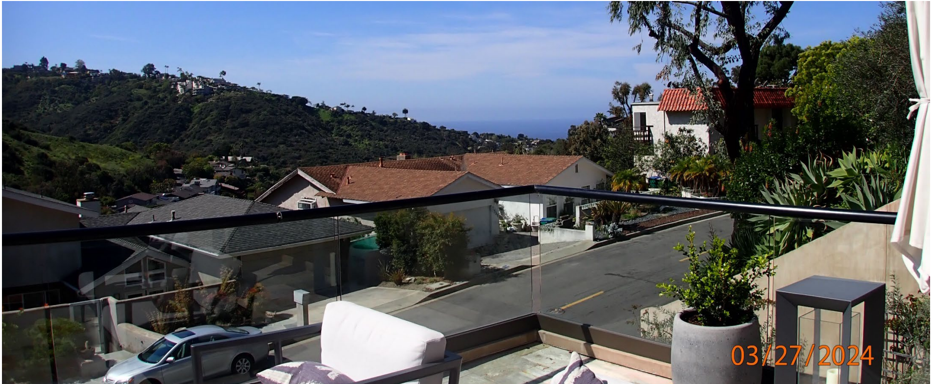
1323 Morningside Drive

The photograph above was taken from the family room on the main level of primary residential structure.