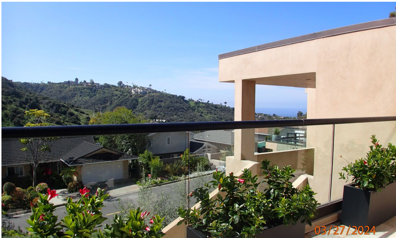
1323 Morningside Drive

The photograph above was taken from the master bedroom on the main level of primary residential structure.