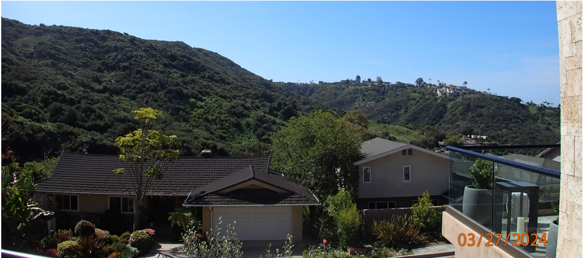
1323 Morningside Drive

The photograph above was taken from the dining room on the main level of primary residential structure.