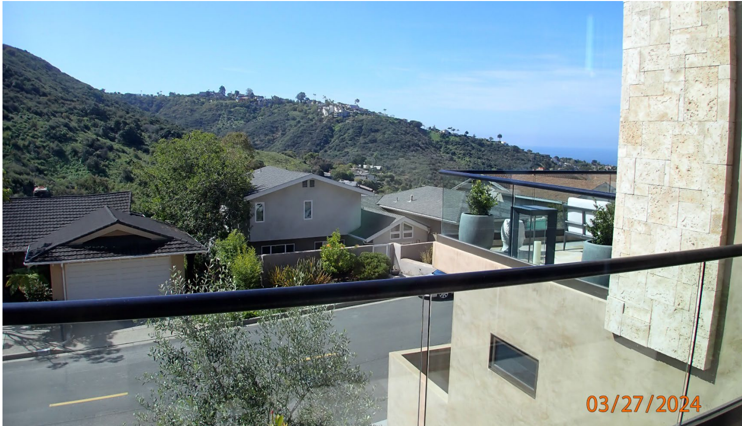
1323 Morningside Drive

The photograph above was taken from the dining room on the main level of primary residential structure.