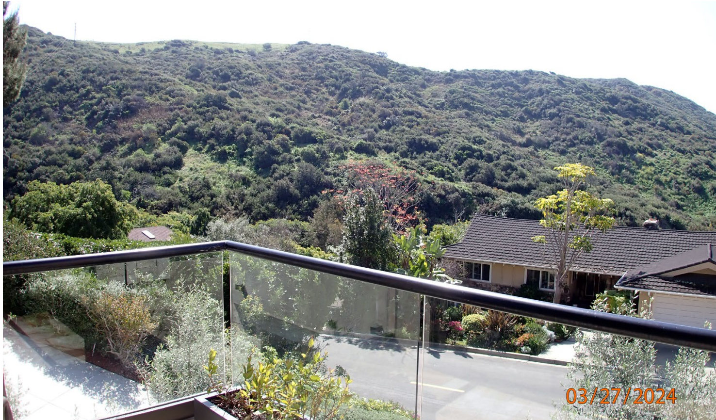
1323 Morningside Drive

The photograph above was taken from the dining room on the main level of primary residential structure.