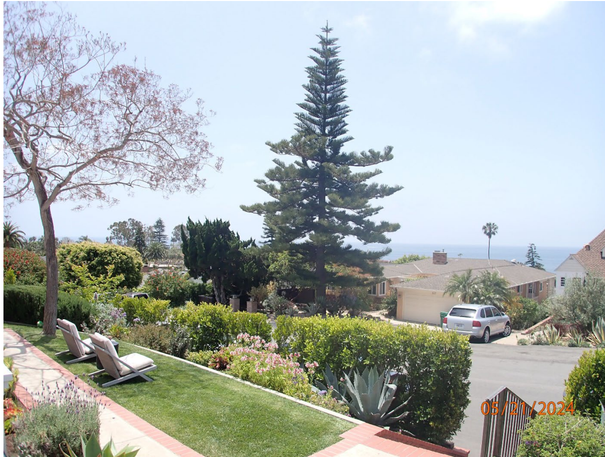
510 Blumont St

The photograph above was taken from the dining room on the main level of the primary residential structure.