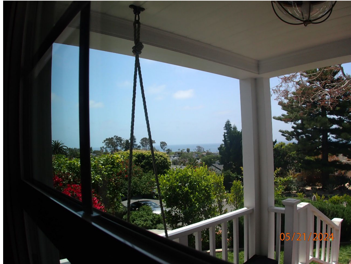
510 Blumont St

The photograph above was taken from bedroom 1 on the main level of the primary residential structure.