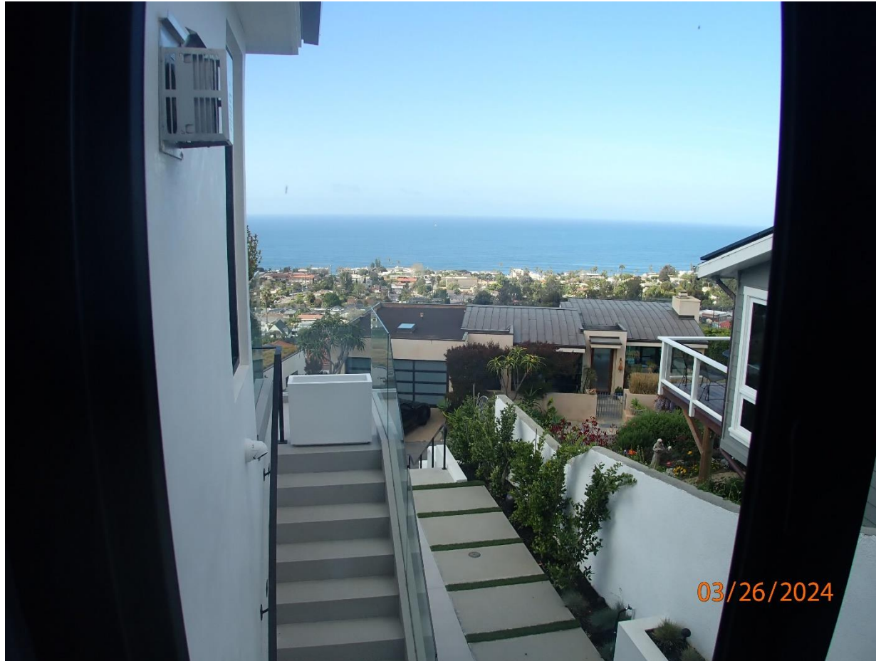
817 Buena Vista Way

The photograph above was taken from the office room on the main level of the primary residential structure. Visual scene description: Catalina Island and ocean horizon.