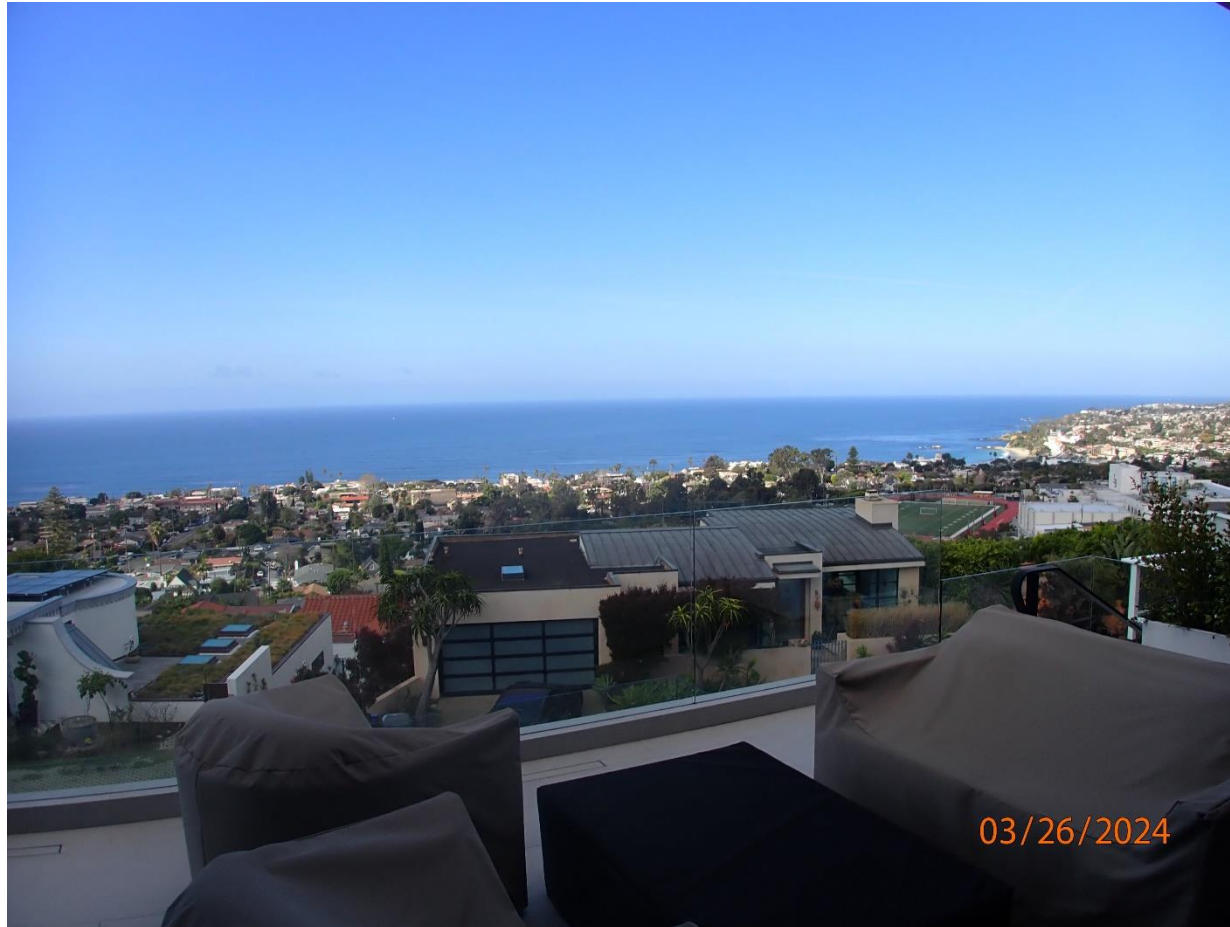
817 Buena Vista Way

The photograph above was taken from the living room on the main level of the primary residential structure. Visual scene description: Catalina Island, Hotel Laguna, Main Beach and Ocean Horizon.