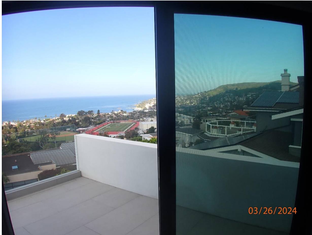
817 Buena Vista Way

The photograph above was taken from the master bedroom on the upper level of the primary residential structure.