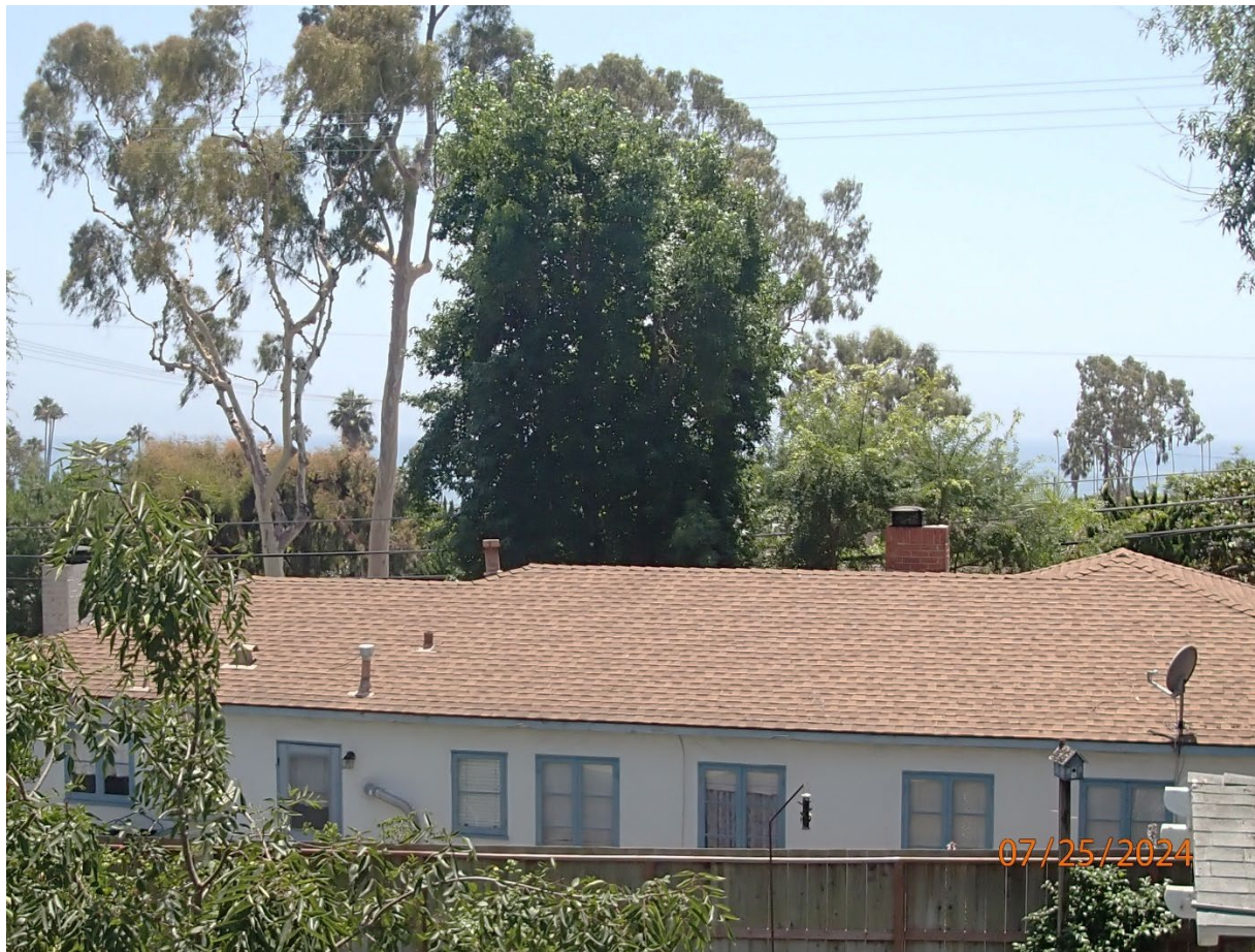
416 Aster Street

The photograph above was taken from the secondary room on the upper level of the primary residential structure.