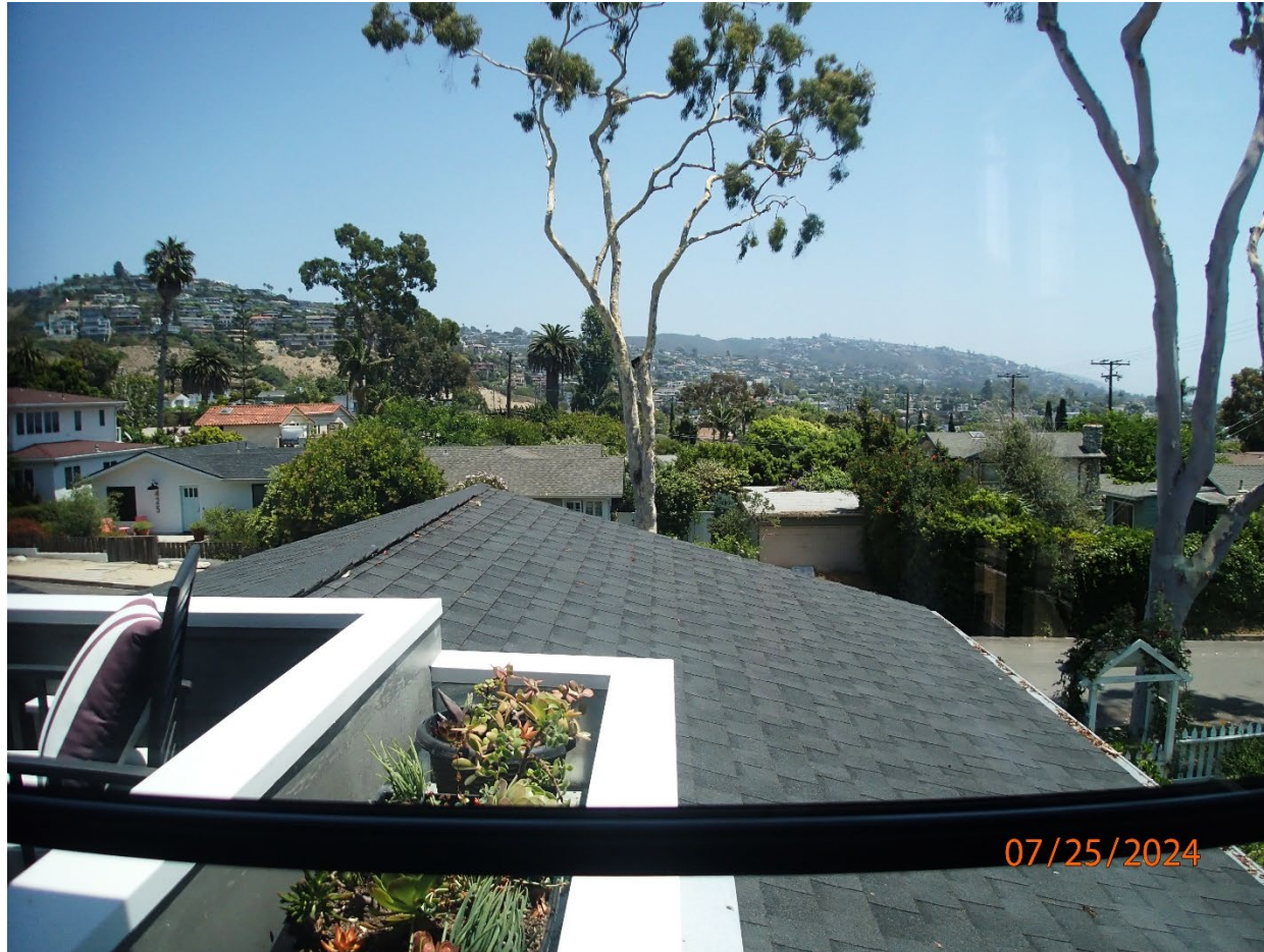
416 Aster Street

The photograph above was taken from the sitting room on the upper level of the primary residential structure.