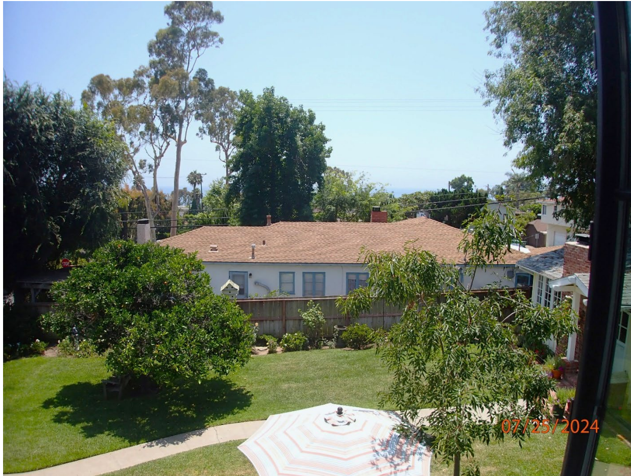
416 Aster Street

The photograph above was taken from the sitting room on the upper level of the primary residential structure.