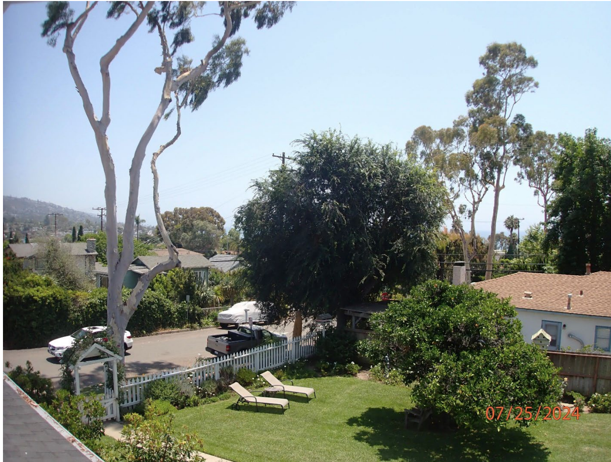
416 Aster Street

The photograph above was taken from the sitting room on the upper level of the primary residential structure.