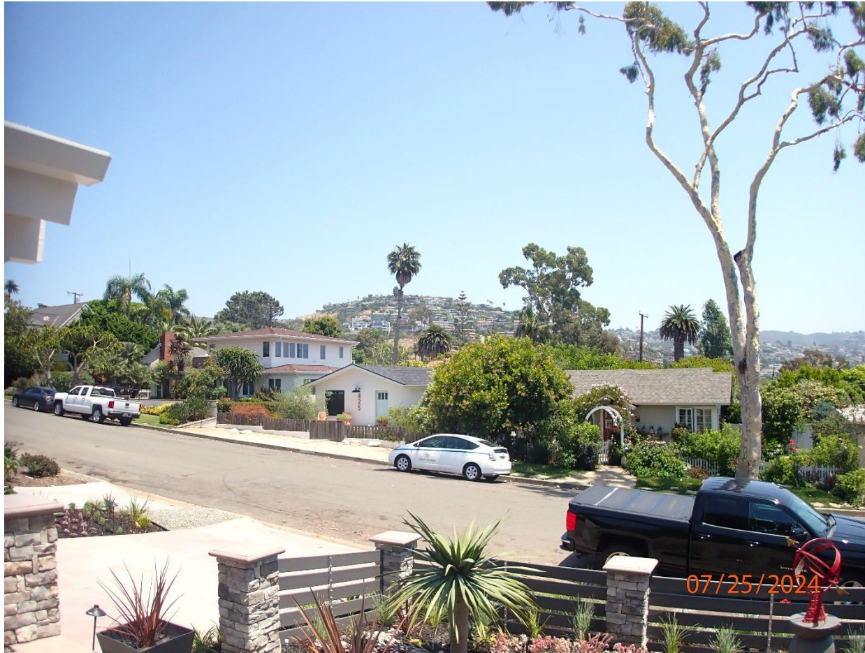
416 Aster Street

The photograph above was taken from the living room on the main level of the primary residential structure.