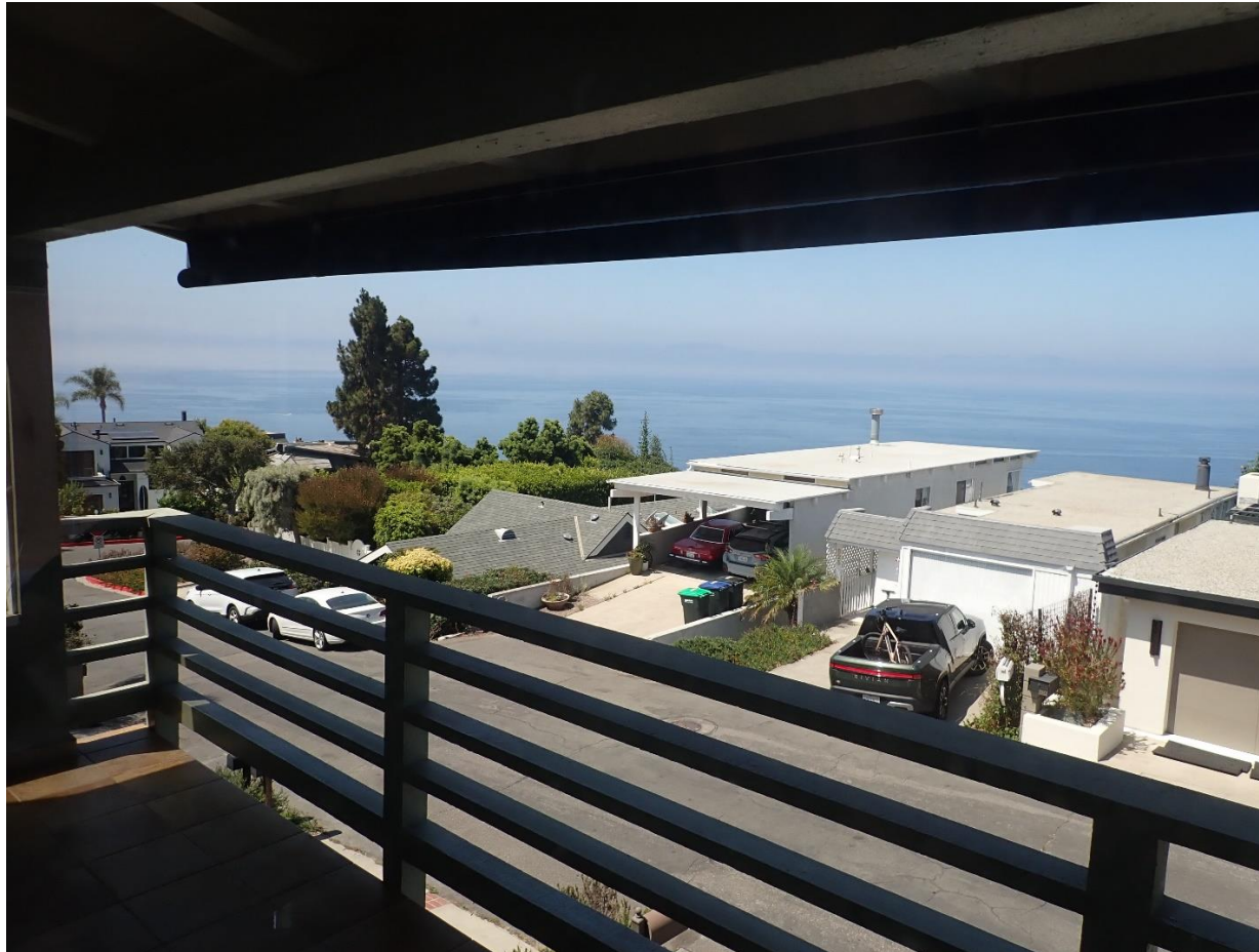
830 La Mirada Street

The photograph above was taken from the living room on the second level of the primary residential structure.