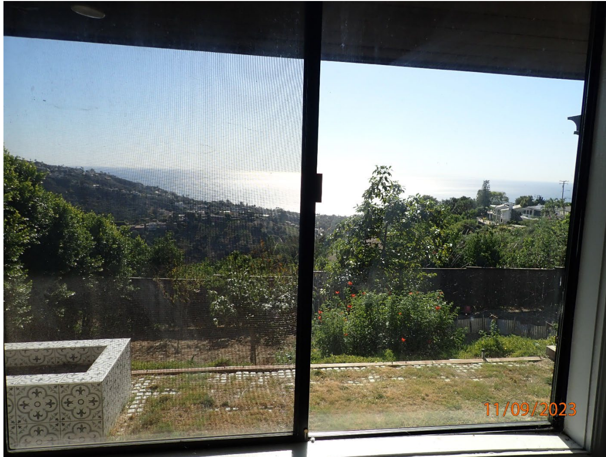
2155 Temple Hills Drive

The photograph above was taken from the 2 nd guest bedroom on the lower level of the primary residential structure.