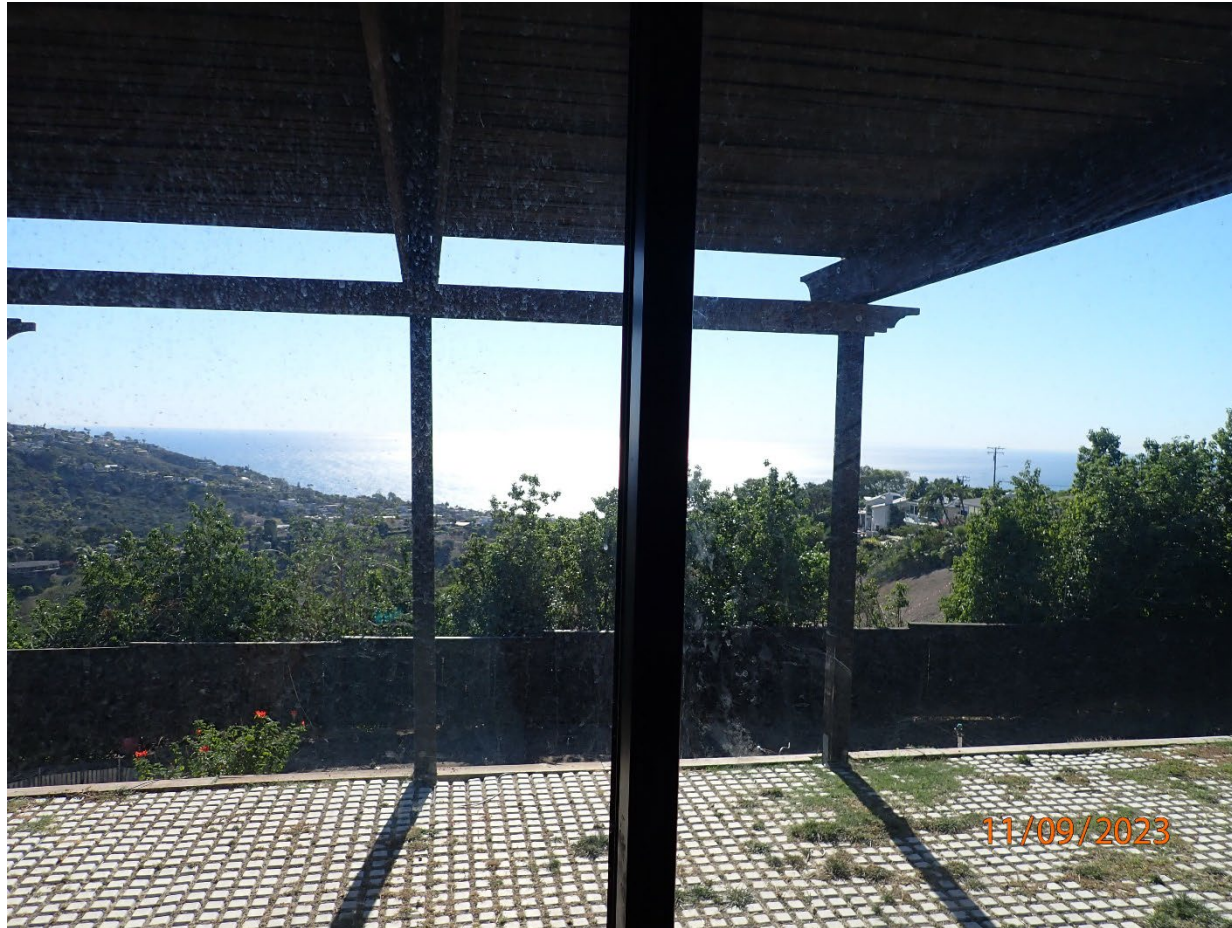
2155 Temple Hills Drive

The photograph above was taken from the primary bedroom on the lower level of the primary residential structure.