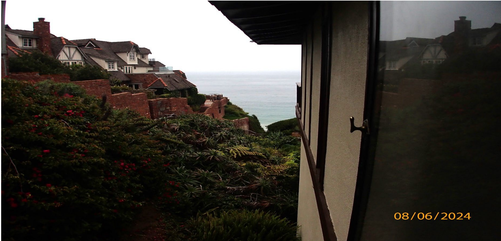
17 Bay Drive

The photograph above was taken from the office of the primary residential structure.