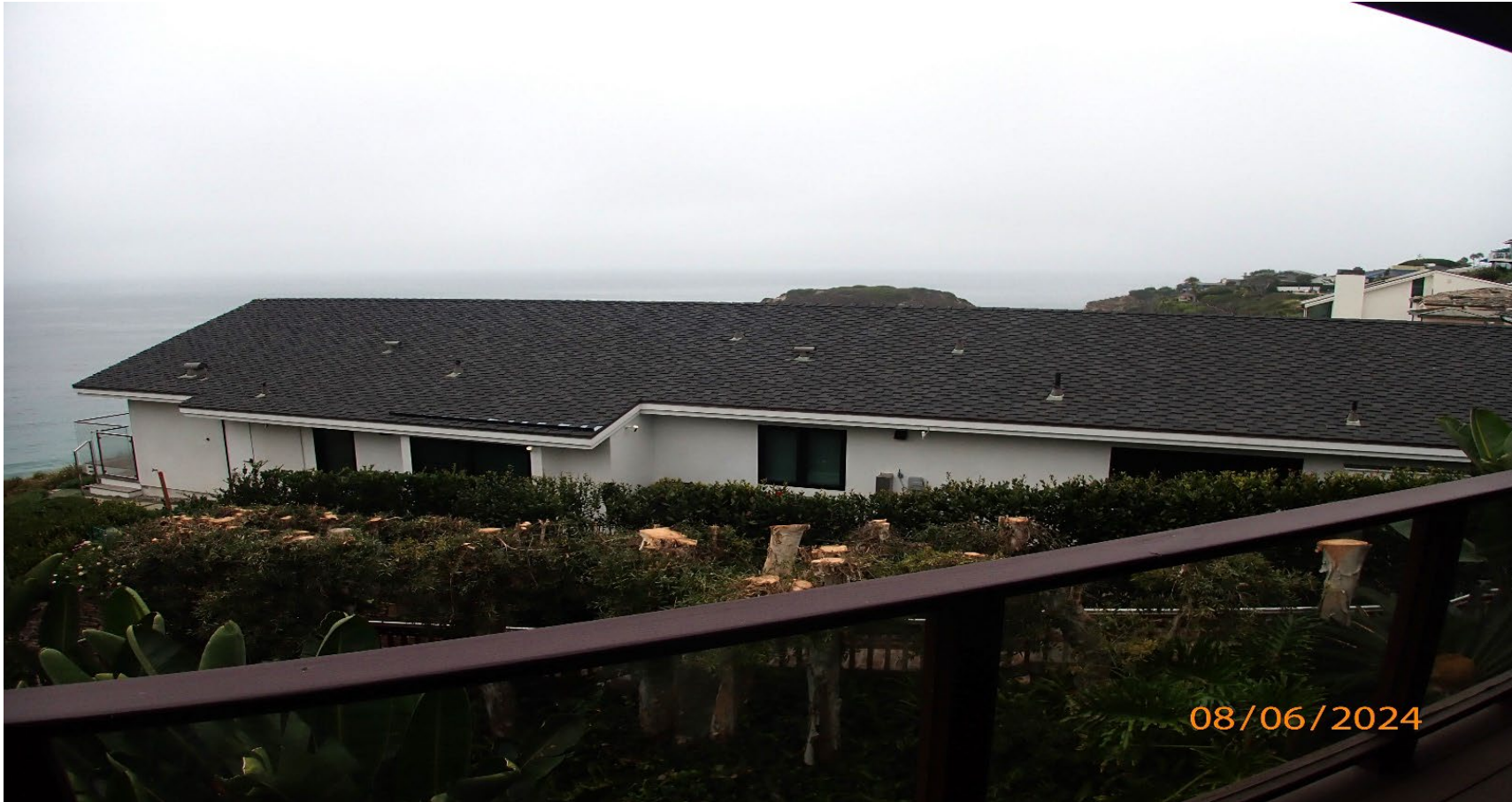
17 Bay Drive

The photograph above was taken from the family room of the primary residential structure.