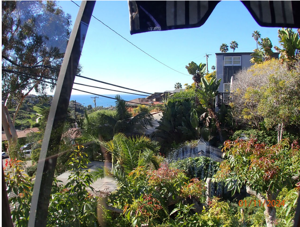
1045 Wykoff Way

The photograph above was taken from the living room on the main level of the primary residential structure.