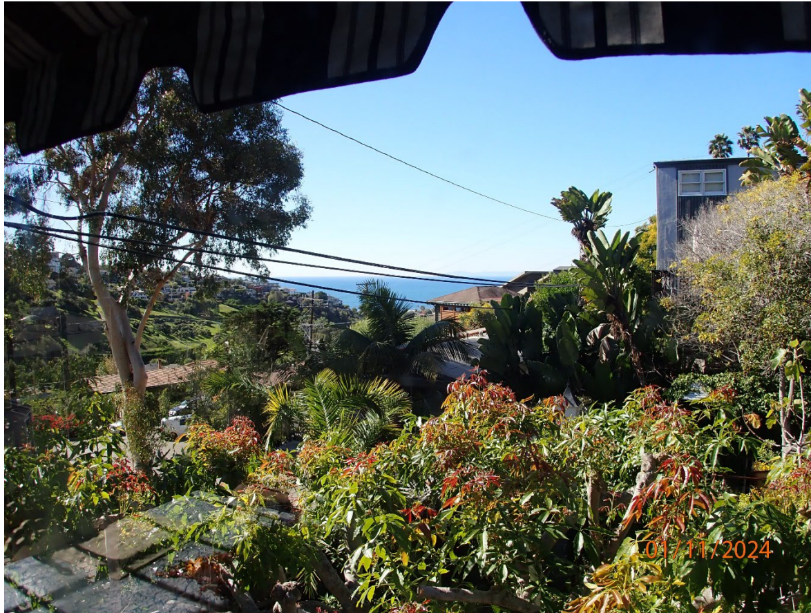
1045 Wykoff Way

The photograph above was taken from the living room on the main level of the primary residential structure.