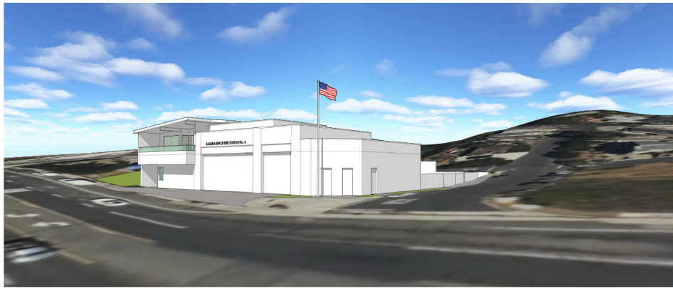
PROPOSED PERSPECTIVE VIEW 3