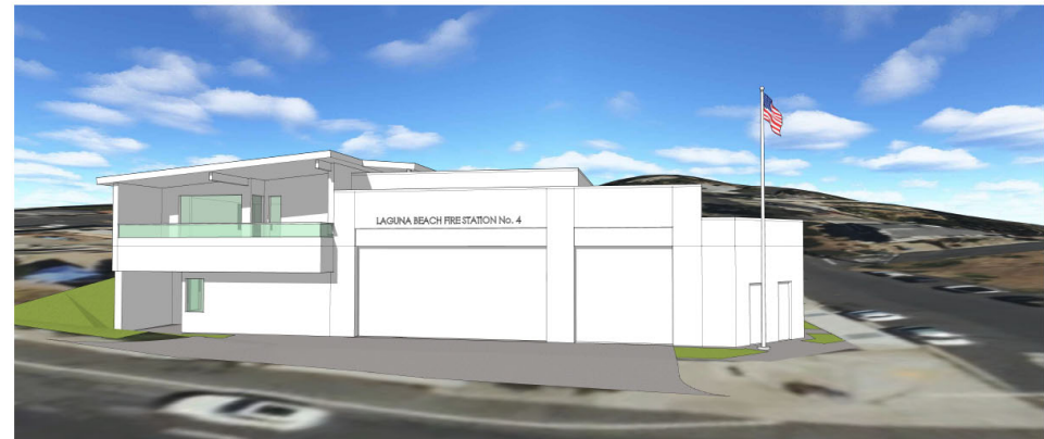
PROPOSED PERSPECTIVE VIEW 2