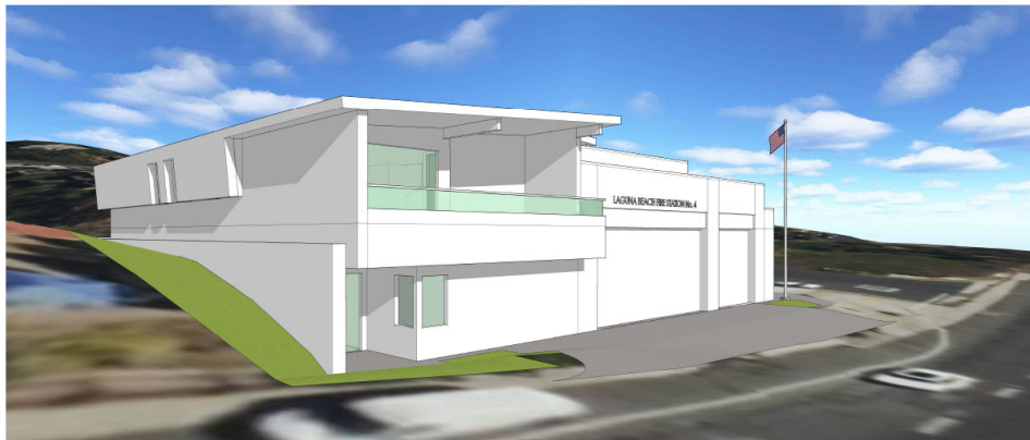
PROPOSED PERSPECTIVE VIEW 1