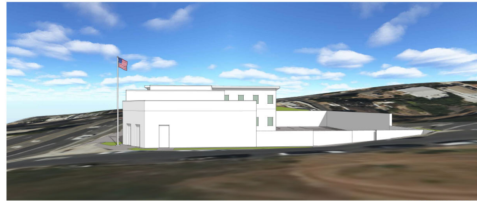
PROPOSED PERSPECTIVE VIEW 4