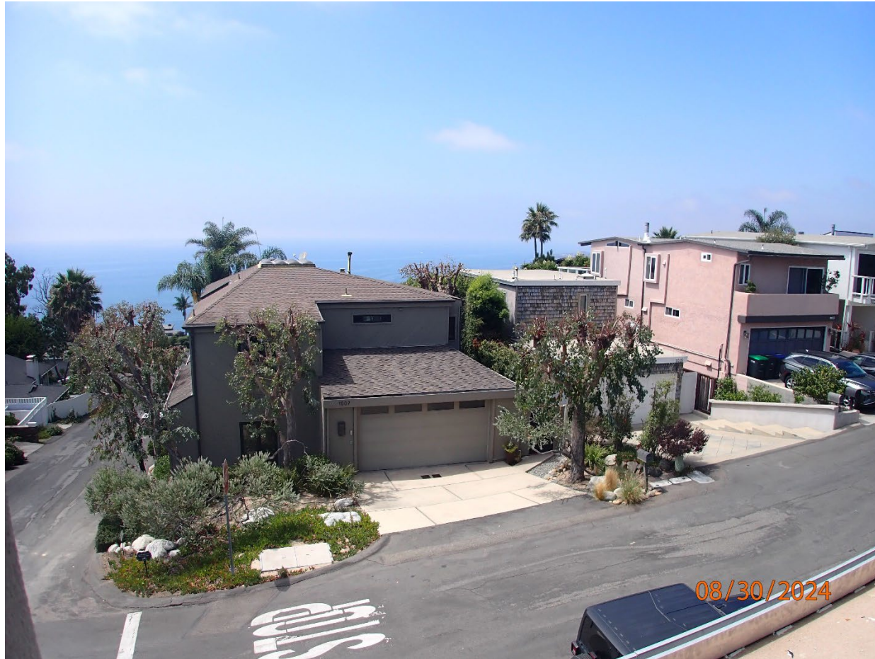
1004 Katella Street

The photograph above was taken from the living room on the upper level of the primary residential structure.