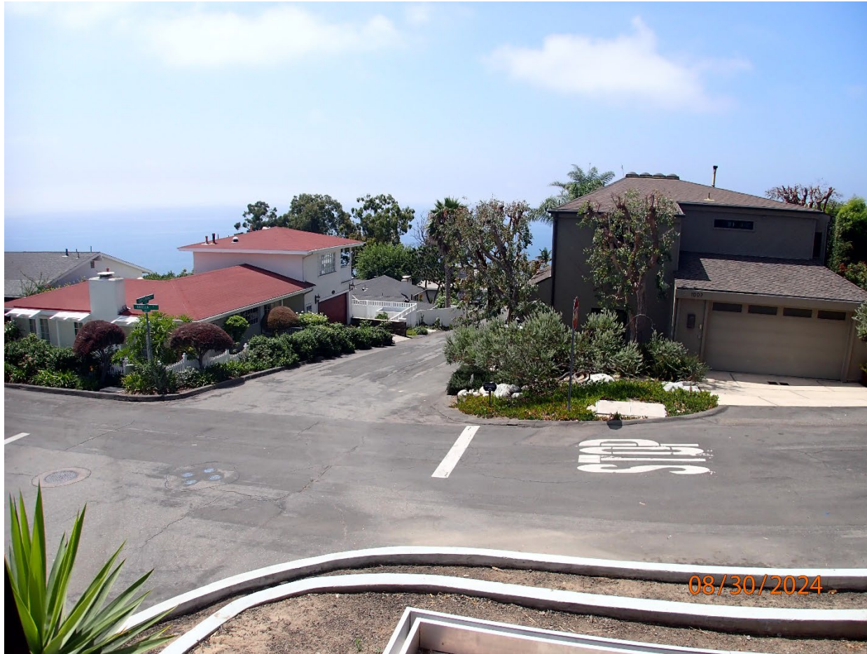
1004 Katella Street

The photograph above was taken from the living room on the main level of the primary residential structure.