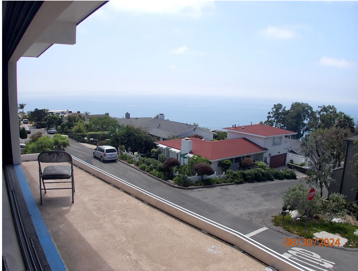
1004 Katella Street

The photograph above was taken from the living room on the upper level of the primary residential structure.