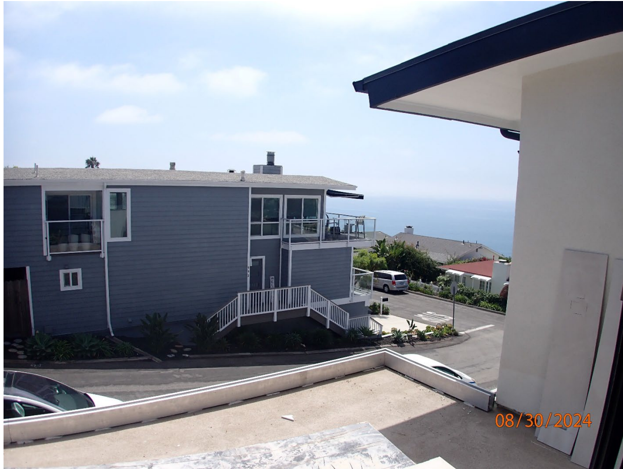
1004 Katella Street

The photograph above was taken from the bedroom on the upper level of the primary residential structure.