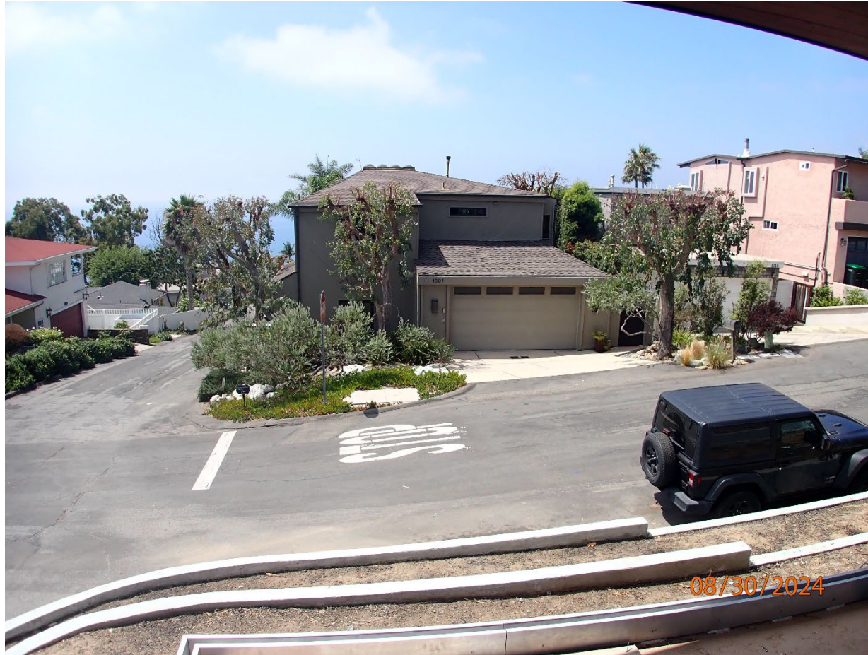
1004 Katella Street

The photograph above was taken from the living room on the main level of the primary residential structure.