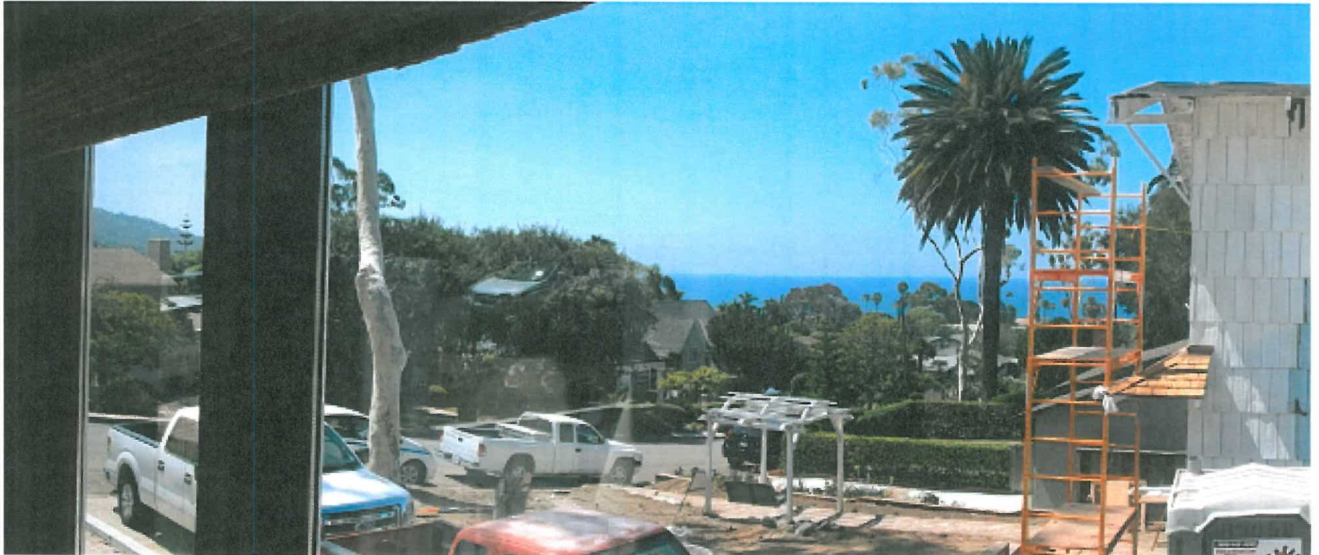
474 Aster St.

The photograph above was taken from the Living room of the primary residential structure. Visual scene description: Ocean horizon, city lights and hillside terrain.