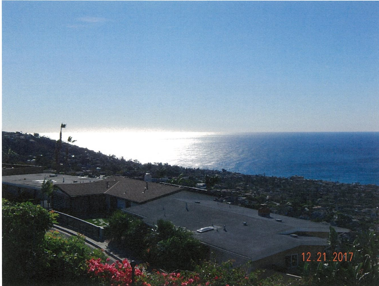
1475 Bounty Way

The photograph above was taken from the Master Bedroom on the main level of the primary residential structure.