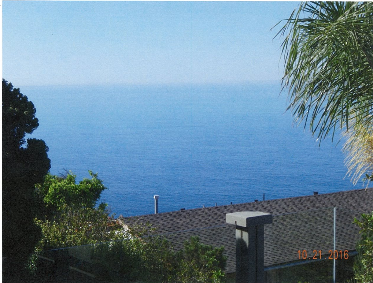
1088 Cortez Ave.

The photograph above was taken from the den/loft on the main level of the primary residential structure.