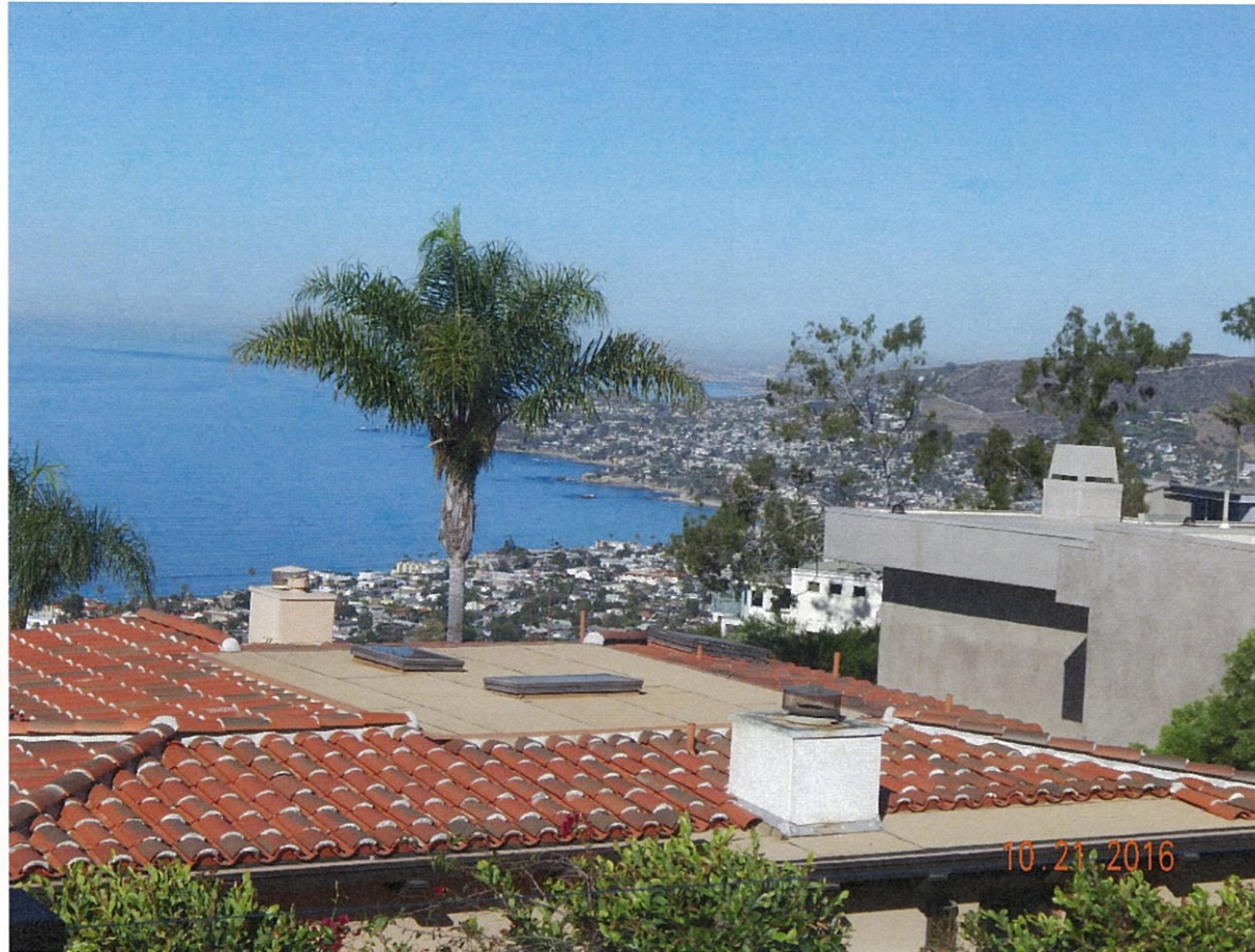
1088 Cortez Ave.

The photograph above was taken from the den/loft on the main level of the primary residential structure.