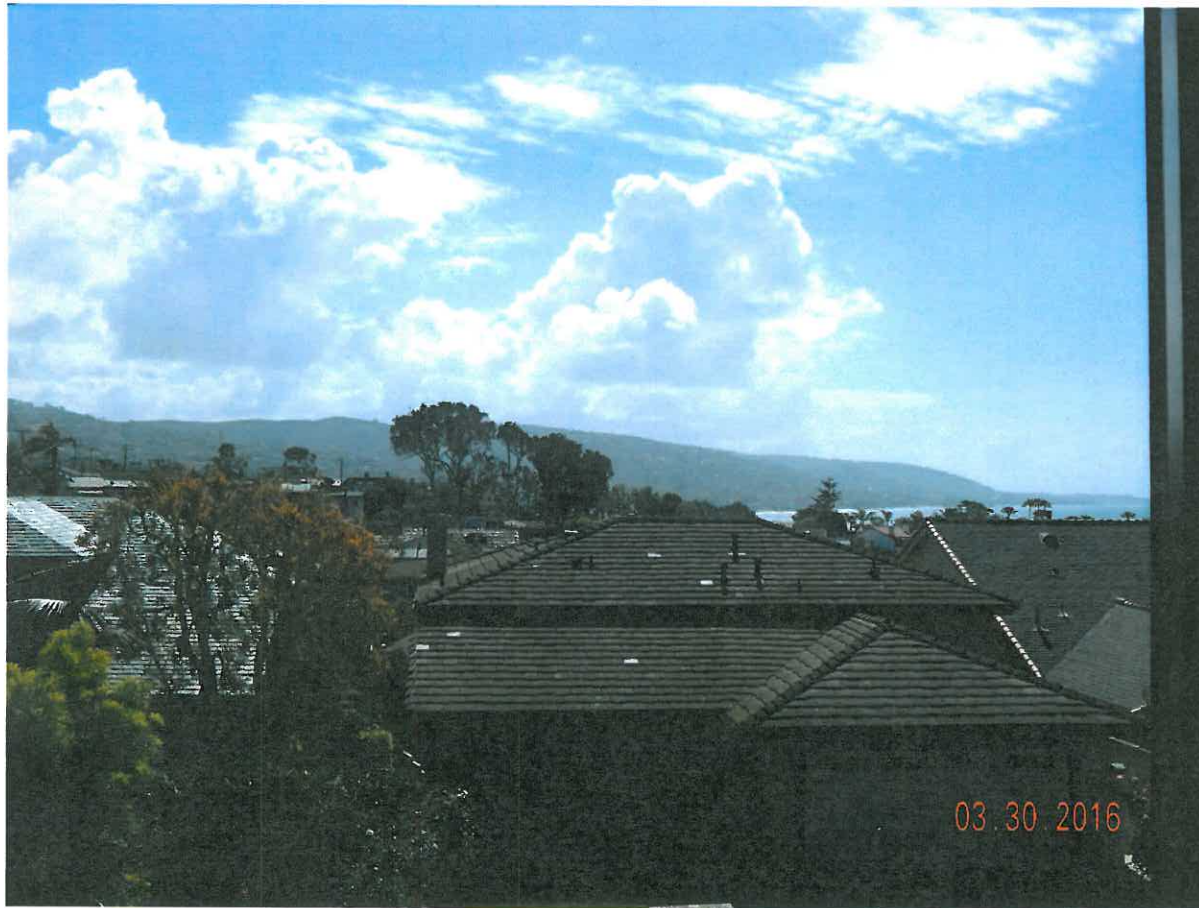
140 Crescent Bay Dr.

The photograph above was taken from the Great room on the main floor of the primary residential structure.