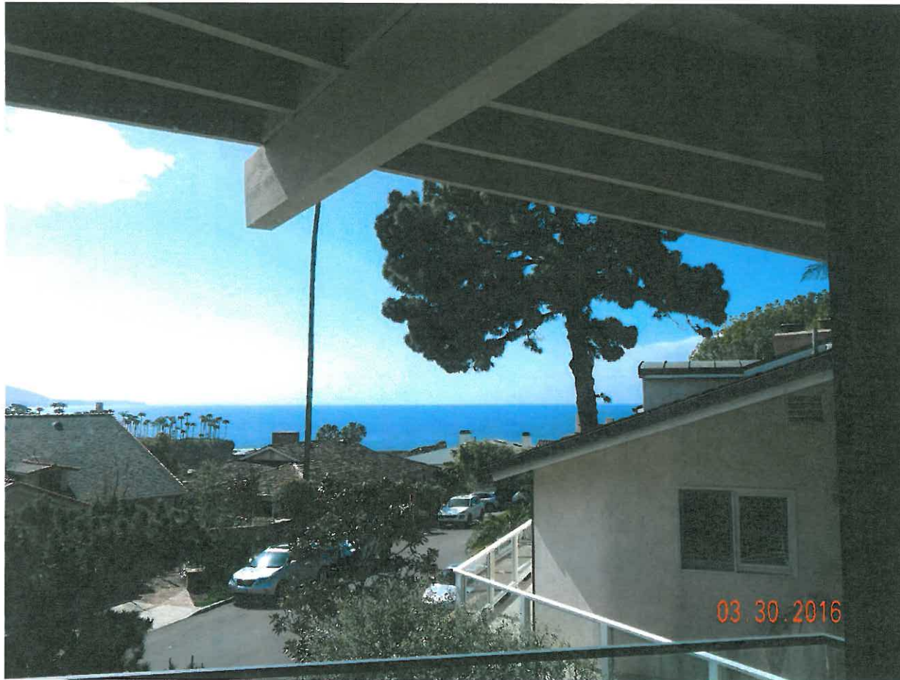
140 Crescent Bay Dr.

The photograph above was taken from the Master bedroom on the main floor of the primary residential structure.