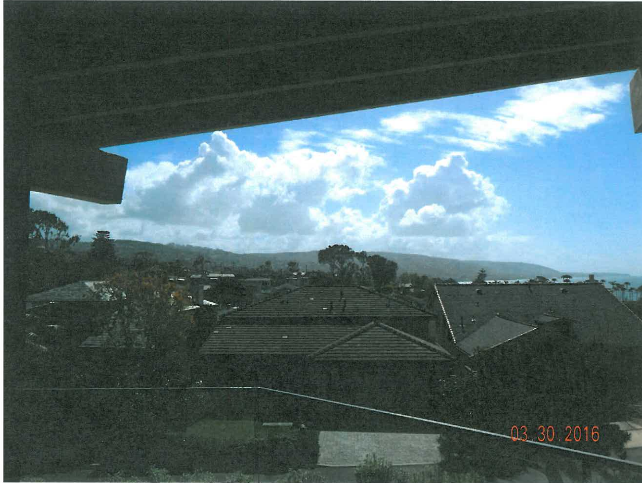
140 Crescent Bay Dr.

The photograph above was taken from the Master bedroom on the main floor of the primary residential structure.