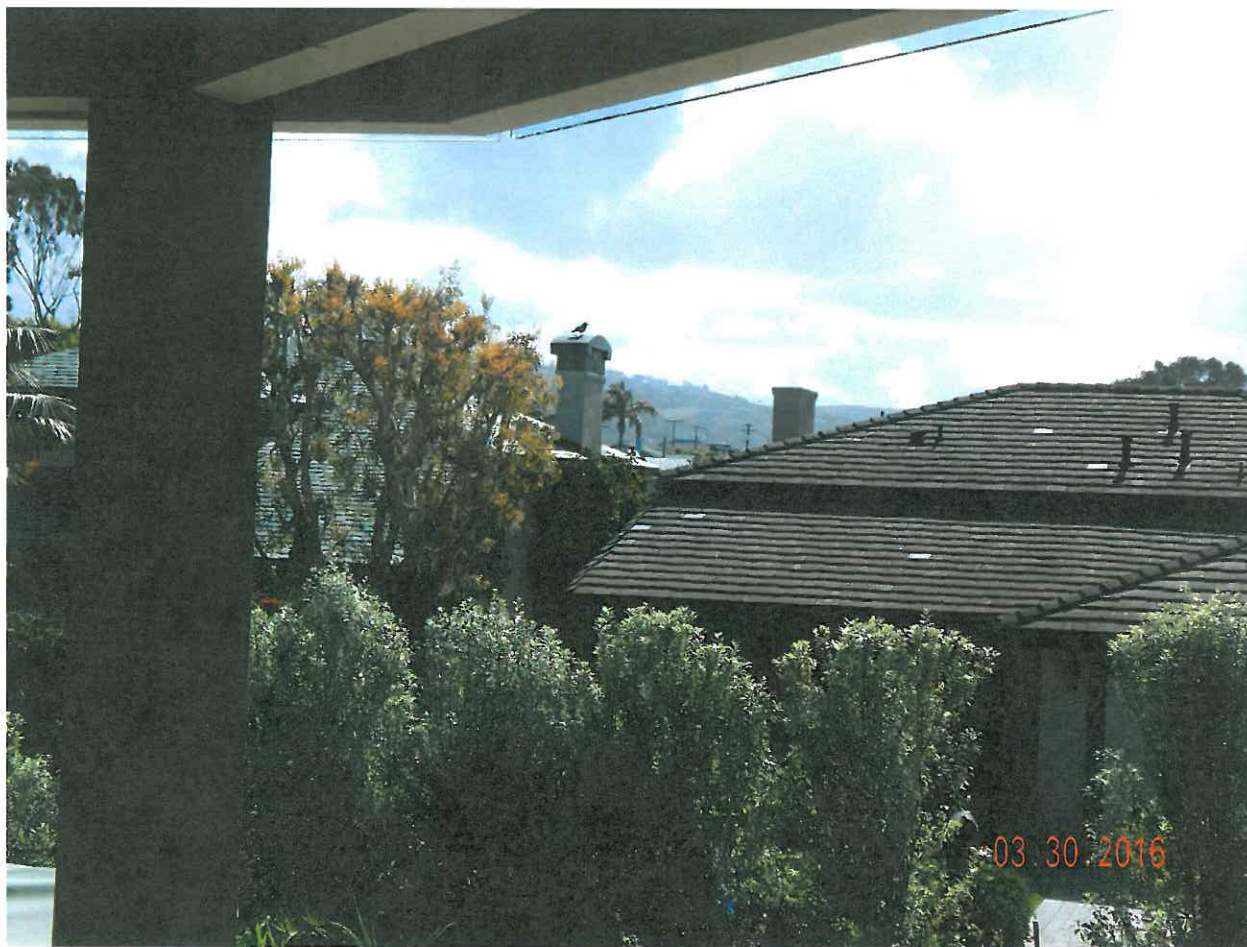
140 Crescent Bay Dr.

The photograph above was taken from the Guest bedroom on the lower level of the primary residential structure. Visual scene description: City lights and hillside terrain.