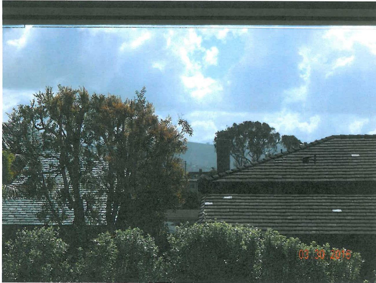
140 Crescent Bay Dr.

The photograph above was taken from the Family room on the lower level of the primary residential structure.