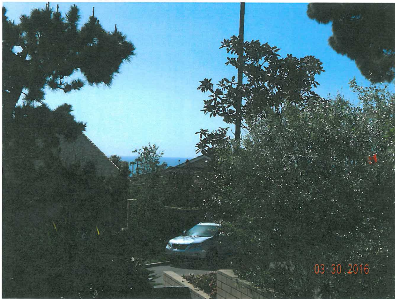
140 Crescent Bay Dr.

The photograph above was taken from the Guest bedroom on the lower level of the primary residential structure. Visual scene description: Ocean horizon.