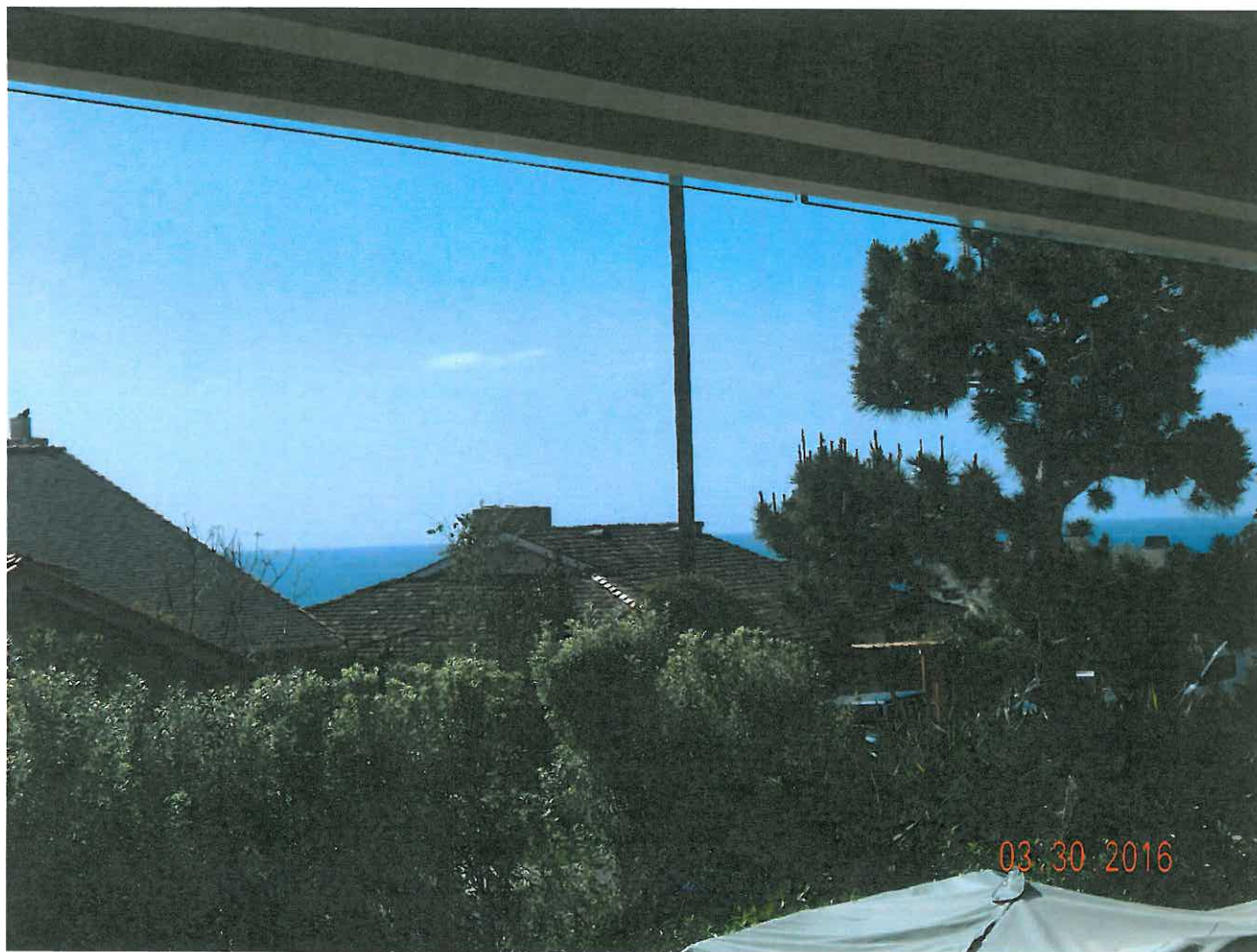
140 Crescent Bay Dr.

The photograph above was taken from the Family room on the lower level of the primary residential structure. Visual scene description: Ocean horizon.