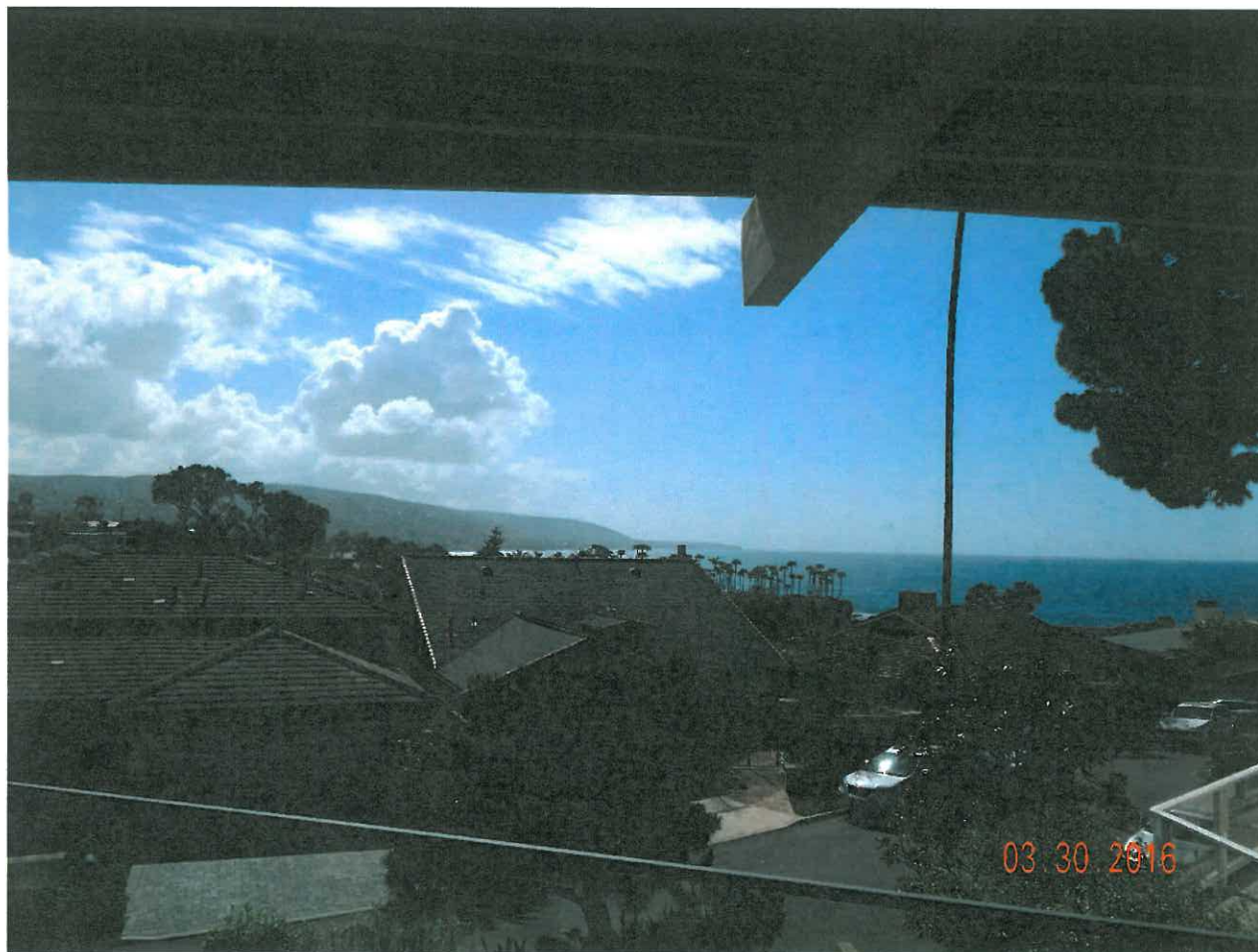
140 Crescent Bay Dr.

The photograph above was taken from the Master bedroom on the main floor of the primary residential structure.