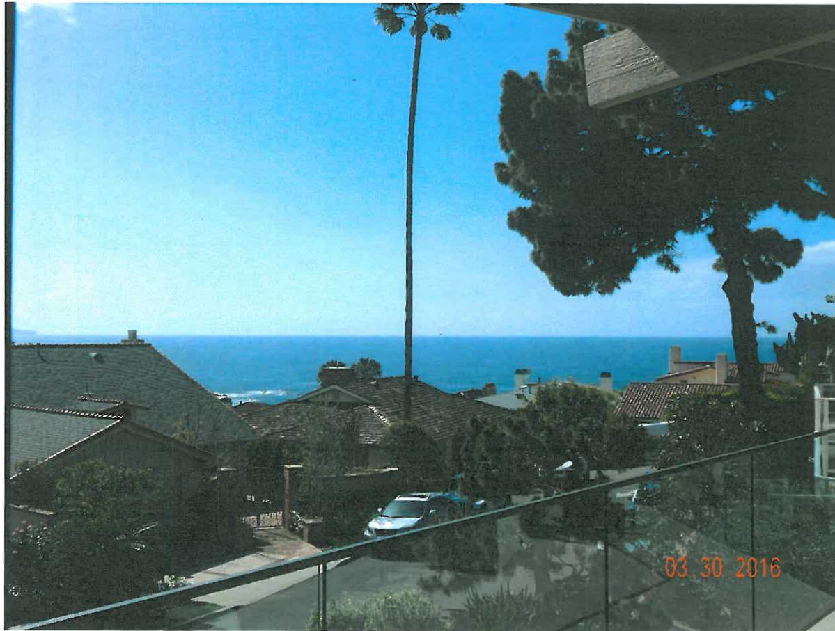
140 Crescent Bay Dr.

The photograph above was taken from the Great room on the main floor of the primary residential structure.