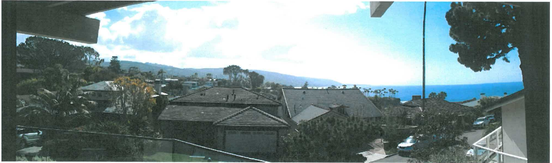
140 Crescent Bay Dr.

The photograph above was taken from the Master bedroom on the main floor of the primary residential structure.