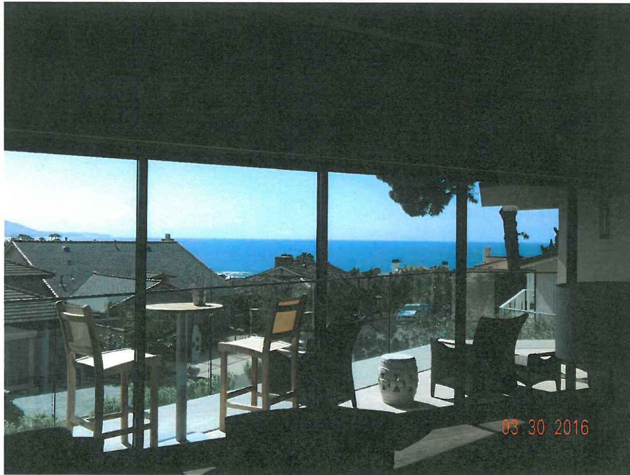
140 Crescent Bay Dr.

The photograph above was taken from the Great room on the main floor of the primary residential structure.