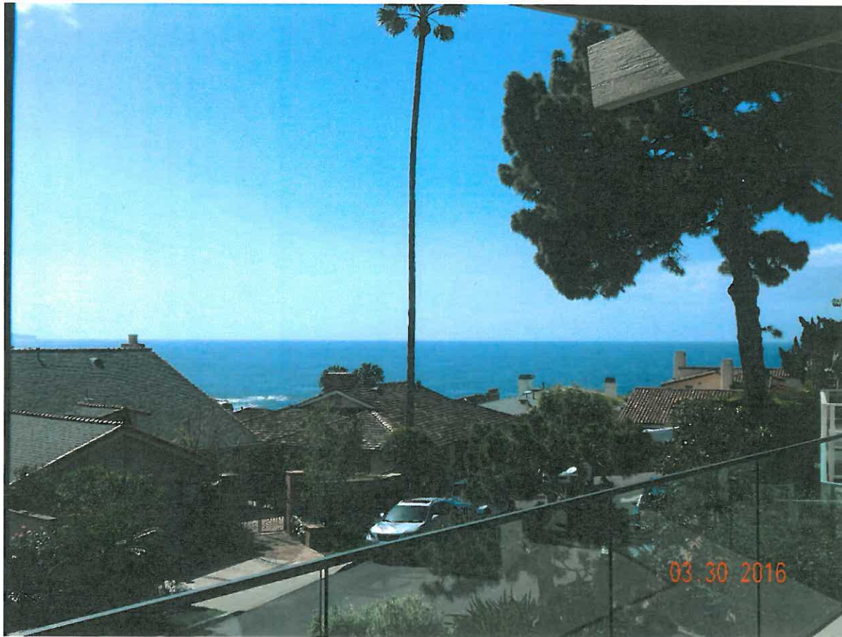
140 Crescent Bay Dr.

The photograph above was taken from the property owners' Great room on the main floor of the primary residential structure.