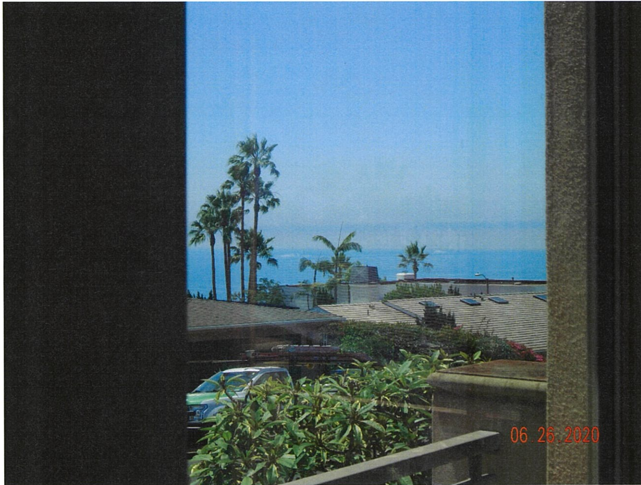
1510 Caribbean Way

The photograph above was taken from the living room on the main level of the primary residential structure.