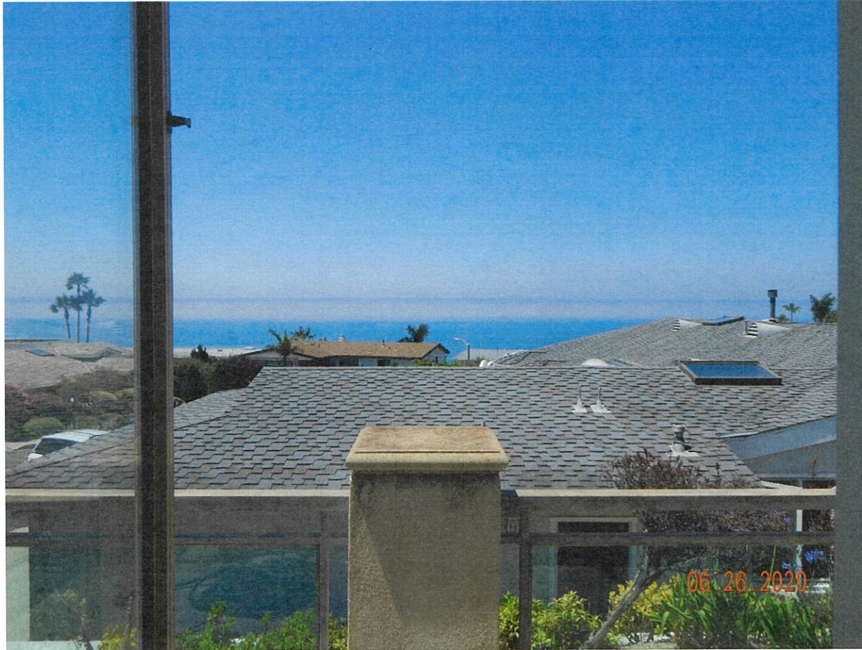
1510 Caribbean Way

The photograph above was taken from the living room on the main level of the primary residential structure.