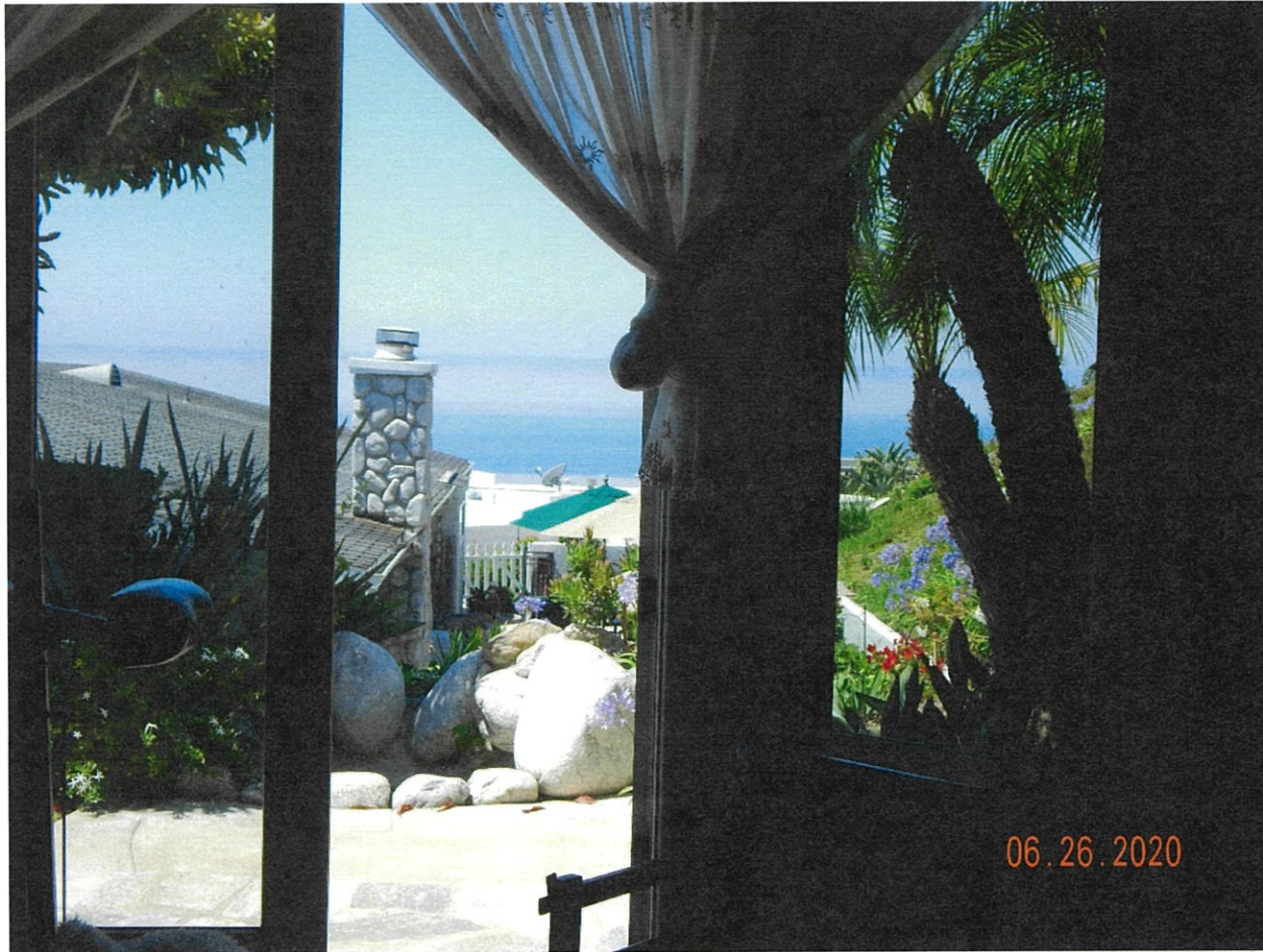
1510 Caribbean Way

The photograph above was taken from the master bedroom on the main level of the primary residential structure. Vegetation on any approved landscape plan with height limits established is exempt from record of view.