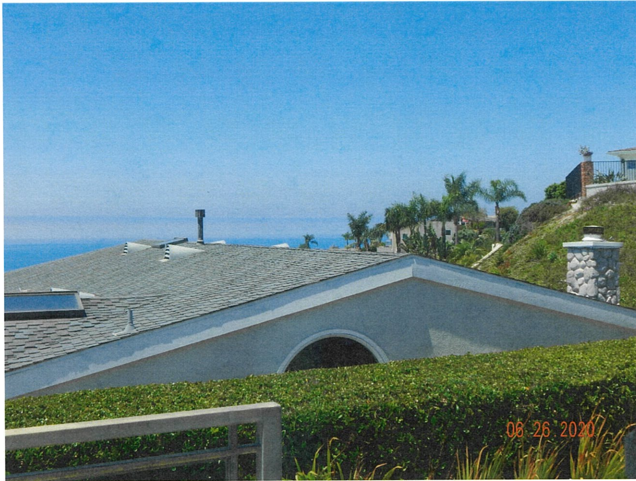
1510 Caribbean Way

The photograph above was taken from the living room on the main level of the primary residential structure.