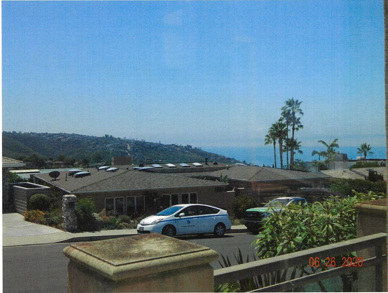
1510 Caribbean Way

The photograph above was taken from the living room on the main level of the primary residential structure.