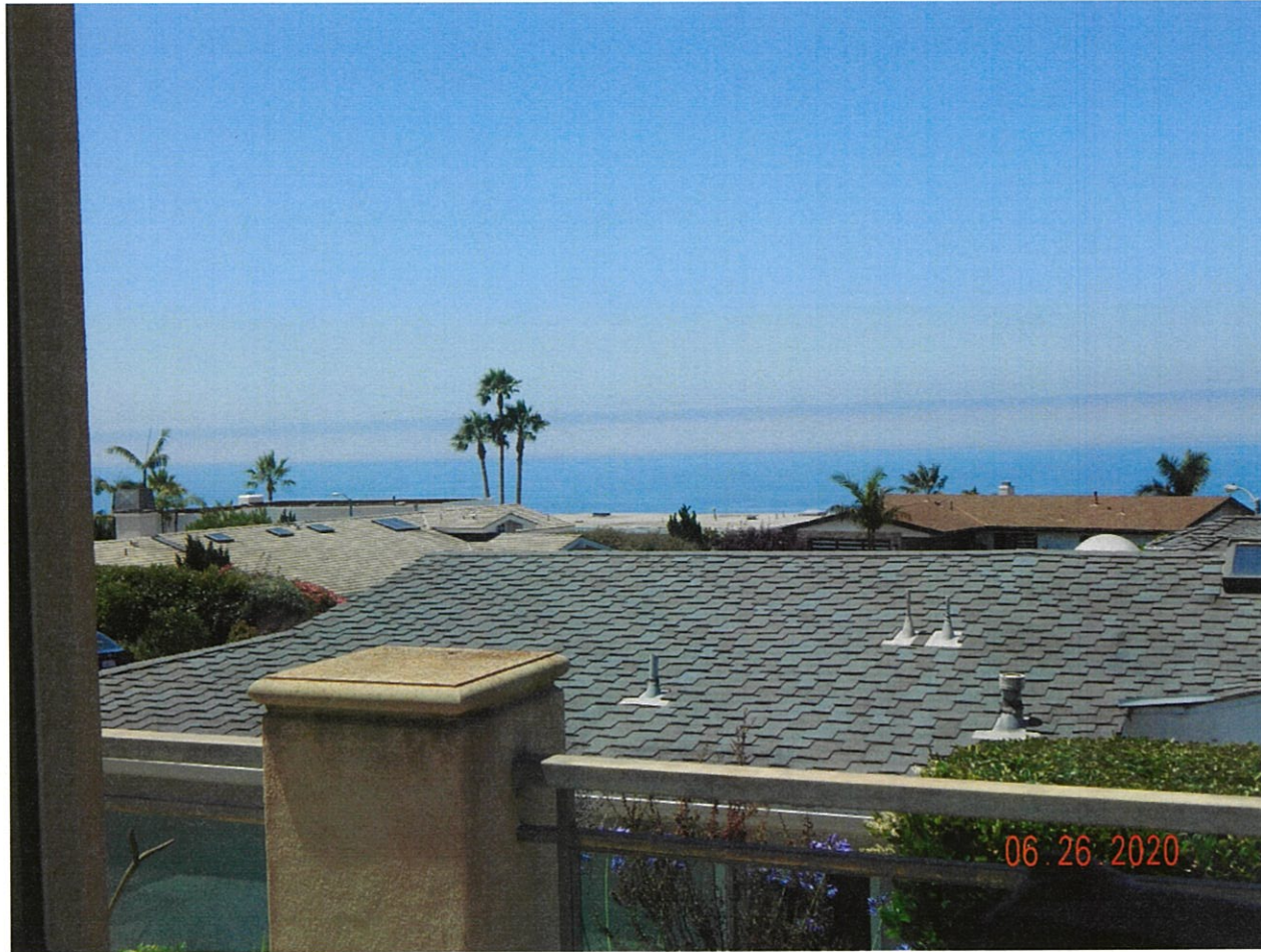
1510 Caribbean Way

The photograph above was taken from the living room on the main level of the primary residential structure.