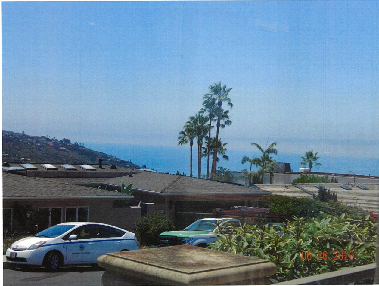
1510 Caribbean Way

The photograph above was taken from the living room on the main level of the primary residential structure. Vegetation on any approved landscape plan with height limits established is exempt from record of view.