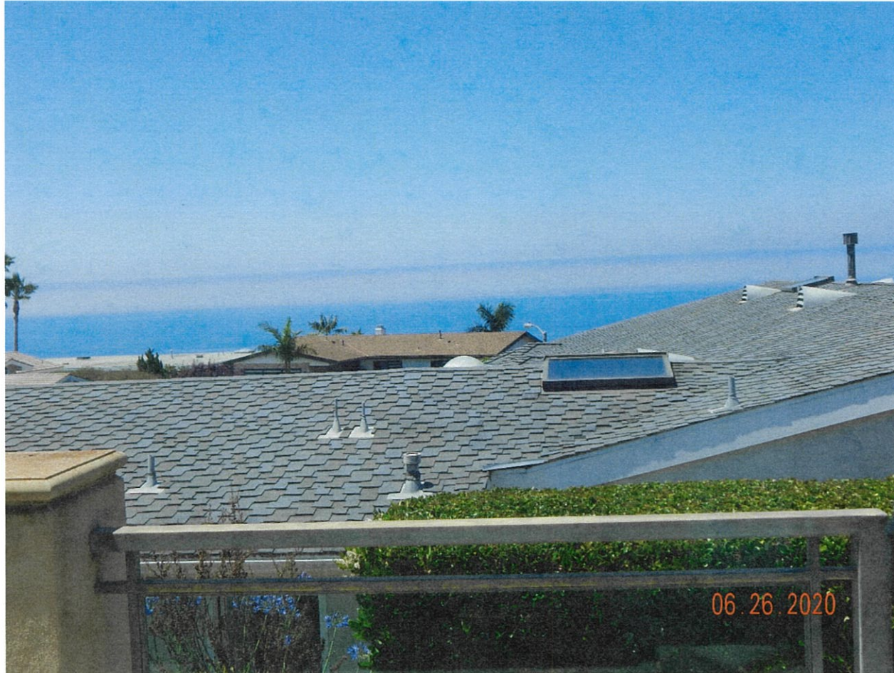
1510 Caribbean Way

The photograph above was taken from the living room on the main level of the primary residential structure.