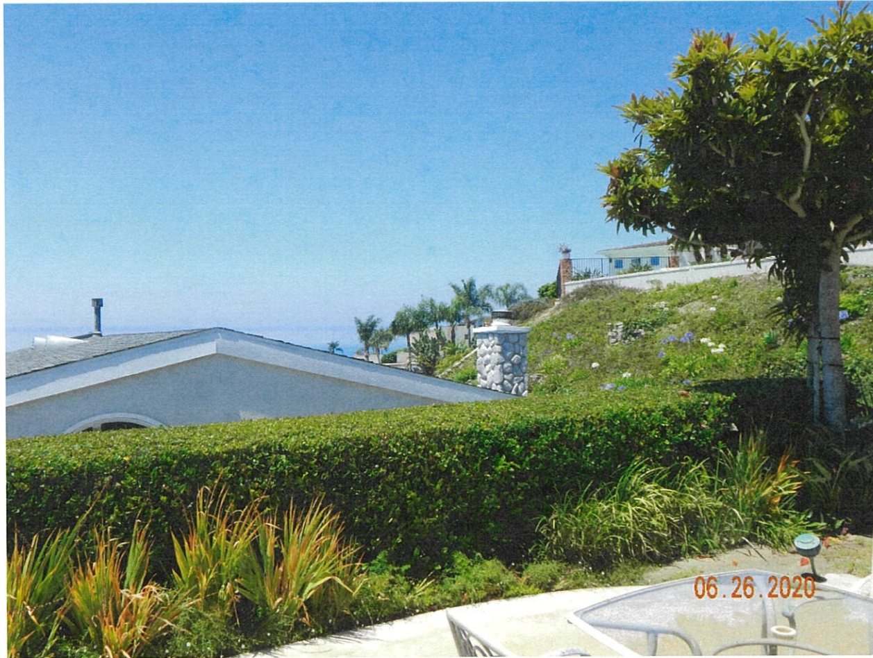
1510 Caribbean Way

The photograph above was taken from the dining room/kitchen on the main level of the primary residential structure. Visual scene description: ocean horizon.