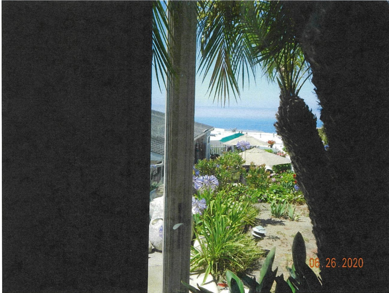
1510 Caribbean Way

The photograph above was taken from the master bedroom on the main level of the primary residential structure. Vegetation on any approved landscape plan with height limits established is exempt from record of view.