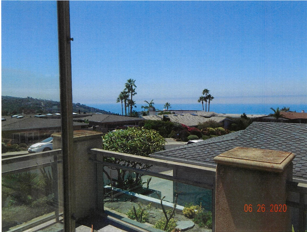
1510 Caribbean Way

The photograph above was taken from the living room on the main level of the primary residential structure.