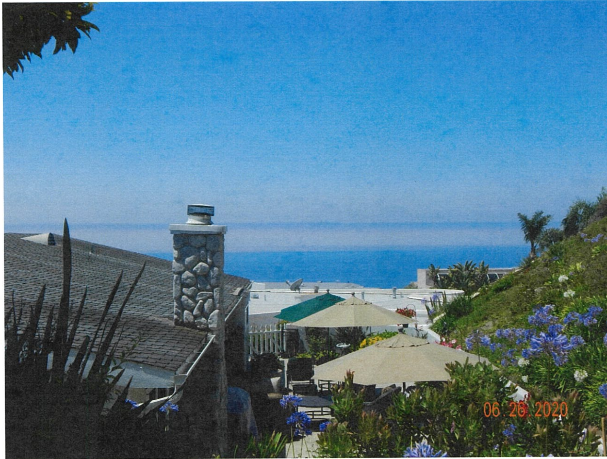
1510 Caribbean Way

The photograph above was taken from the master bedroom on the main level of the primary residential structure. Vegetation on any approved landscape plan with height limits established is exempt from record of view.