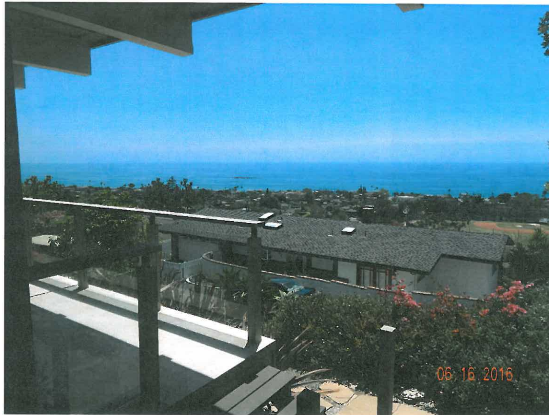
757 Coast View Drive

The photograph above was taken from the Guest bedroom on the lower level of the primary residential structure.