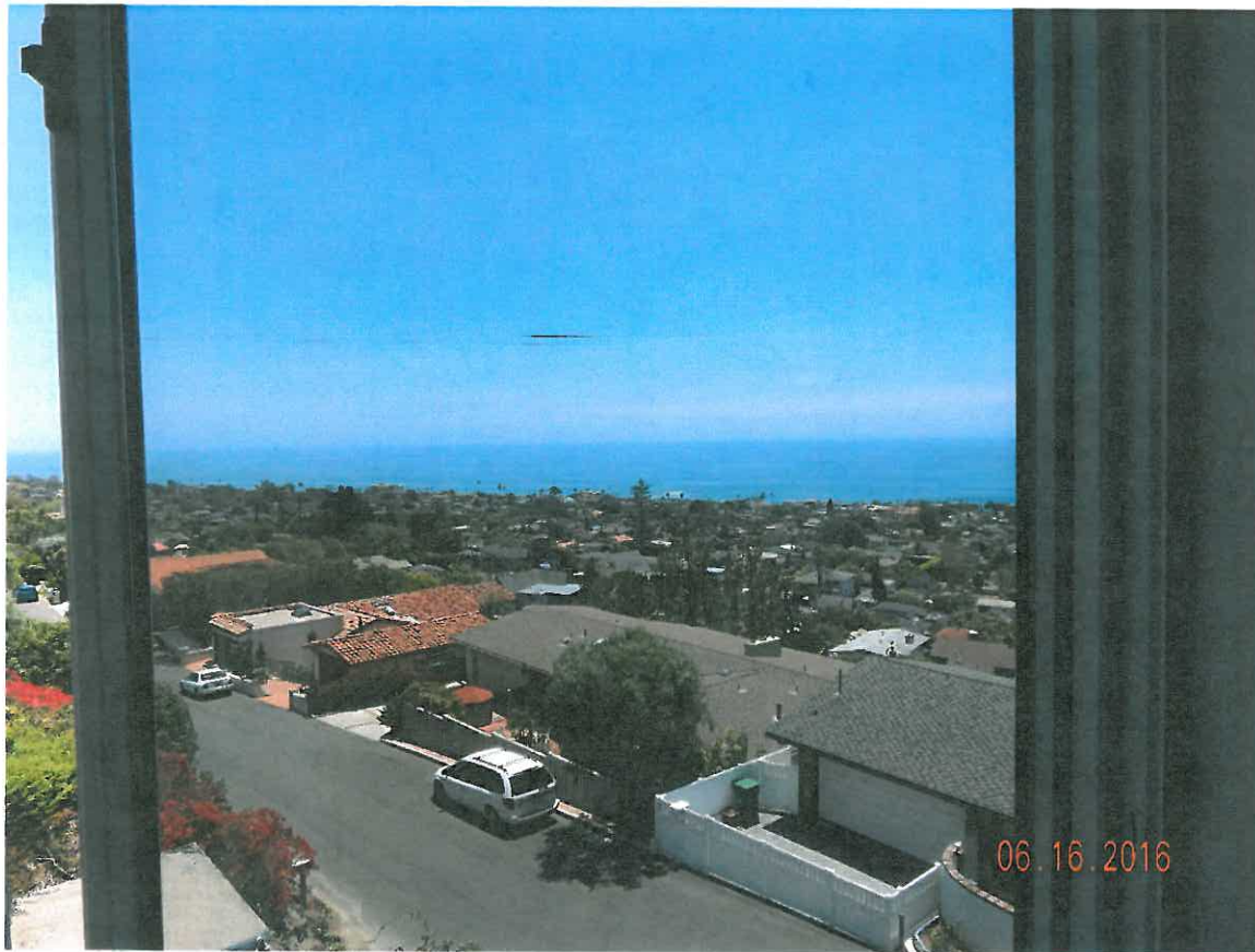
757 Coast View Drive

The photograph above was taken from the Dining room on the main floor of the primary residential structure.