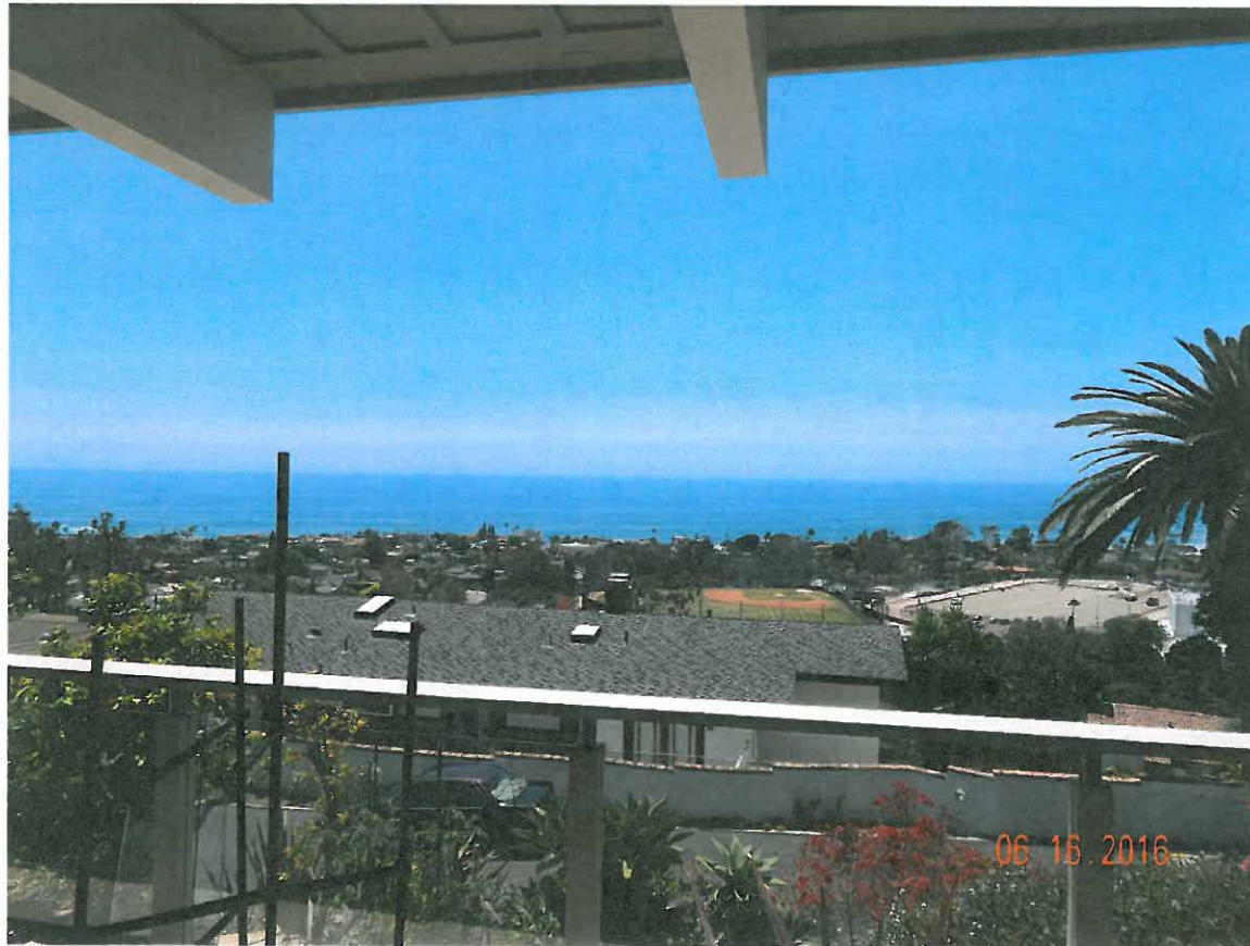
757 Coast View Drive

The photograph above was taken from the Family room on the lower level of the primary residential structure.