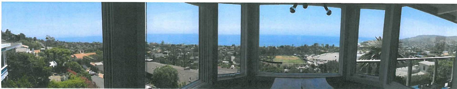
757 Coast View Drive

The photograph above was taken from the Dining room on the main floor of the primary residential structure.