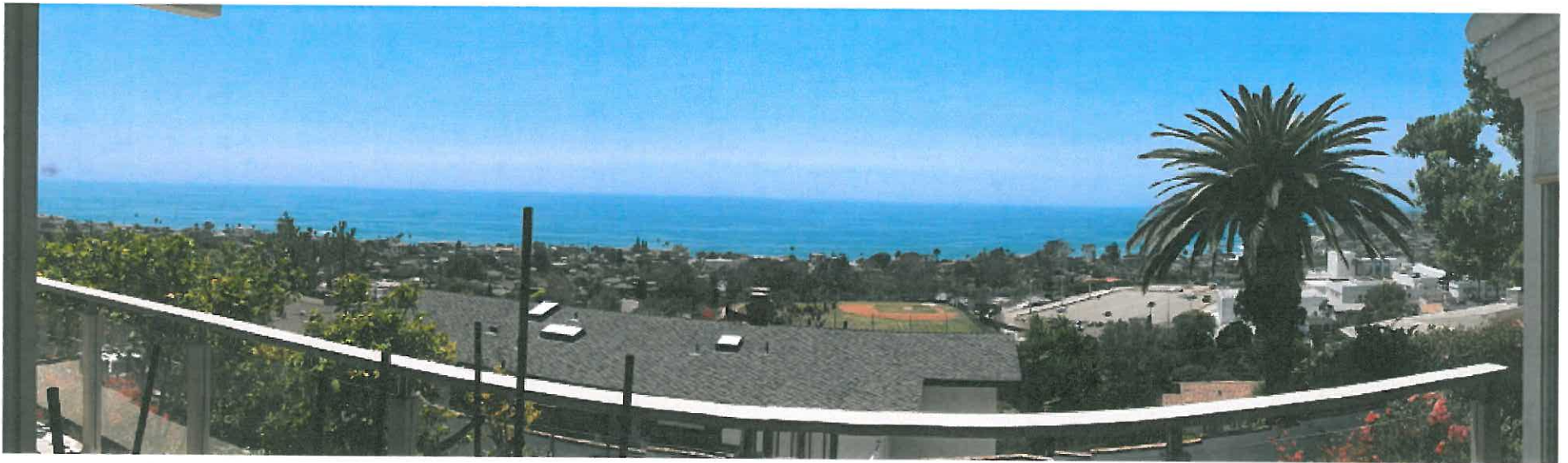
757 Coast View Drive

The photograph above was taken from the Family room on the lower level of the primary residential structure.