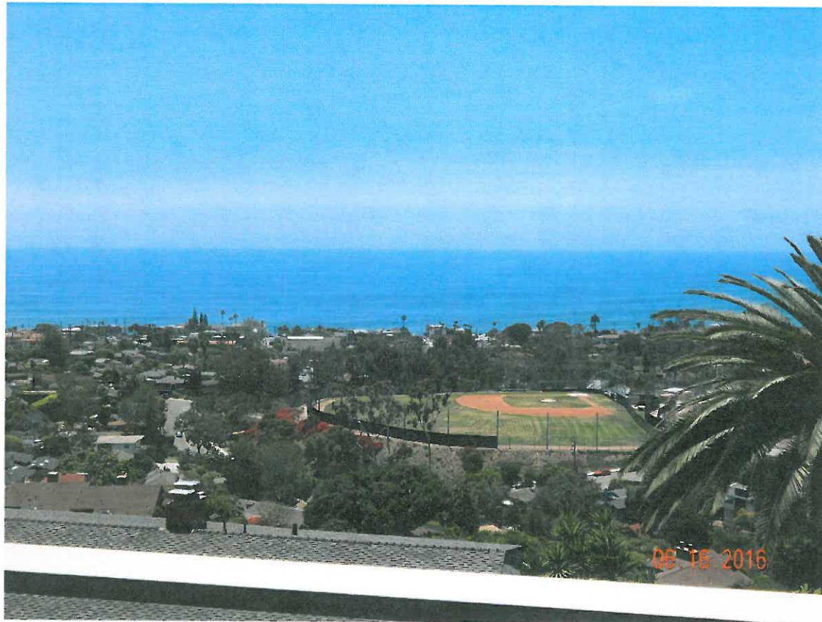
757 Coast View Drive

The photograph above was taken from the Master bedroom on the main floor of the primary residential structure.