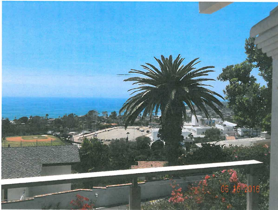
757 Coast View Drive

The photograph above was taken from the Family room on the lower level of the primary residential structure.