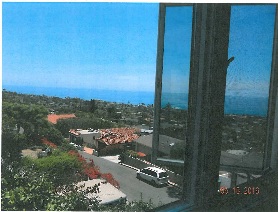
757 Coast View Drive

The photograph above was taken from the Kitchen on the main floor of the primary residential structure.