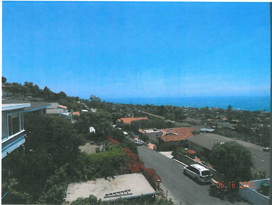
757 Coast View Drive

The photograph above was taken from the Dining room on the main floor of the primary residential structure.