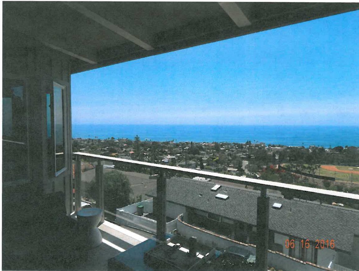
757 Coast View Drive

The photograph above was taken from the Living room on the main floor of the primary residential structure.