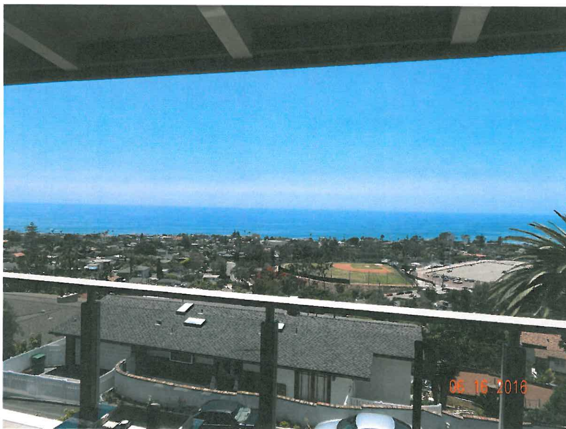
757 Coast View Drive

The photograph above was taken from the Living room on the main floor of the primary residential structure.