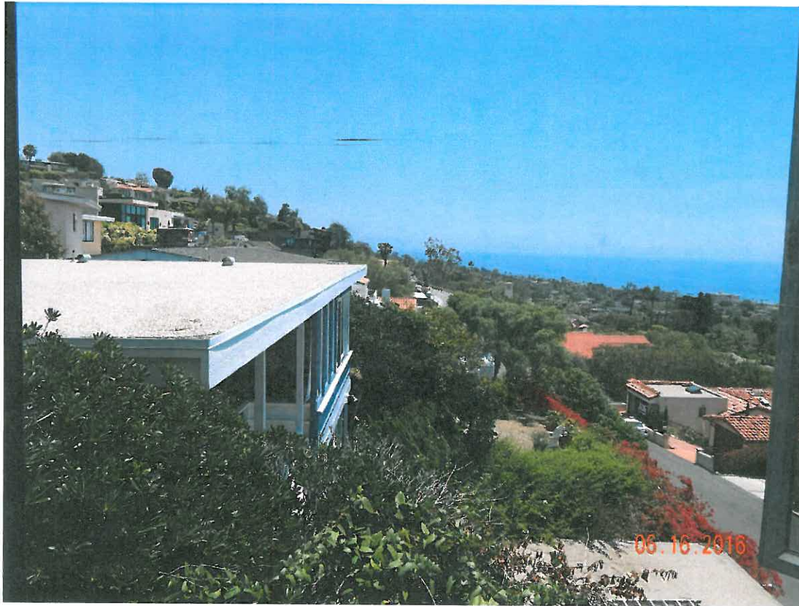
757 Coast View Drive

The photograph above was taken from the Kitchen on the main floor of the primary residential structure.