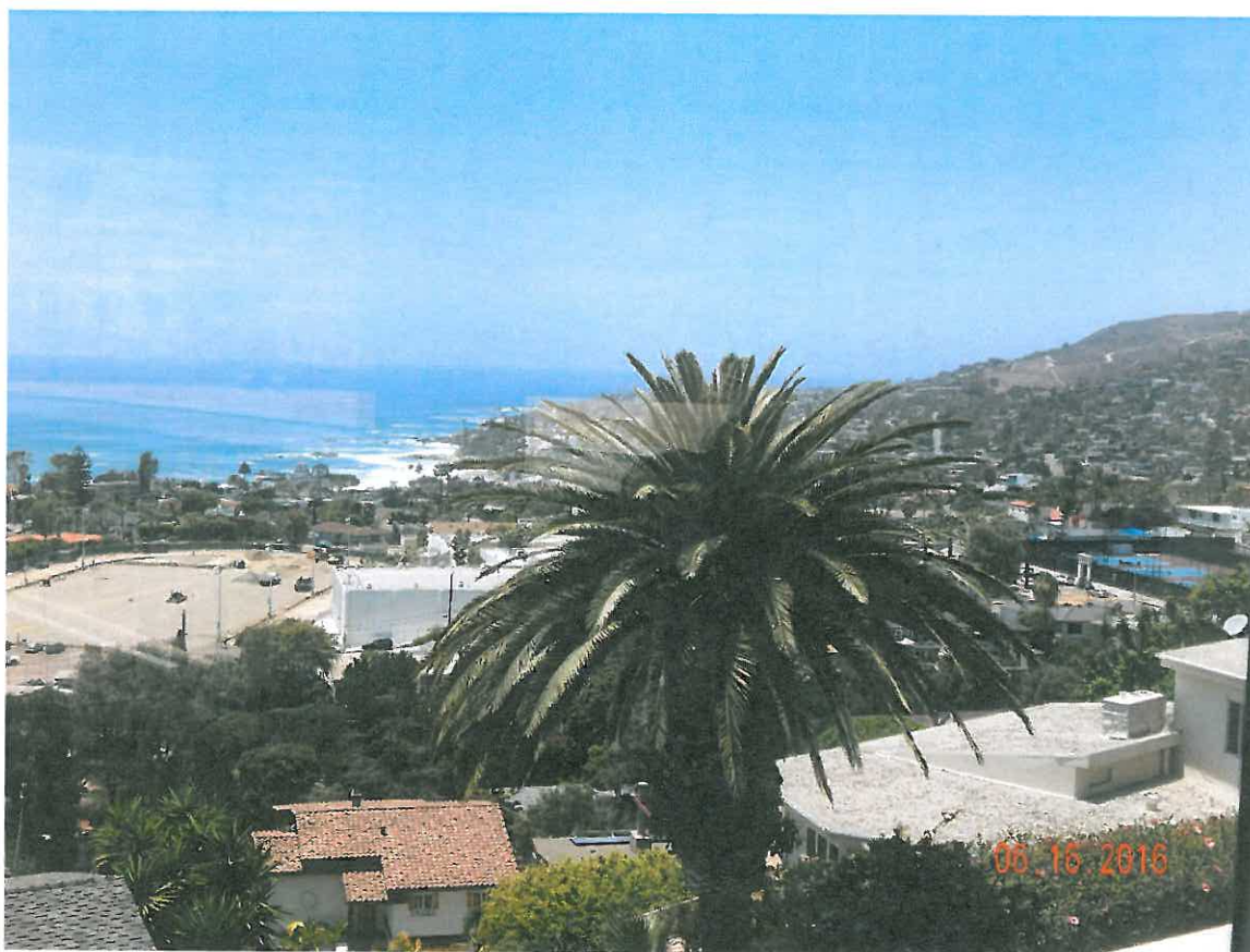
757 Coast View Drive

The photograph above was taken from the Dining room on the main floor of the primary residential structure.