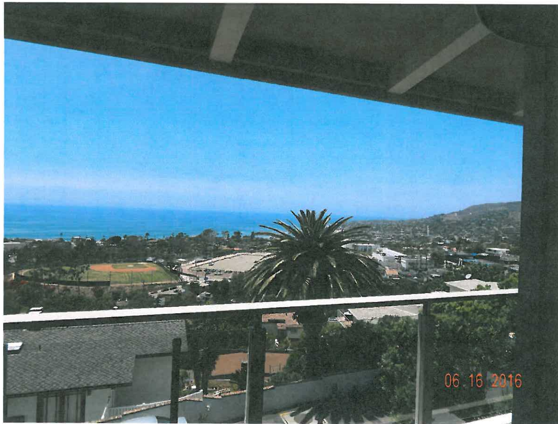
757 Coast View Drive

The photograph above was taken from the Living room on the main floor of the primary residential structure.