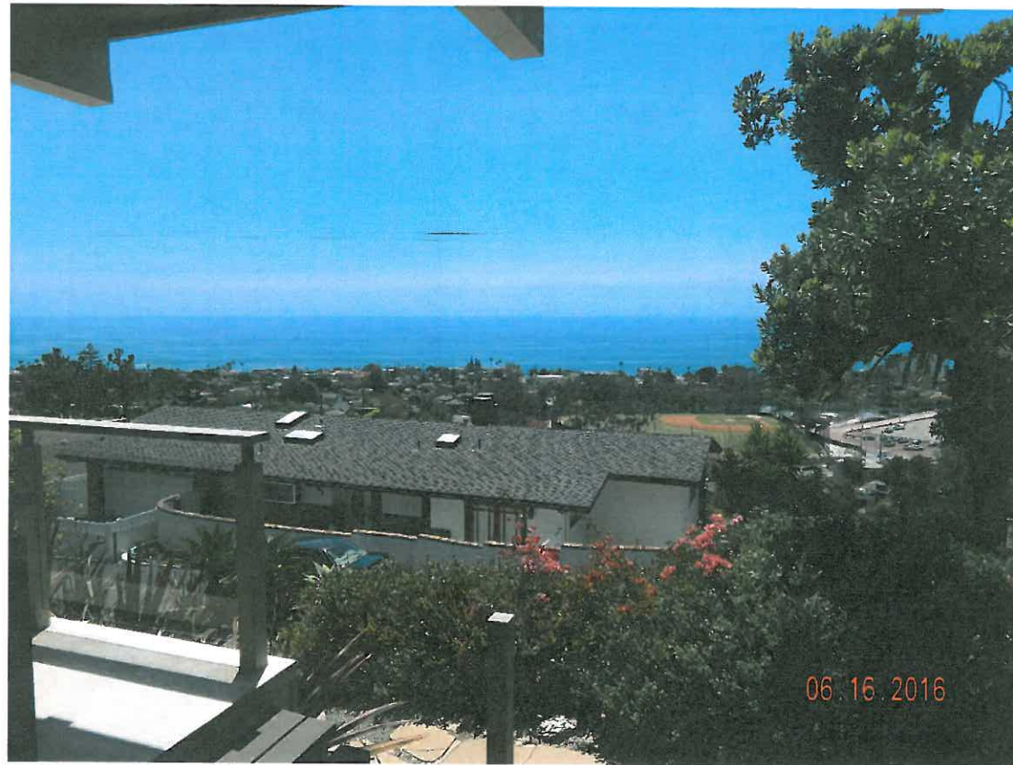
757 Coast View Drive

The photograph above was taken from the Guest bedroom on the lower level of the primary residential structure.