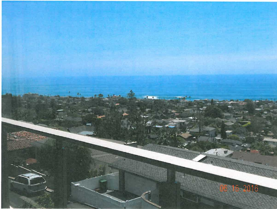
757 Coast View Drive

The photograph above was taken from the Master bedroom on the main floor of the primary residential structure.