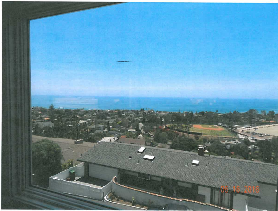
757 Coast View Drive

The photograph above was taken from the Dining room on the main floor of the primary residential structure.