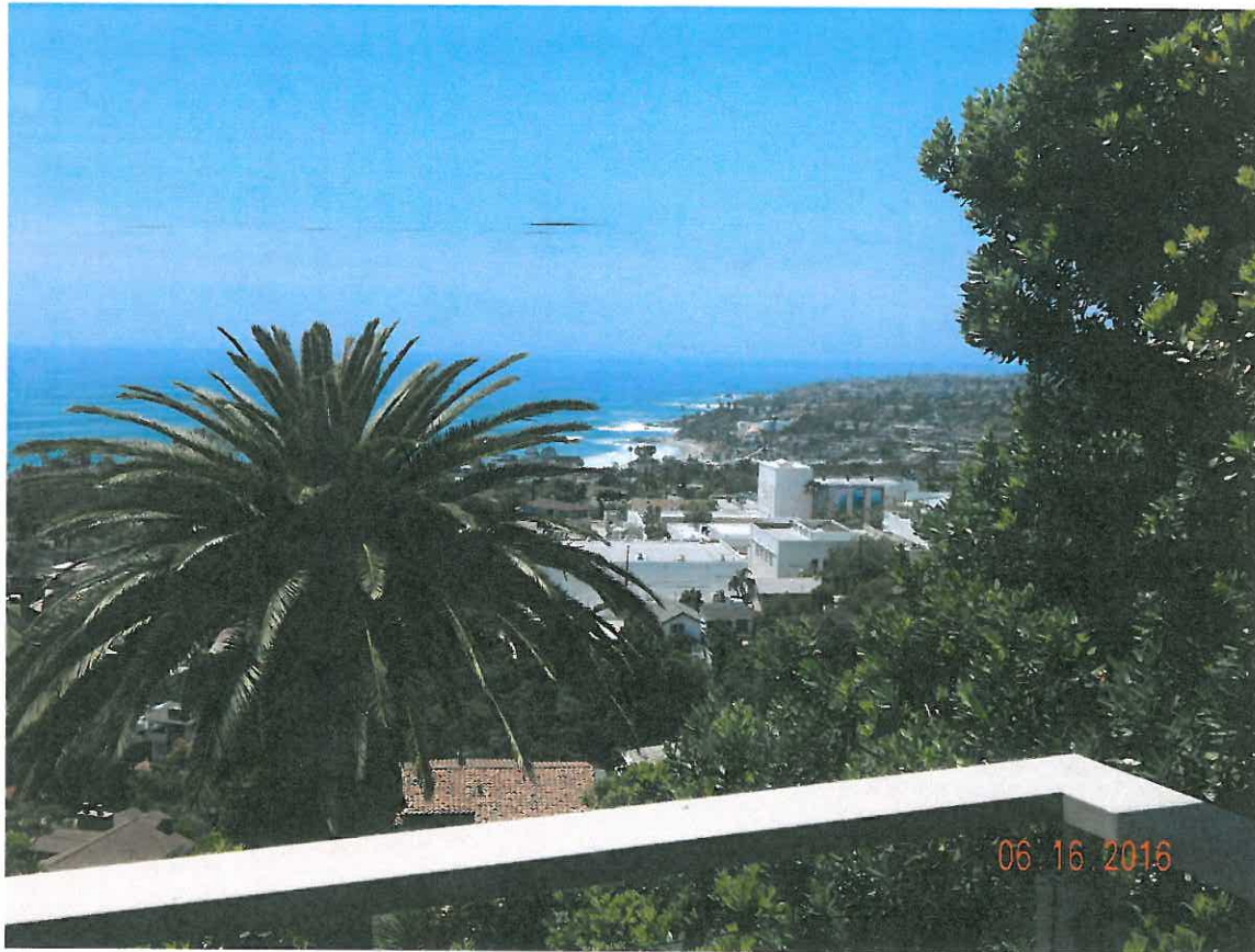
757 Coast View Drive

The photograph above was taken from the Master bedroom on the main floor of the primary residential structure.