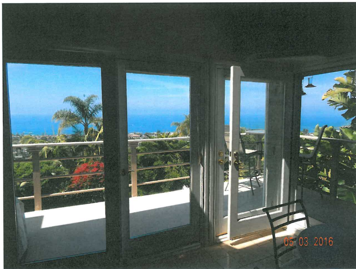
866 Coast View Dr.

The photograph above was taken from the Kitchen on the upper level of the primary residential structure.