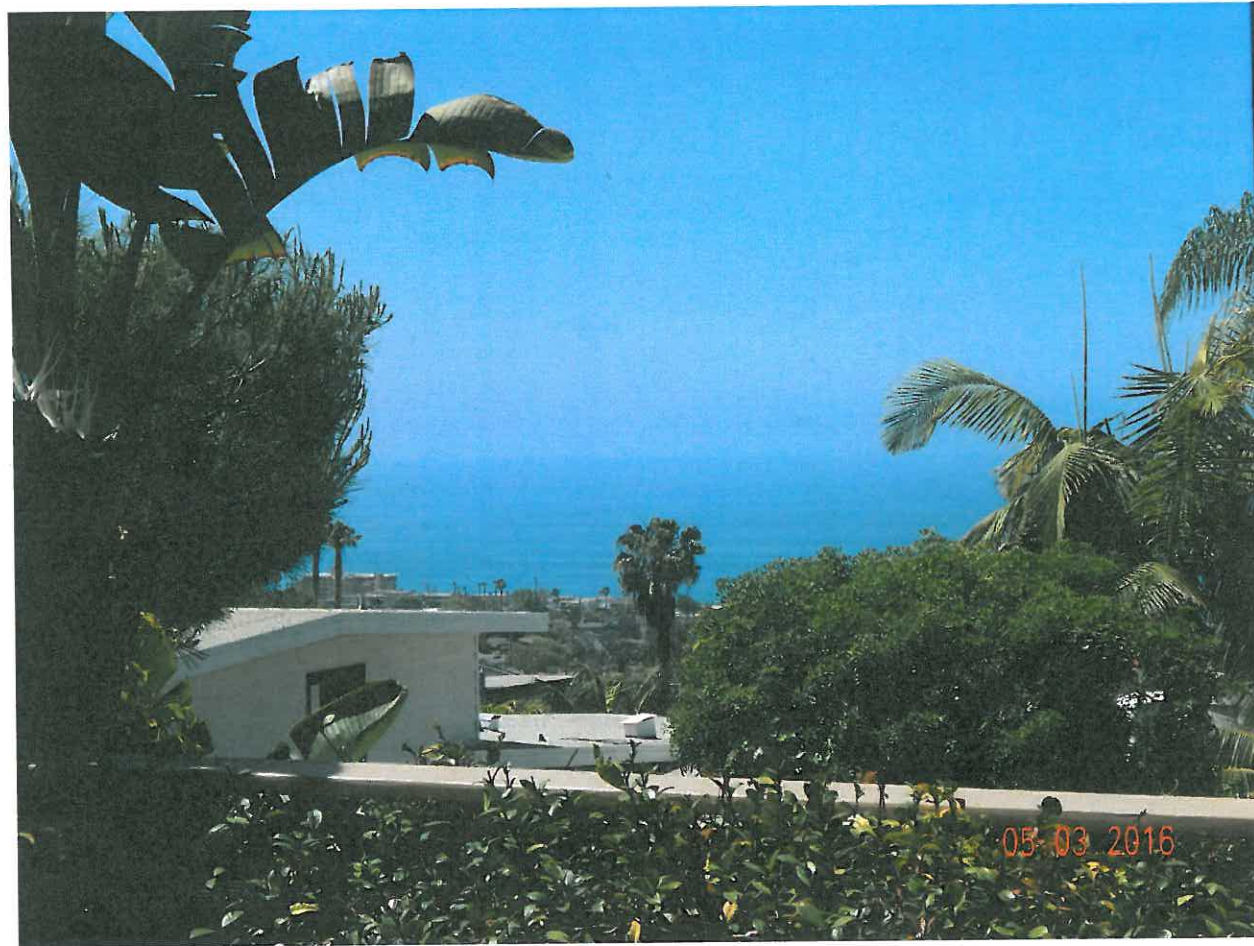
866 Coast View Dr.

The photograph above was taken from the Master bedroom on the lower level of the primary residential structure.