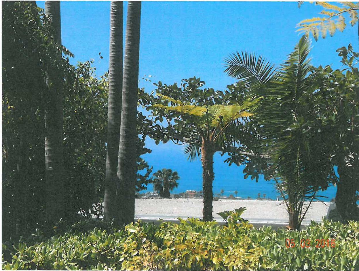
866 Coast View Dr.

The photograph above was taken from the Guest bedroom on the lower level of the primary residential structure.