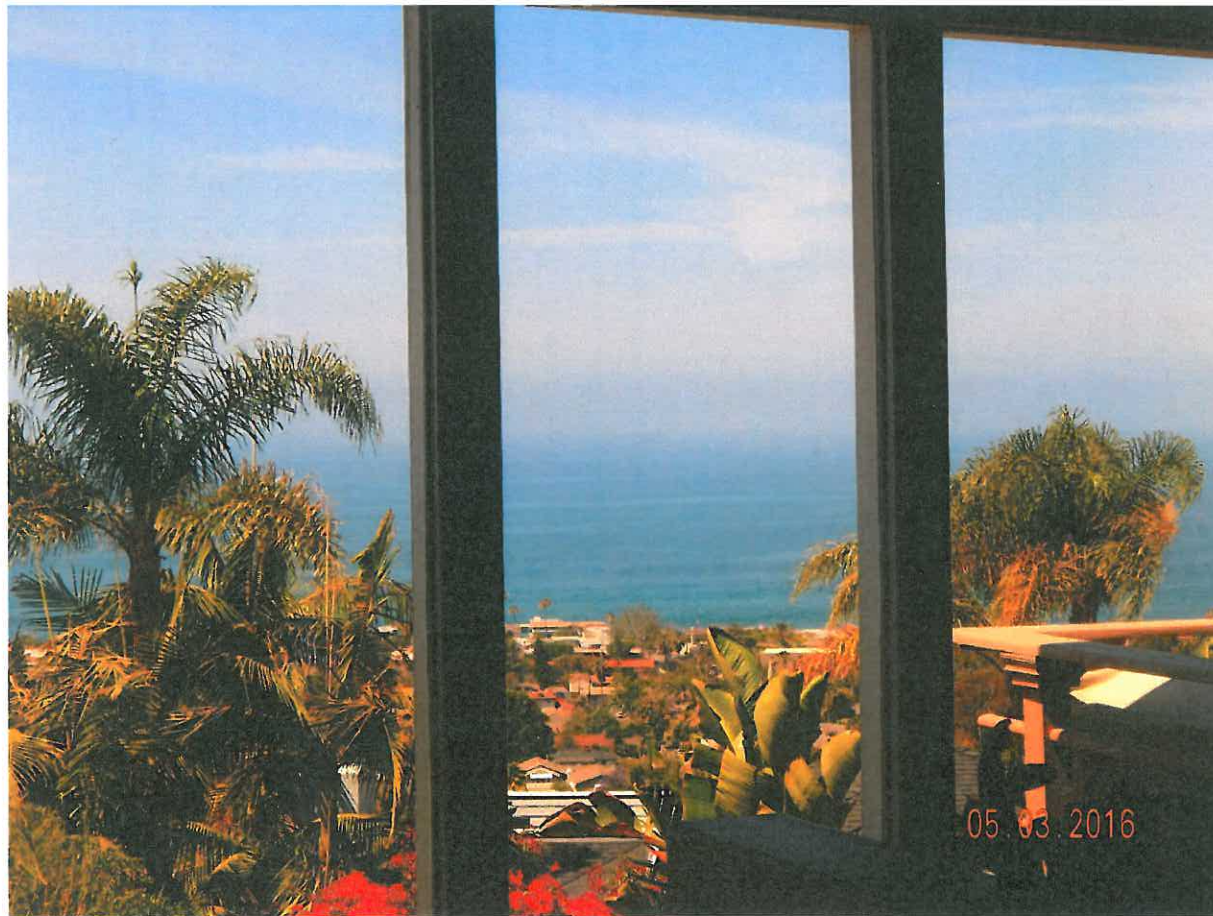
866 Coast View Dr.

The photograph above was taken from the Dining room on the upper level of the primary residential structure.