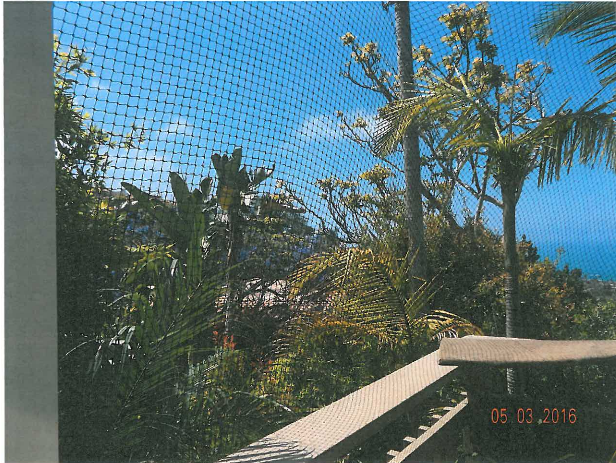
866 Coast View Dr.

The photograph above was taken from the Living room on the upper level of the primary residential structure.