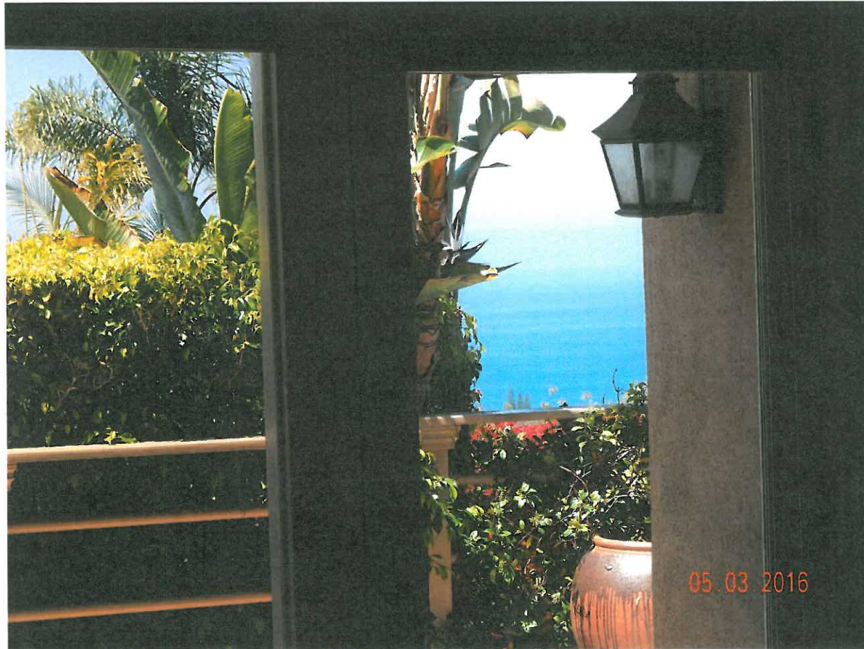
866 Coast View Dr.

The photograph above was taken from the Family room on the lower level of the primary residential structure.