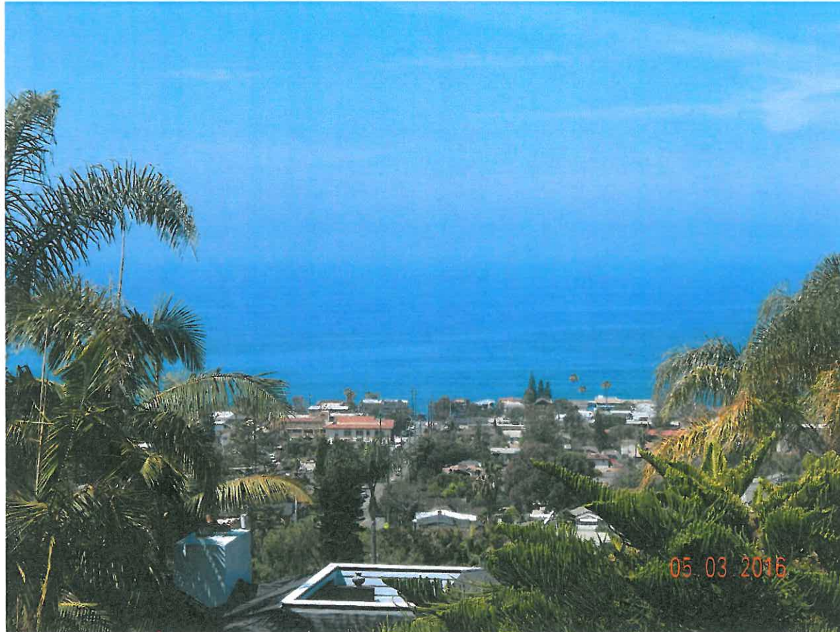
866 Coast View Dr.

The photograph above was taken from the Kitchen on the upper level of the primary residential structure.