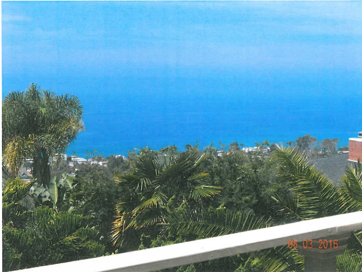
866 Coast View Dr.

The photograph above was taken from the Kitchen on the upper level of the primary residential structure.