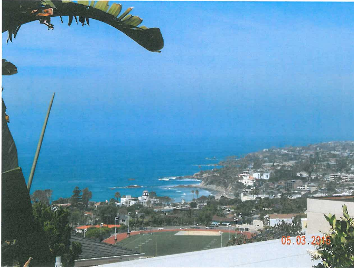
866 Coast View Dr.

The photograph above was taken from the Kitchen on the upper level of the primary residential structure.