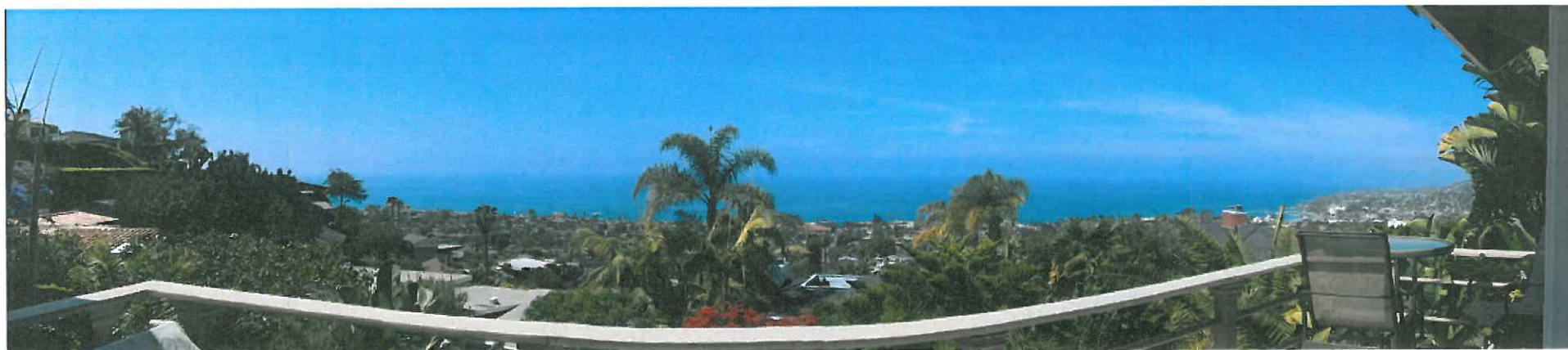
866 Coast View Dr.

The photograph above was taken from the Kitchen on the upper level of the primary residential structure.