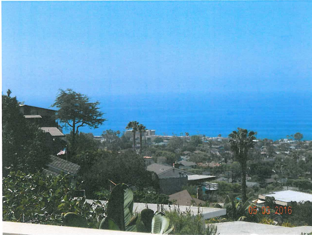
866 Coast View Dr.

The photograph above was taken from the Kitchen on the upper level of the primary residential structure.