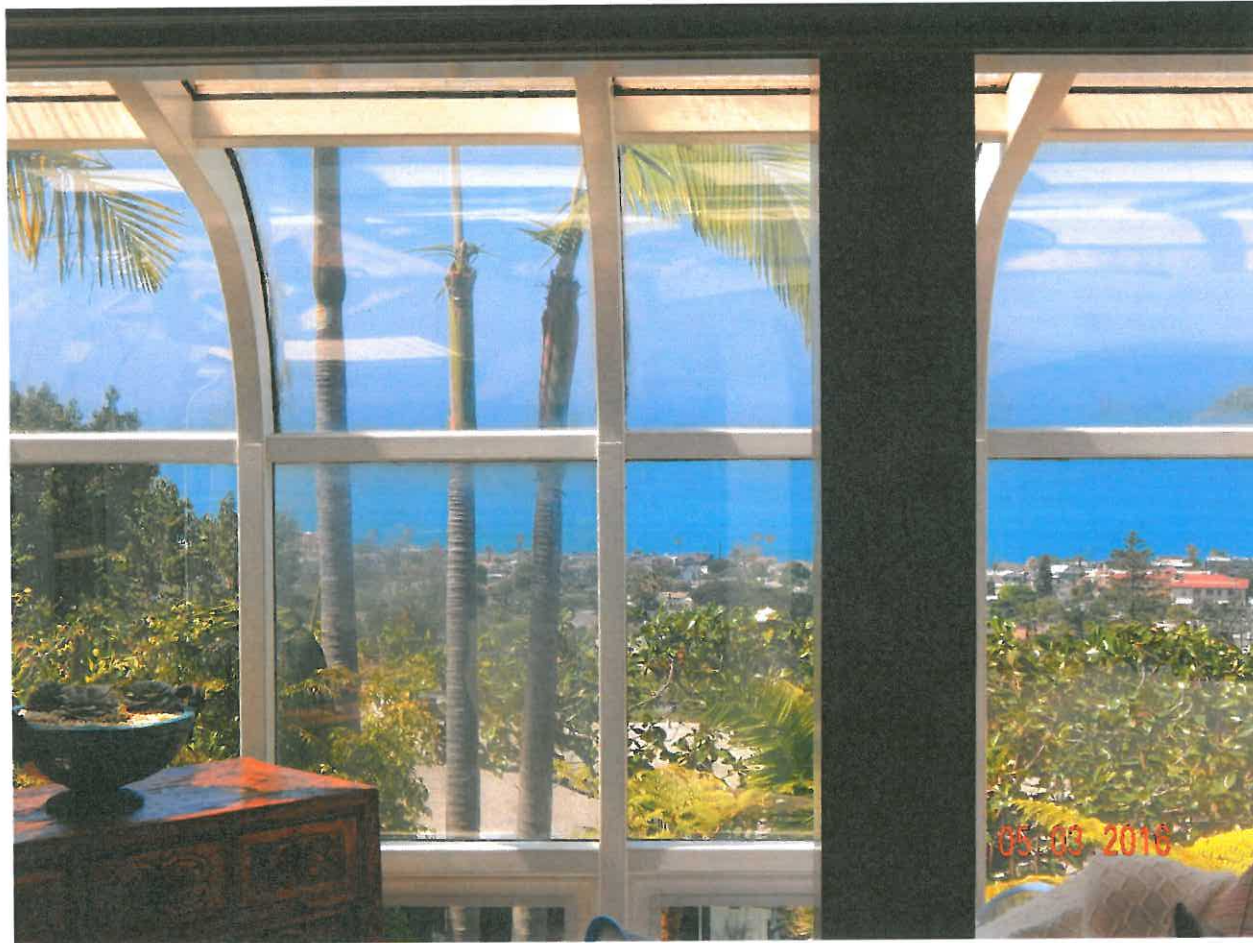
866 Coast View Dr.

The photograph above was taken from the Living room on the upper level of the primary residential structure.