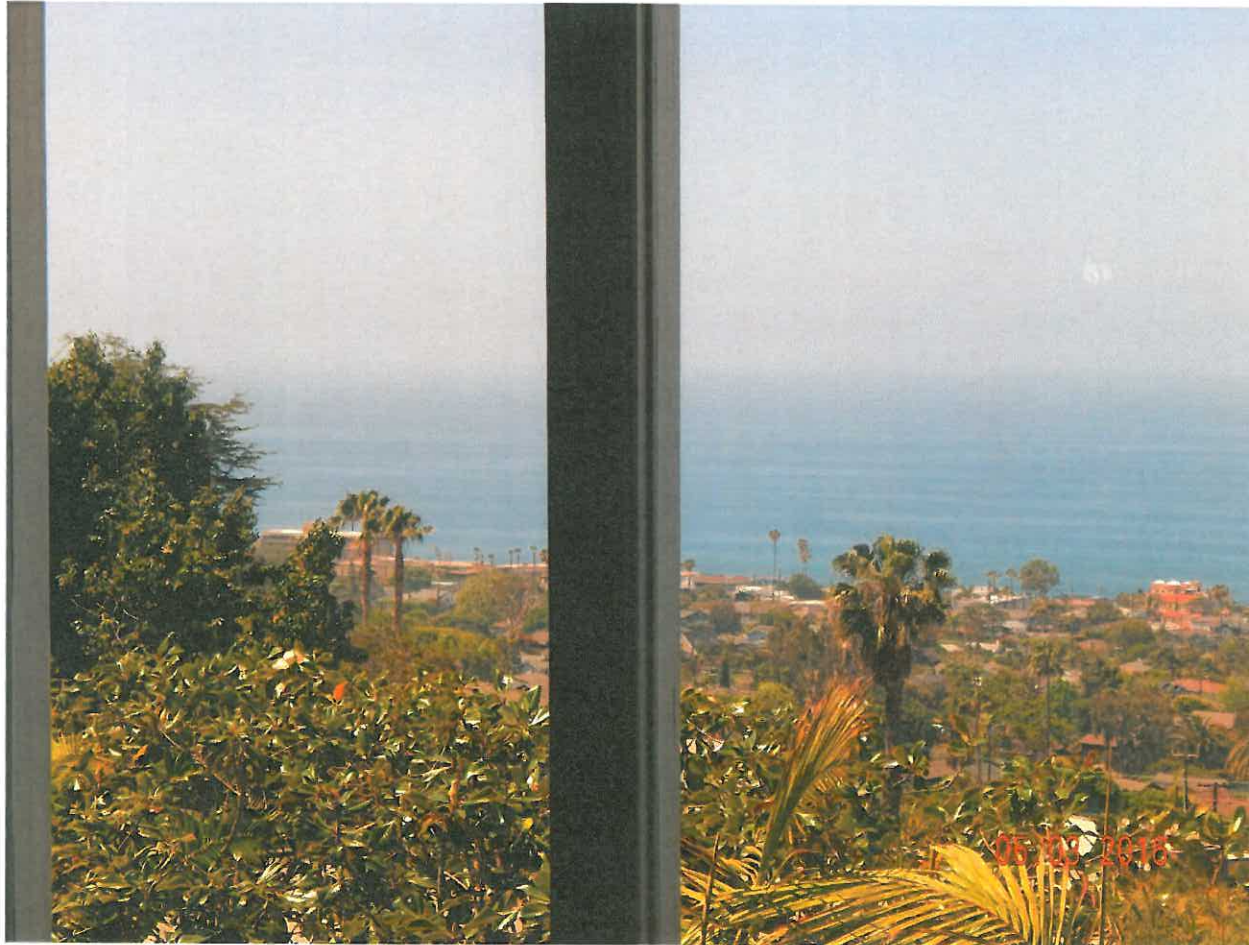
866 Coast View Dr.

The photograph above was taken from the Dining room on the upper level of the primary residential structure.