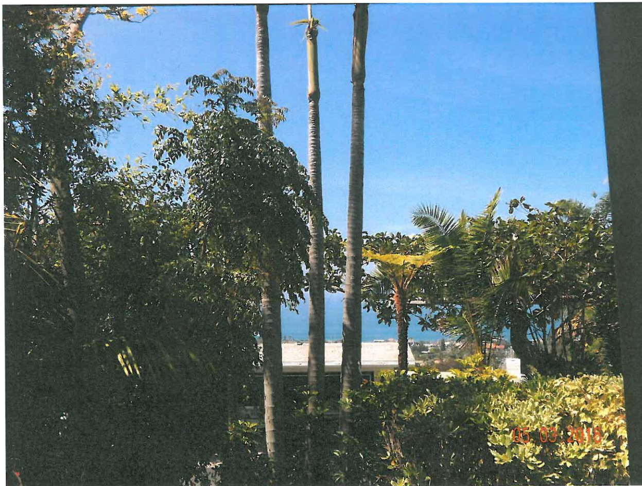
866 Coast View Dr.

The photograph above was taken from the Office on the lower level of the primary residential structure.