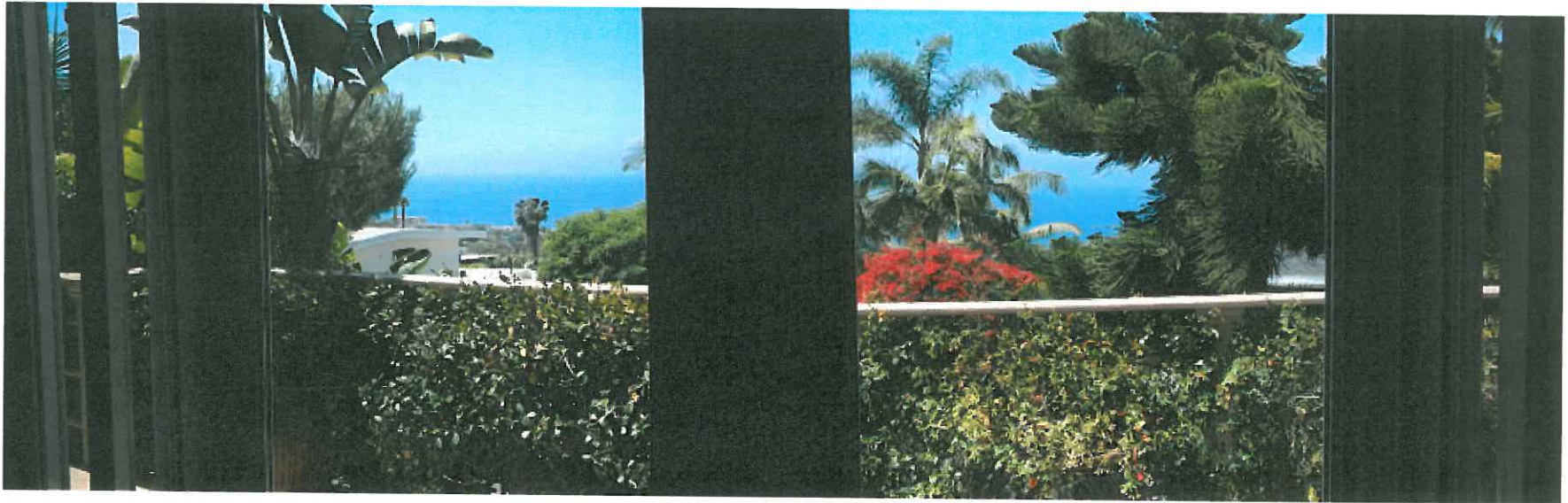
866 Coast View Dr.

The photograph above was taken from the Master bedroom on the lower level of the primary residential structure.