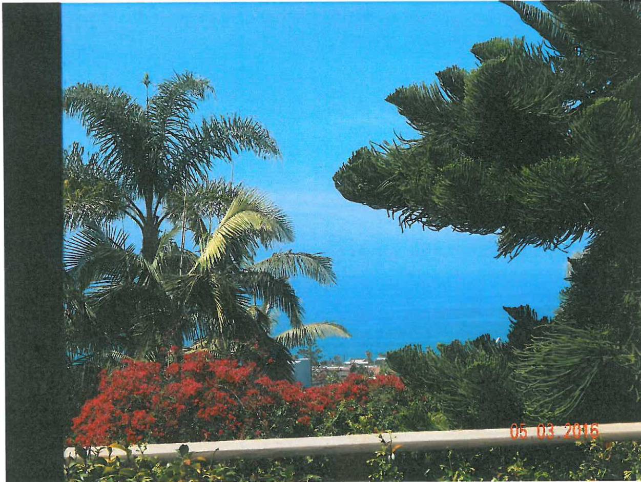
866 Coast View Dr.

The photograph above was taken from the Master bedroom on the lower level of the primary residential structure.