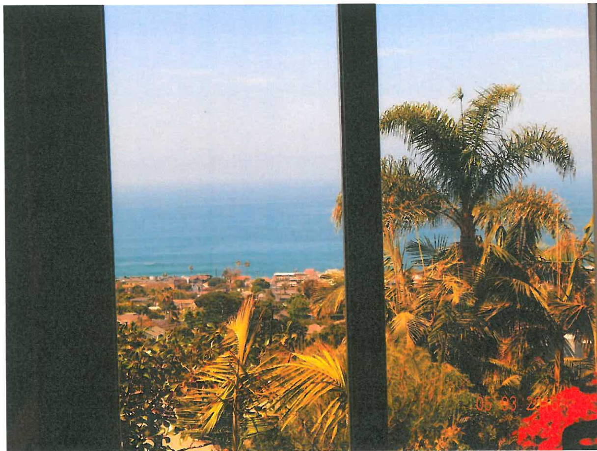
866 Coast View Dr.

The photograph above was taken from the Dining room on the upper level of the primary residential structure.