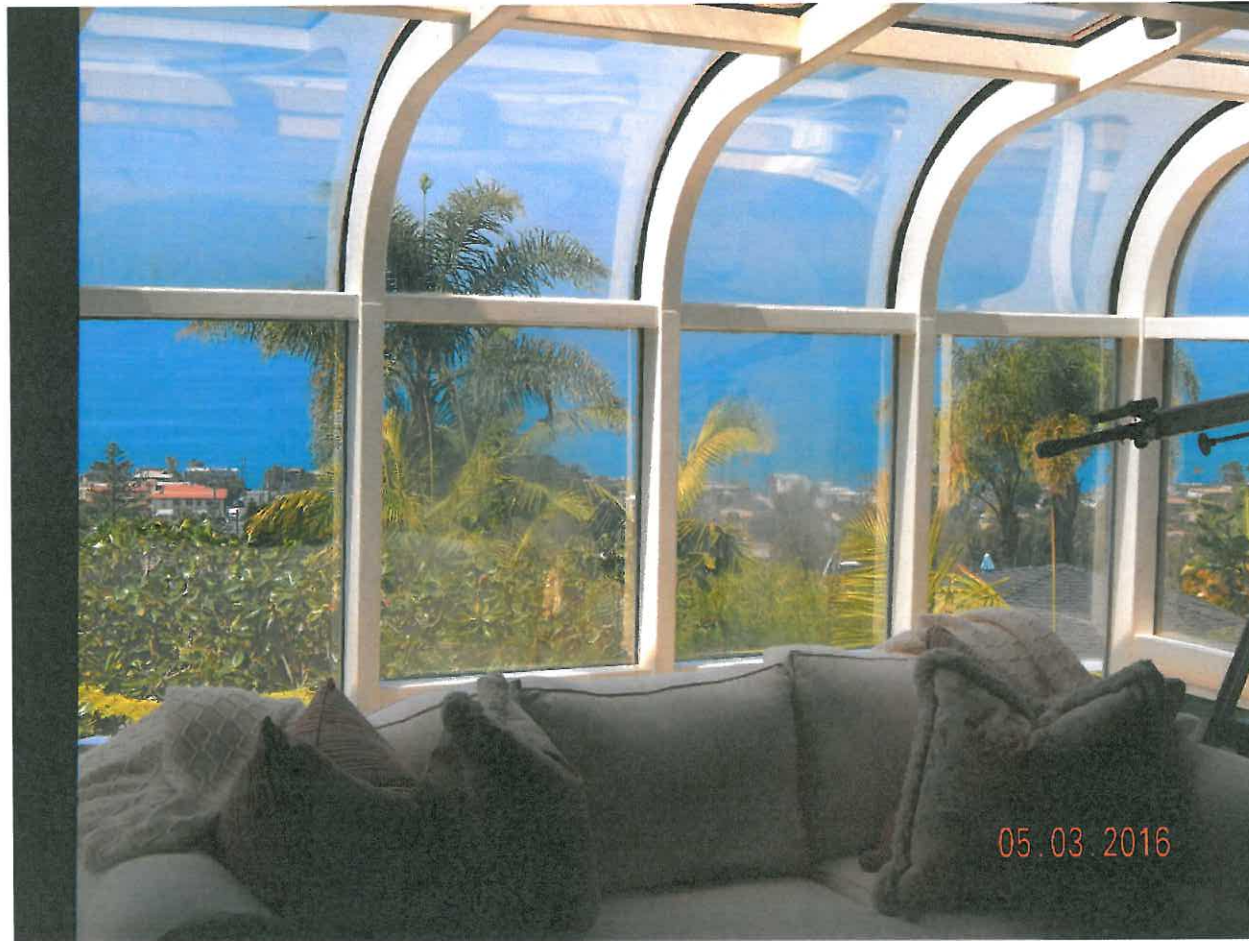
866 Coast View Dr.

The photograph above was taken from the Living room on the upper level of the primary residential structure.