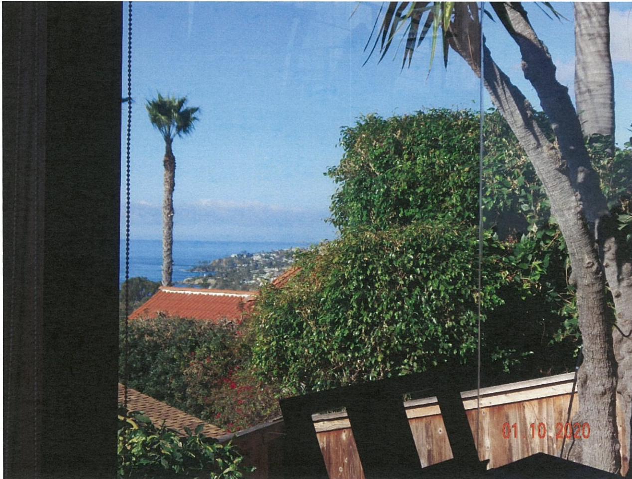
999 Coast View Dr.

The photograph above was taken from the office on the lower level of the primary residential structure.