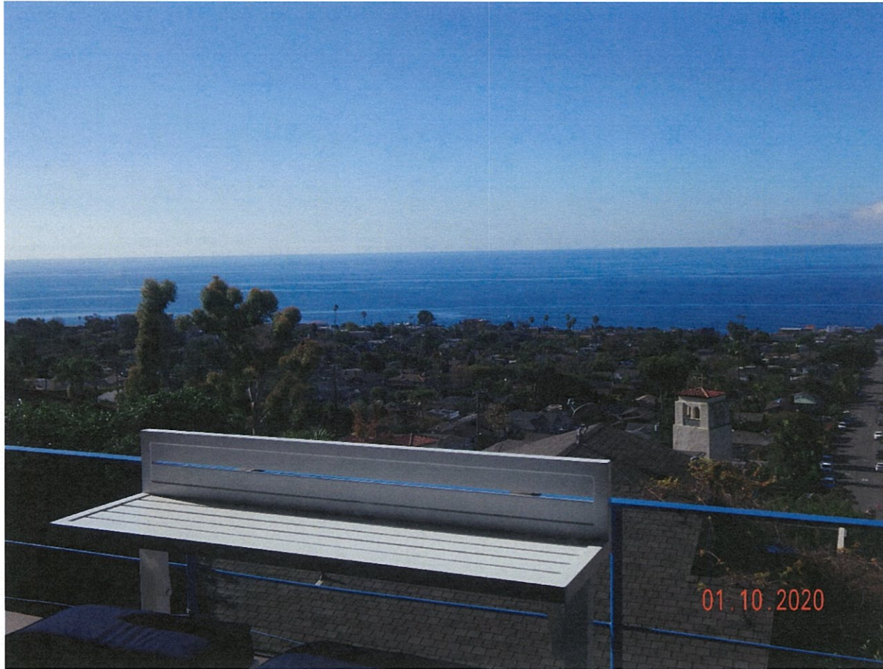
999 Coast View Dr.

The photograph above was taken from the dining room on the main level of the primary residential structure.