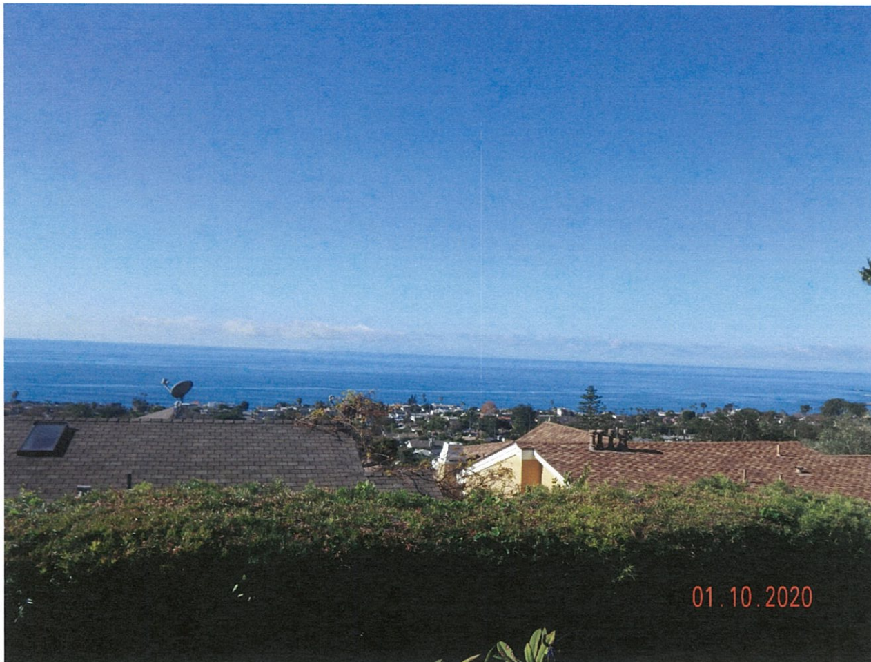
999 Coast View Dr.

The photograph above was taken from the master bedroom on the lower level of the primary residential structure.