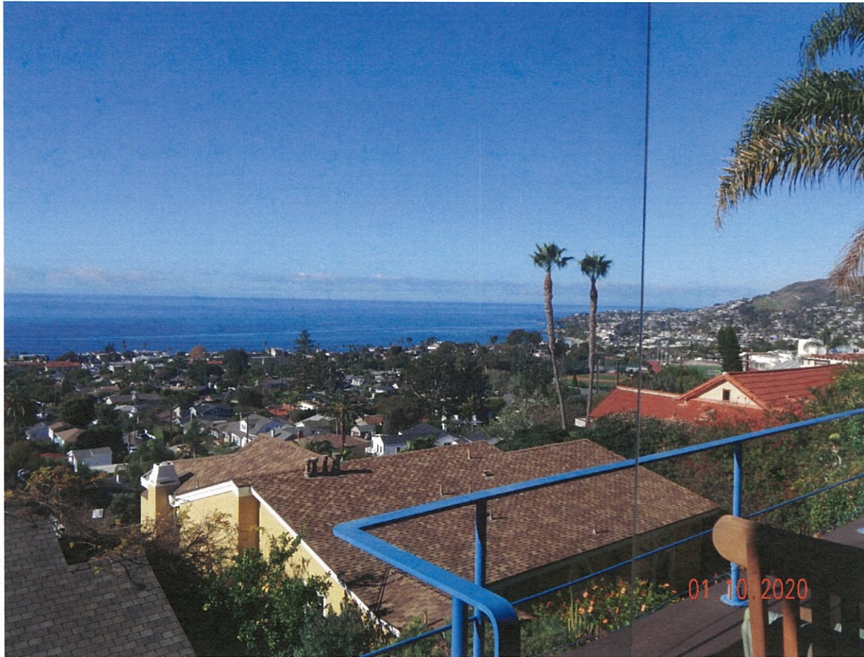
999 Coast View Dr.

The photograph above was taken from the living room on the main level of the primary residential structure.