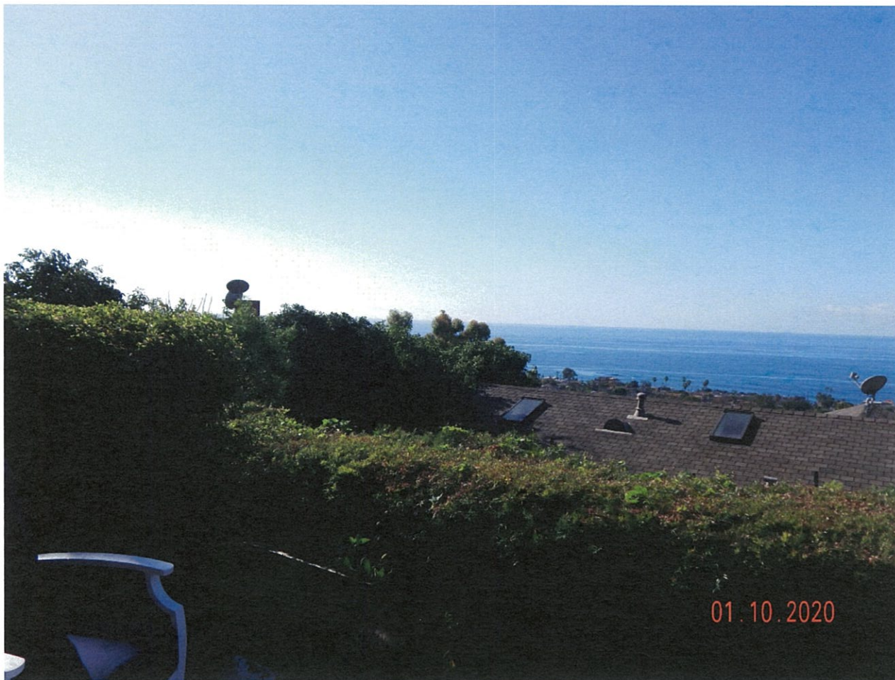
999 Coast View Dr.

The photograph above was taken from the master bedroom on the lower level of the primary residential structure.