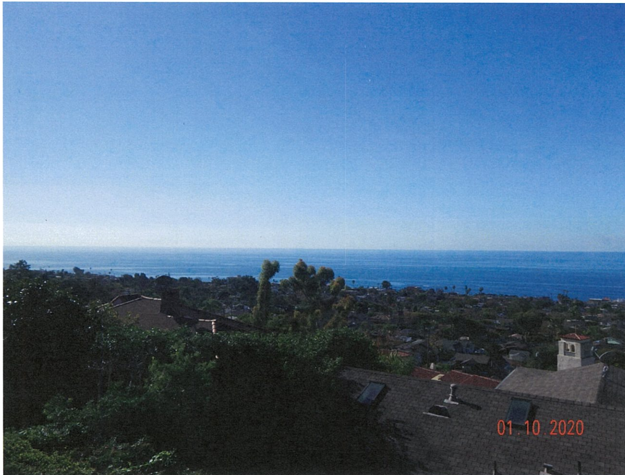
999 Coast View Dr.

The photograph above was taken from the living room on the main level of the primary residential structure.