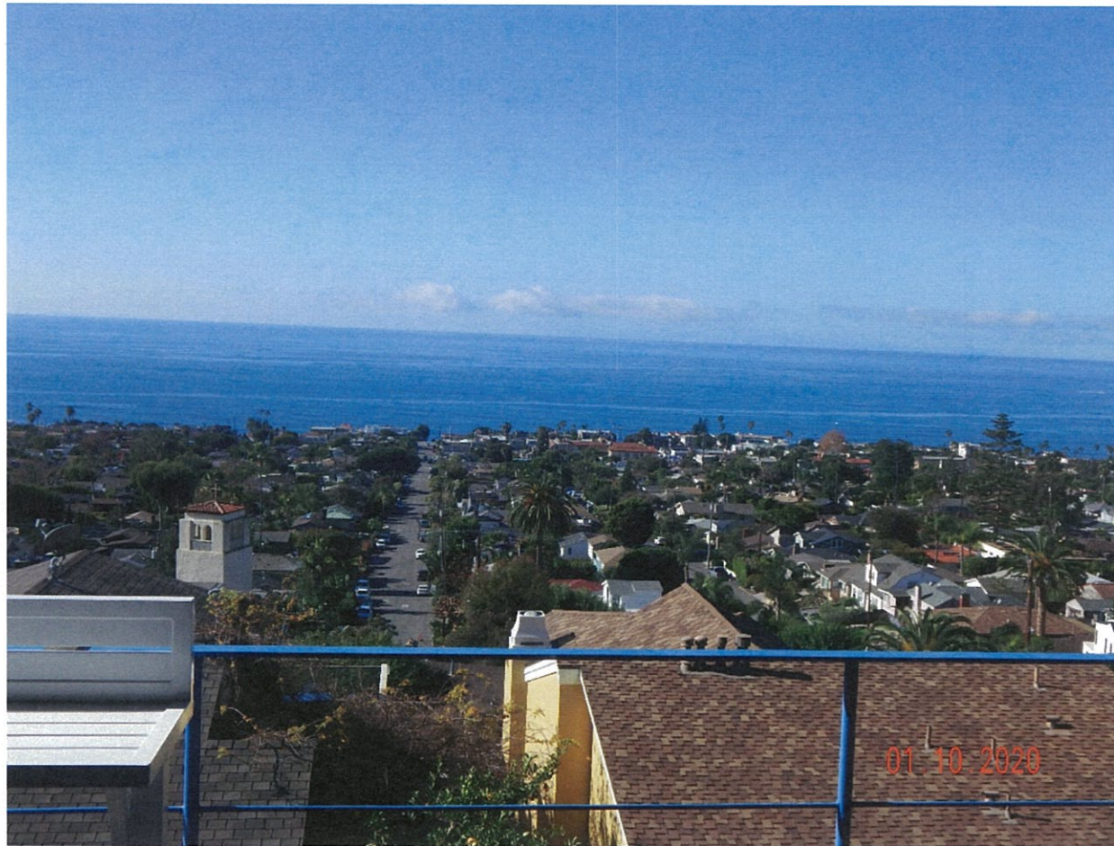
999 Coast View Dr.

The photograph above was taken from the dining room on the main level of the primary residential structure.