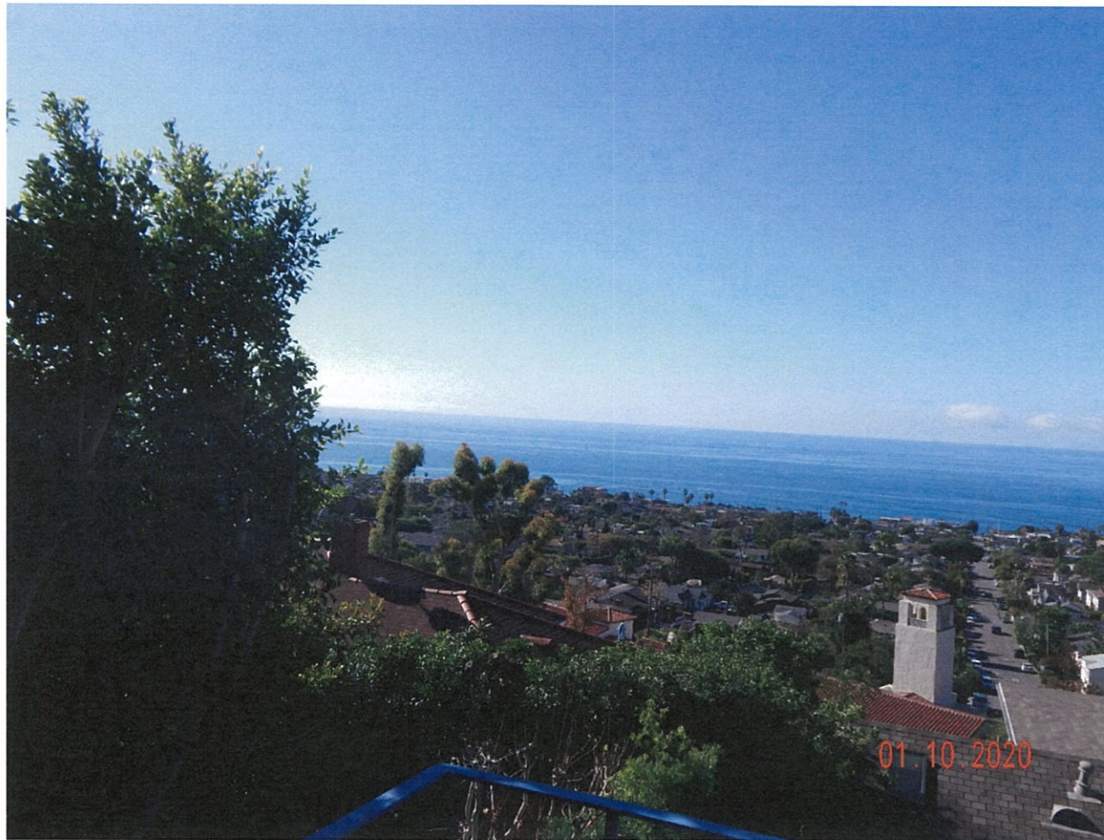
999 Coast View Dr.

The photograph above was taken from the guest bedroom on the main level of the primary residential structure.