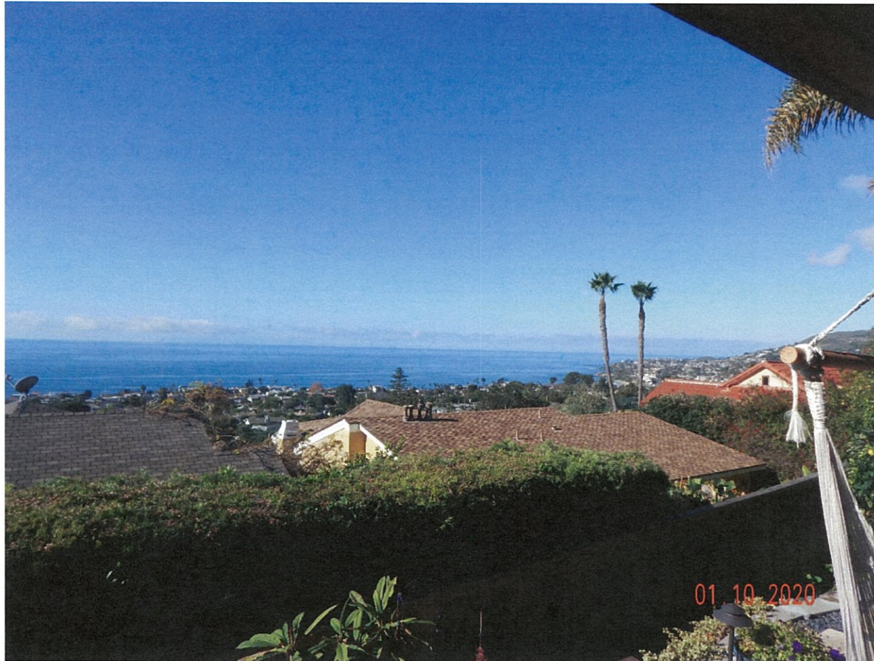
999 Coast View Dr.

The photograph above was taken from the master bedroom on the lower level of the primary residential structure.