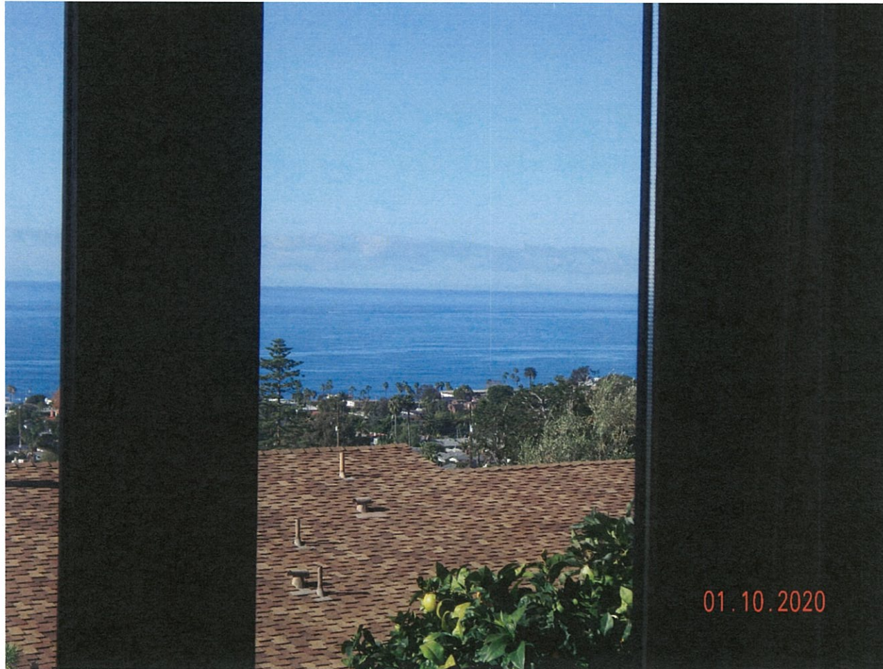
999 Coast View Dr.

The photograph above was taken from the office on the lower level of the primary residential structure.