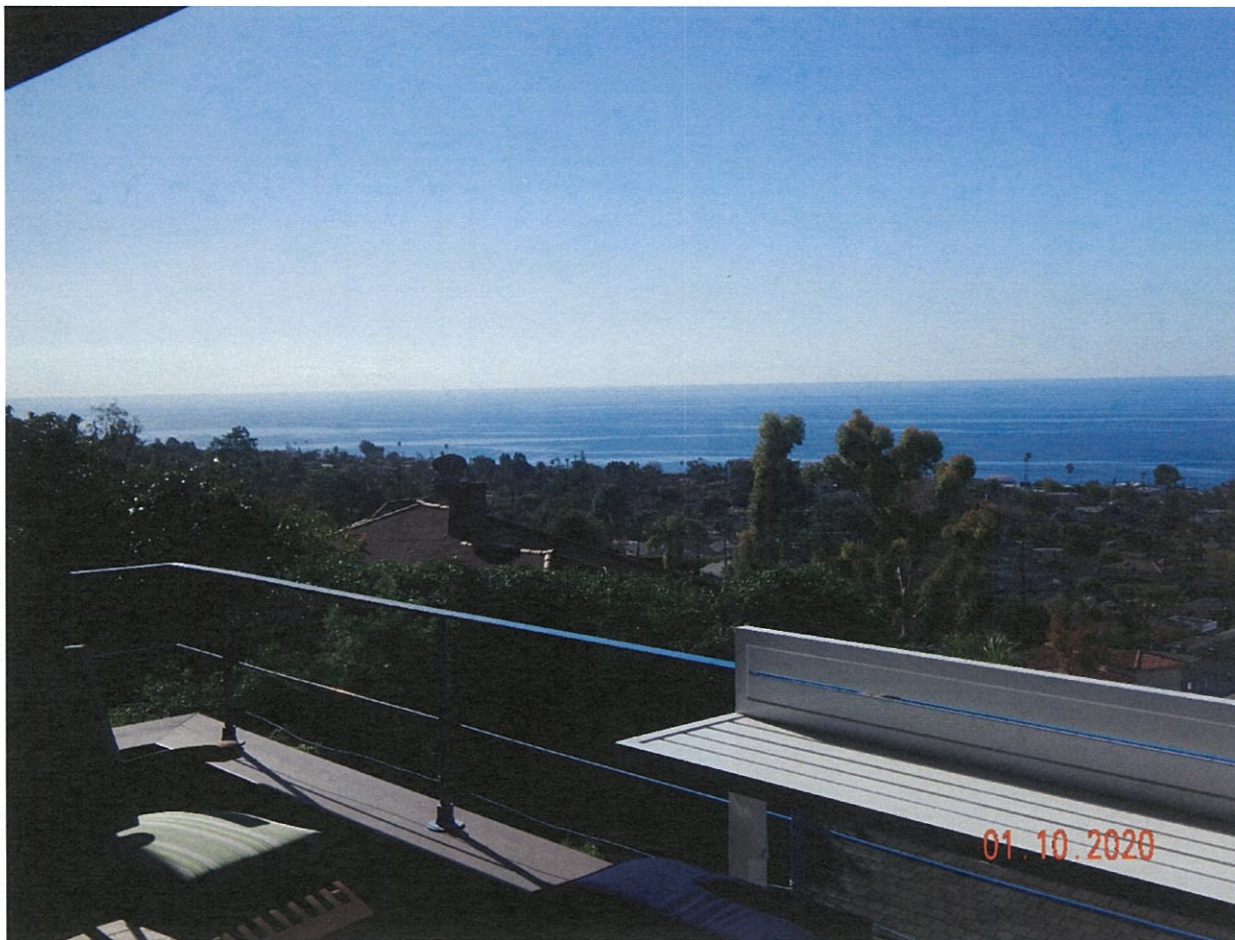
999 Coast View Dr.

The photograph above was taken from the dining room on the main level of the primary residential structure.