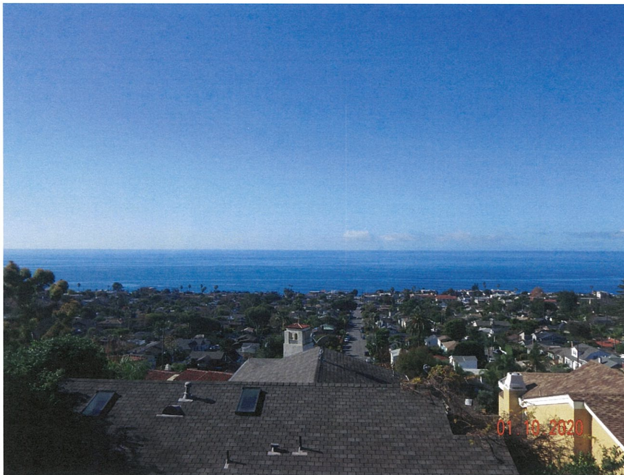
999 Coast View Dr.

The photograph above was taken from the living room on the main level of the primary residential structure.