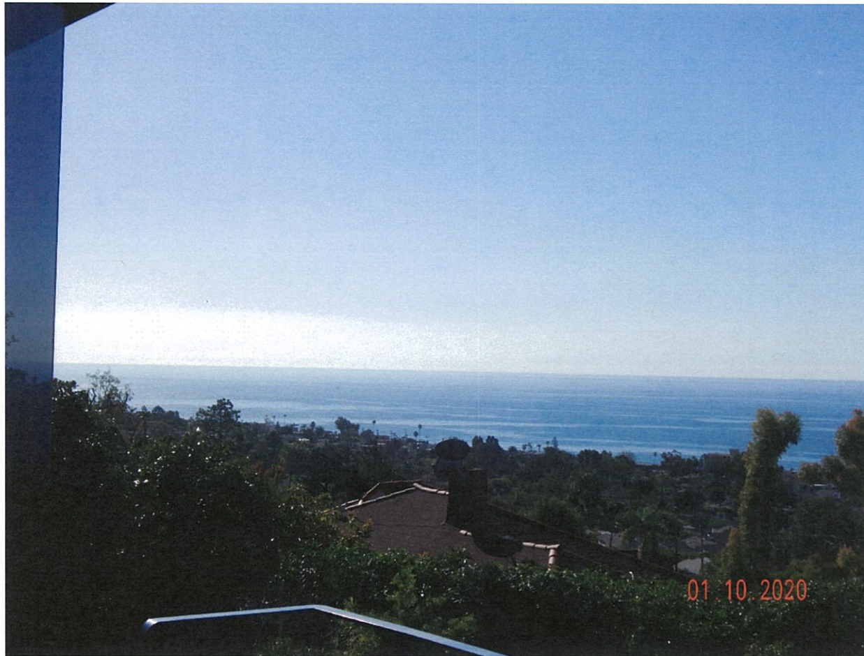
999 Coast View Dr.

The photograph above was taken from the dining room on the main level of the primary residential structure.