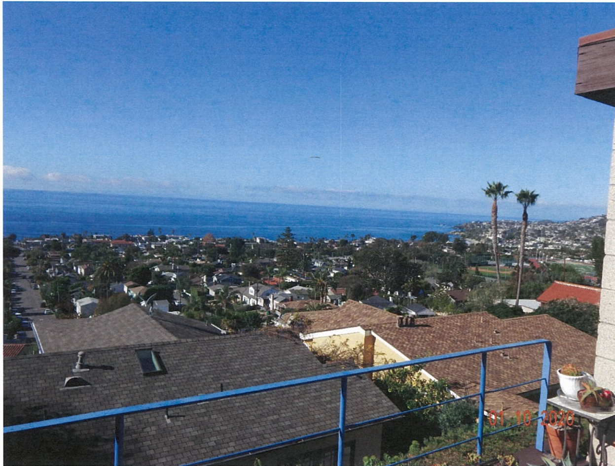
999 Coast View Dr.

The photograph above was taken from the guest bedroom on the main level of the primary residential structure.