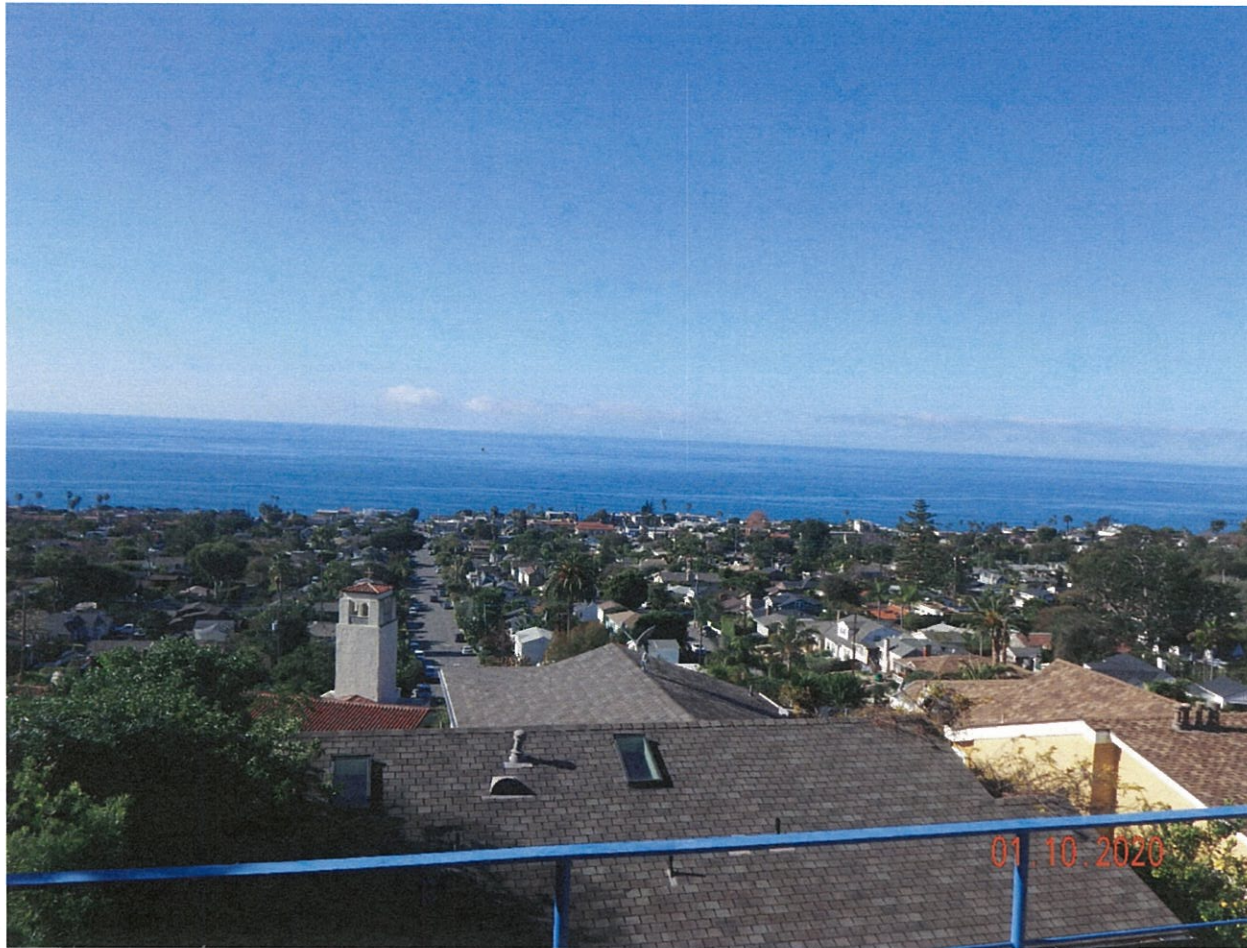
999 Coast View Dr.

The photograph above was taken from the guest bedroom on the main level of the primary residential structure.