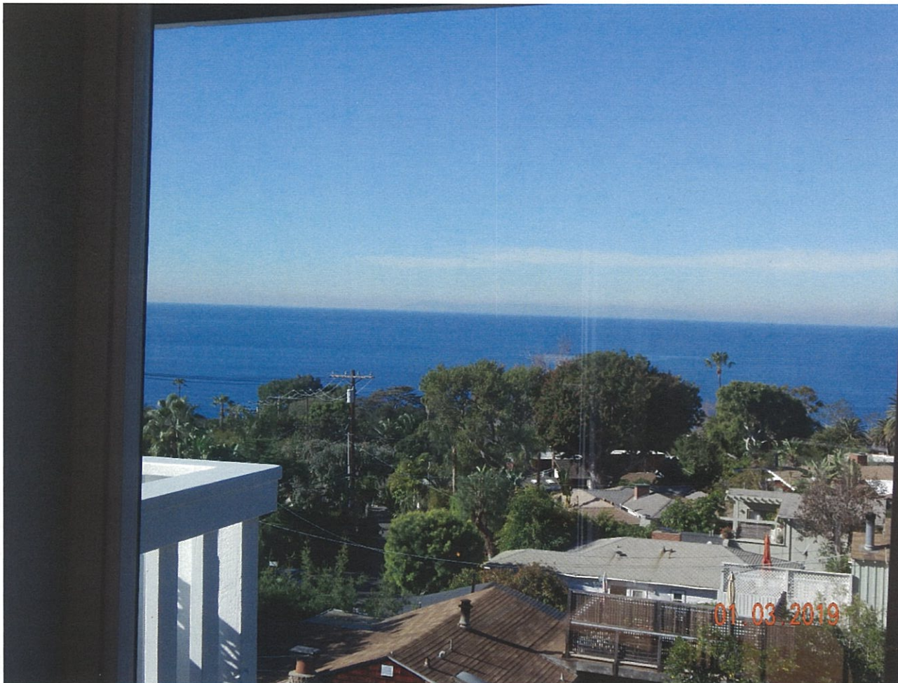
31503 Eagle Rock Way

The photograph above was taken from the kitchen/living room on the upper level of the primary residential structure.