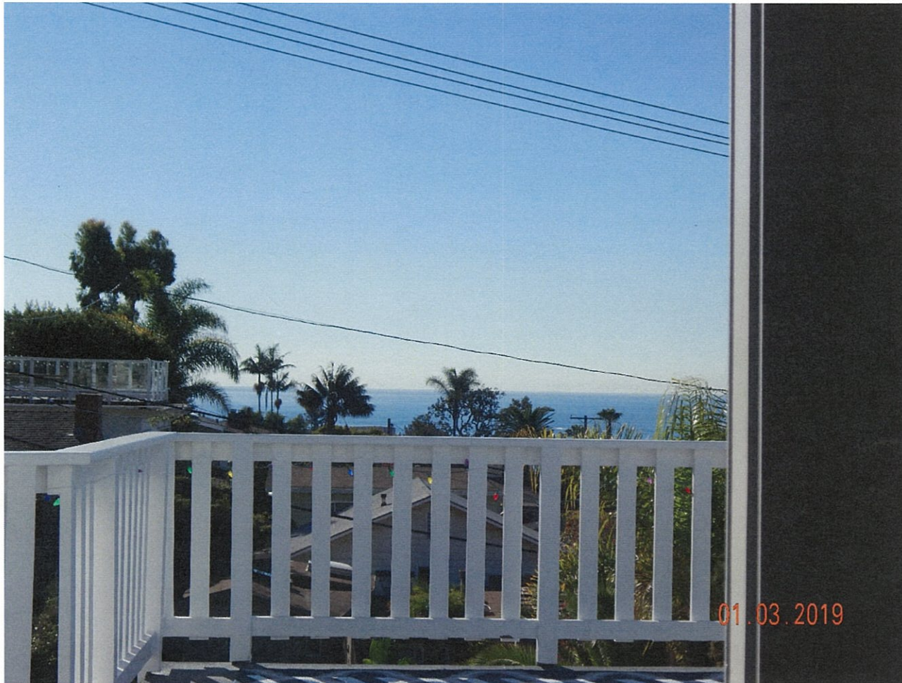
31503 Eagle Rock Way

The photograph above was taken from the guest bedroom on the lower level of the primary residential structure.