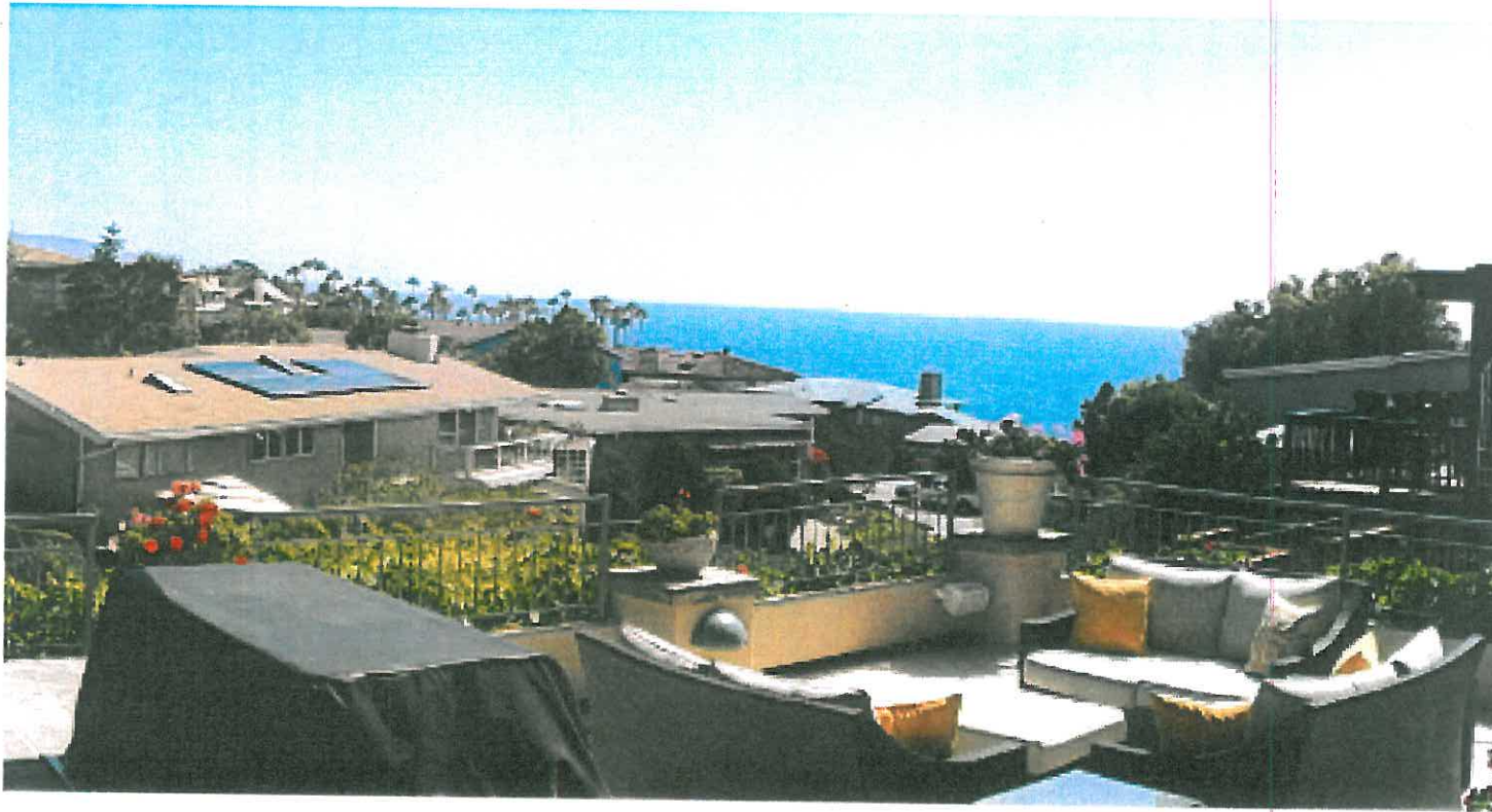
351 Crescent Bay Drive

The photograph above was taken from the main Living room and Dining room/Kitchen on the main level of the primary residential structure. Visual scene description: Contino Point, ocean horizon, city lights and hillside terrain.