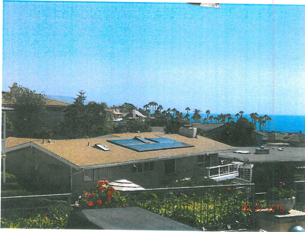
351 Crescent Bay Drive

The photograph above was taken from the main Living room and Dining room/Kitchen on the main level of the primary residential structure. Visual scene description: Contino Point, ocean horizon, city lights and hillside terrain.