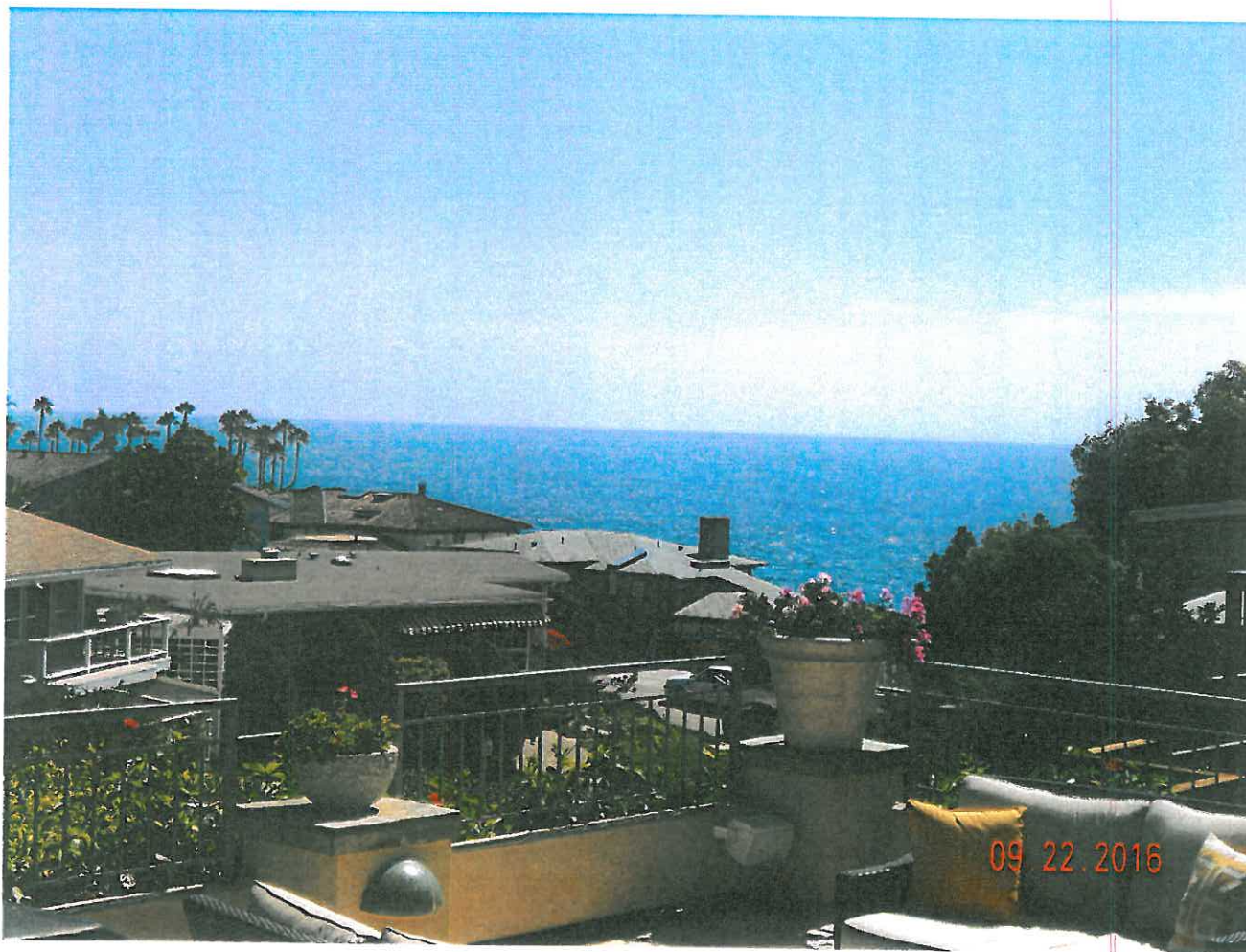
351 Crescent Bay Drive

The photograph above was taken from the main Living room and Dining room/Kitchen on the main level of the primary residential structure. Visual scene description: Contino Point, ocean horizon, city lights and hillside terrain.