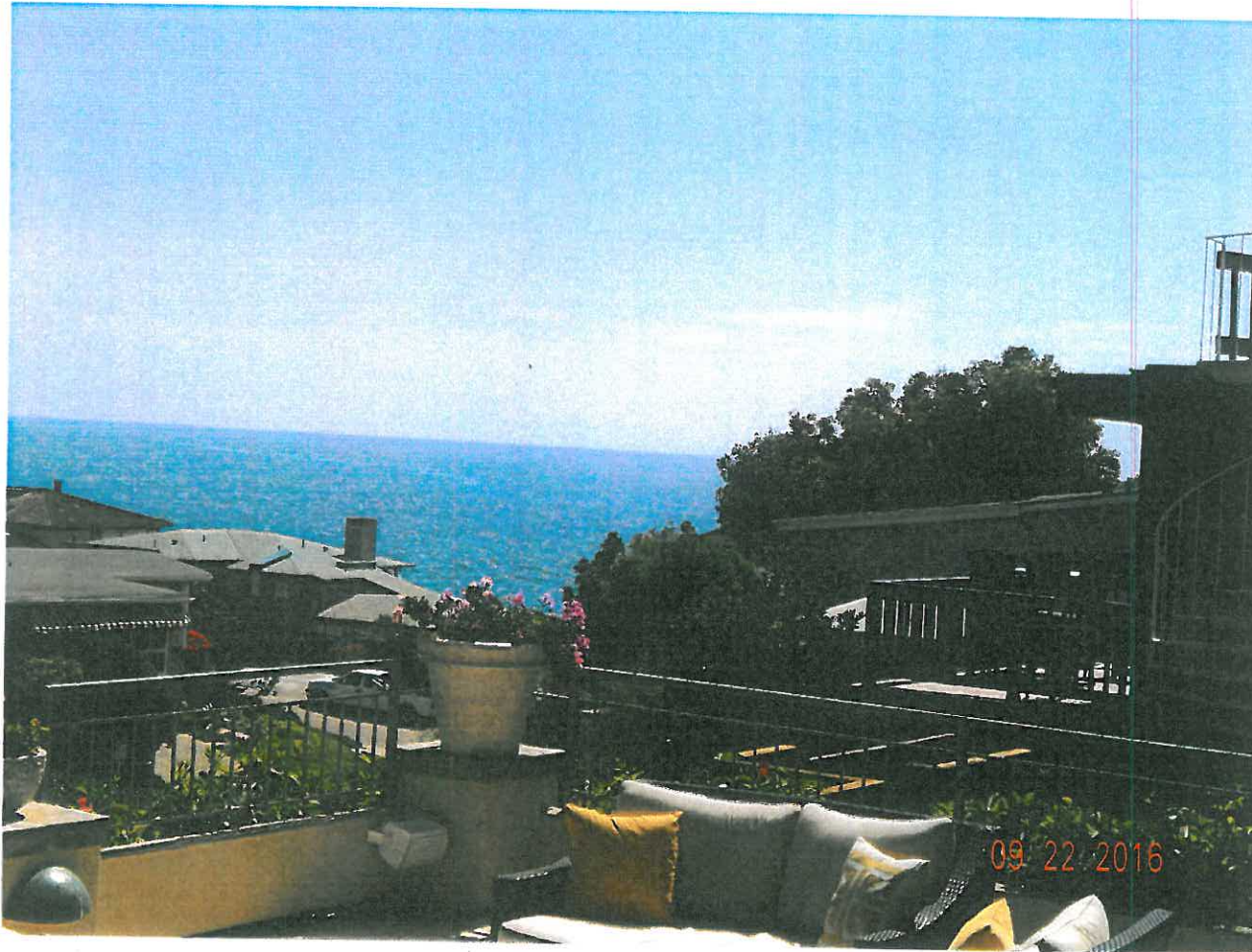
351 Crescent Bay Drive

The photograph above was taken from the main Living room and Dining room/Kitchen on the main level of the primary residential structure. Visual scene description: Ocean horizon.