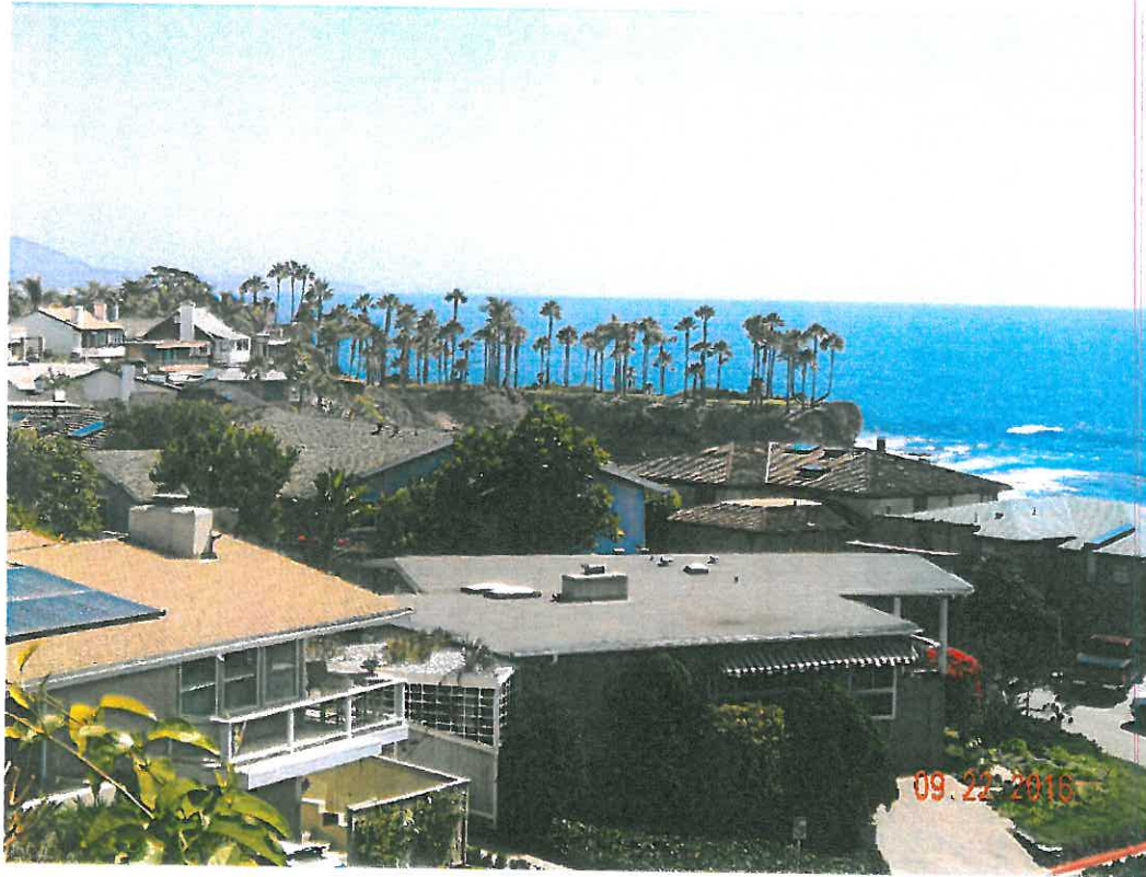
351 Crescent Bay Drive

The photograph above was taken from the main Master bedroom on the upper level of the primary residential structure. Visual scene description: Twin Points, Contino Point, Crescent Bay, Laguna coastline, whitewater, ocean horizon, city lights and hillside terrain.