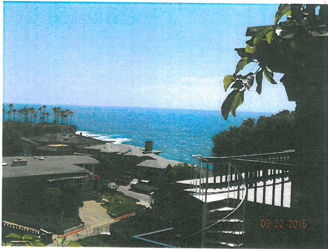
351 Crescent Bay Drive

The photograph above was taken from the main Master bedroom on the upper level of the primary residential structure. Visual scene description: Twin Points, Contino Point, Crescent Bay, Laguna coastline, whitewater, ocean horizon, city lights and hillside terrain.