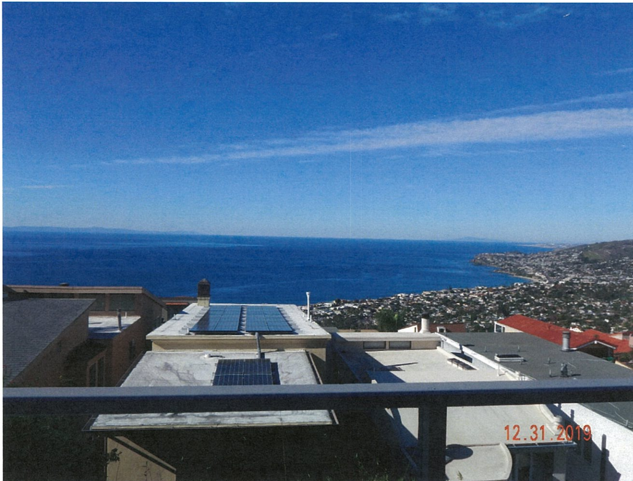
1065 Katella Street

The photograph above was taken from the living room on the upper level of the primary residential structure. Visual scene description: San Clemente and Catalina Islands, Main Beach, Heisler Park, Crescent Bay, Emerald Bay, Newport Peninsula, Palos Verdes Peninsula, city lights, whitewater and ocean horizon.