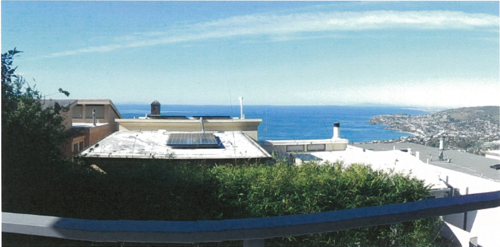
1065 Katella Street

The photograph above was taken from the lower level master bedroom of the primary residential structure. Visual scene description: San Clemente and Catalina Islands, Main Beach, Heisler Park, Crescent Bay, Emerald Bay, Newport Peninsula, Palos Verdes Peninsula, city lights, whitewater and ocean horizon.