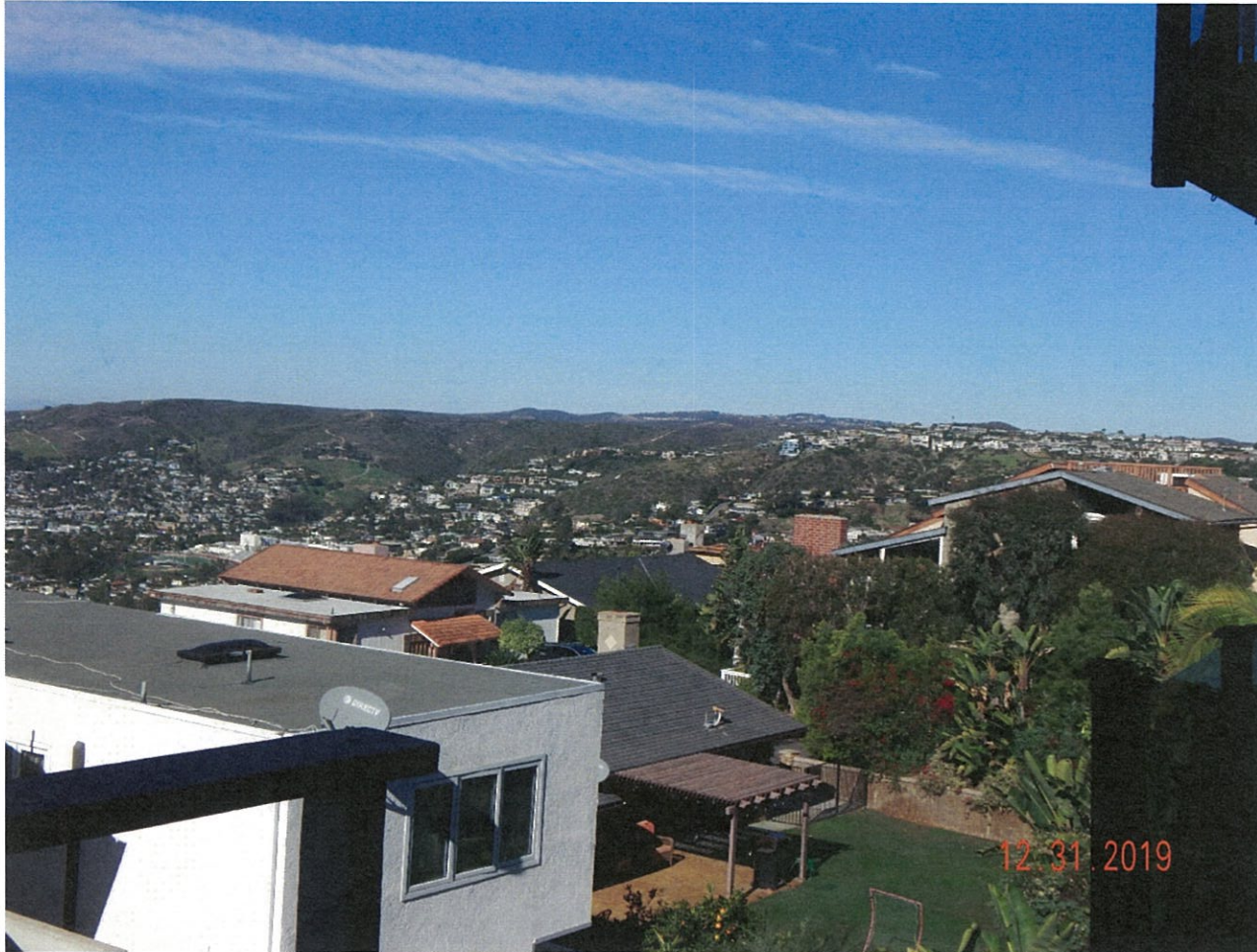
1065 Katella Street

The photograph above was taken from the lower level master bedroom of the primary residential structure. Visual scene description: city lights.