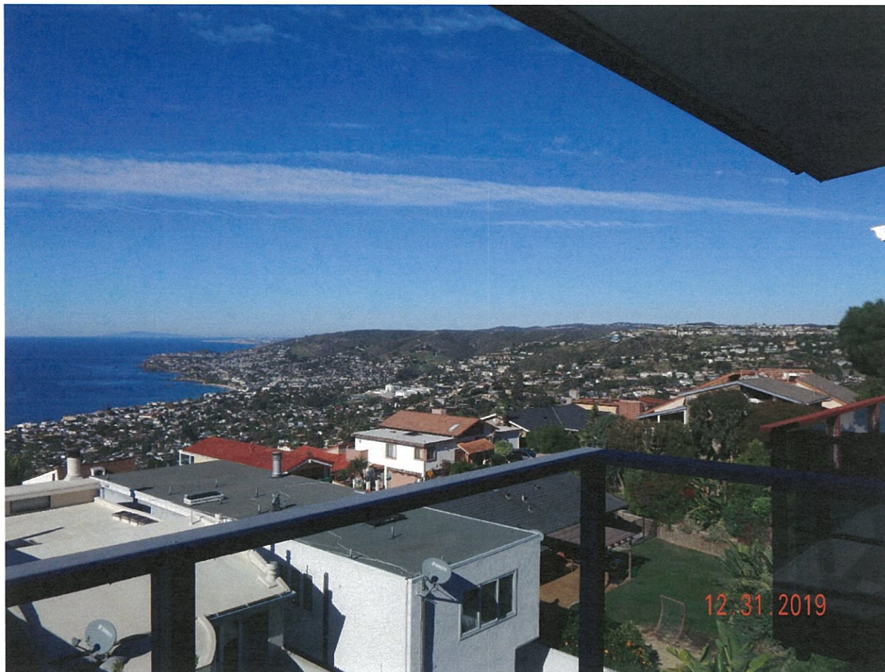
1065 Katella Street

The photograph above was taken from the living room on the upper level of the primary residential structure. Visual scene description: Catalina Island, Main Beach, Heisler Park, Crescent Bay, Emerald Bay, Newport Peninsula, Palos Verdes Peninsula, city lights, whitewater and ocean horizon.