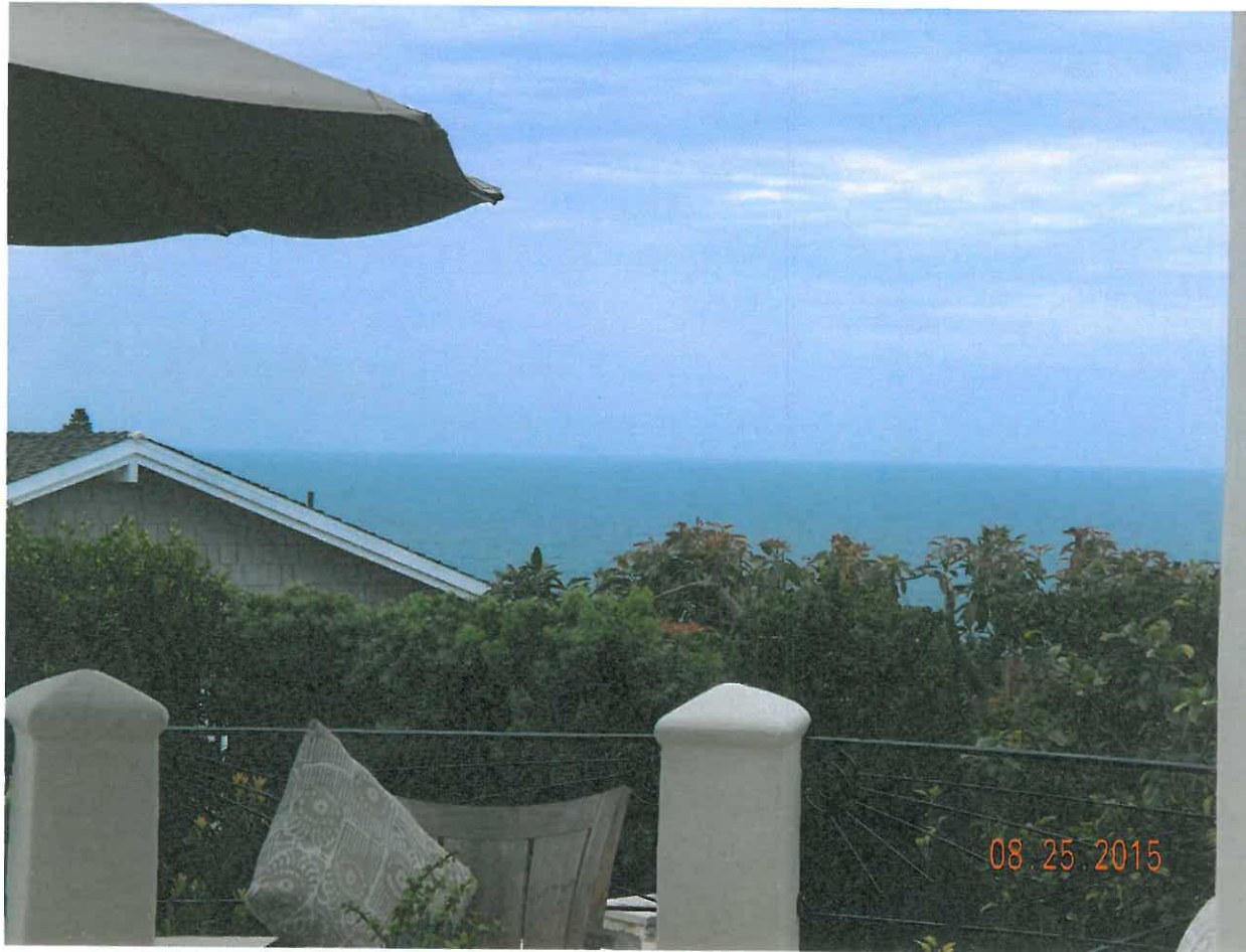
145 La Brea St.

The photograph above was taken from the property owners' Kitchen and Sitting room on the ground level of the primary residential structure. Visual scene description: Ocean horizon, hillside terrain, San Clemente Island and central Laguna coastline southward to Dana Point.