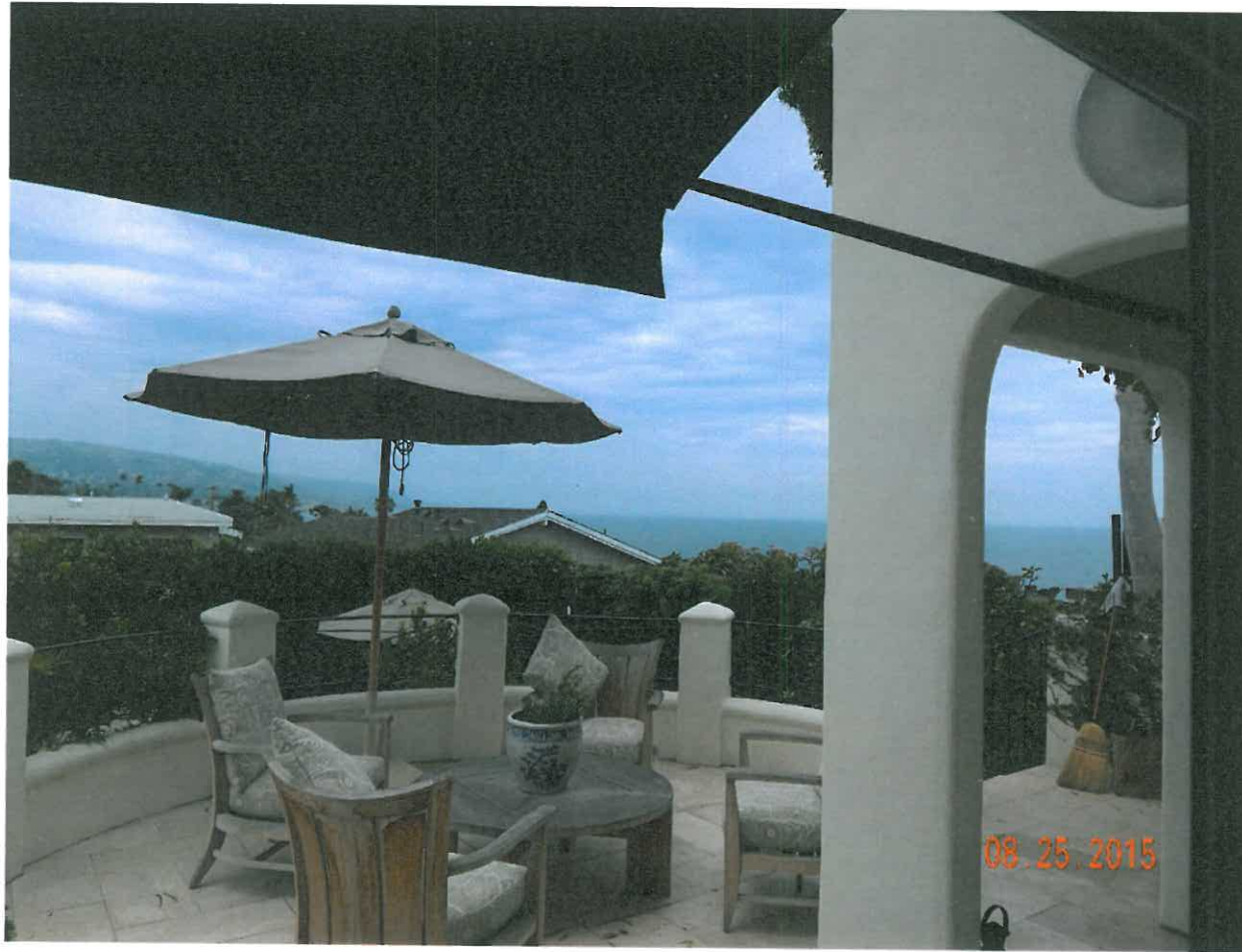
145 La Brea St.

The photograph above was taken from the property owners' Kitchen and Sitting room on the ground level of the primary residential structure.