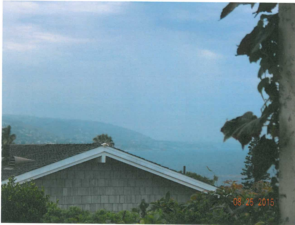
145 La Brea St.

The photograph above was taken from the property owners' Kitchen and Sitting room on the ground level of the primary residential structure.