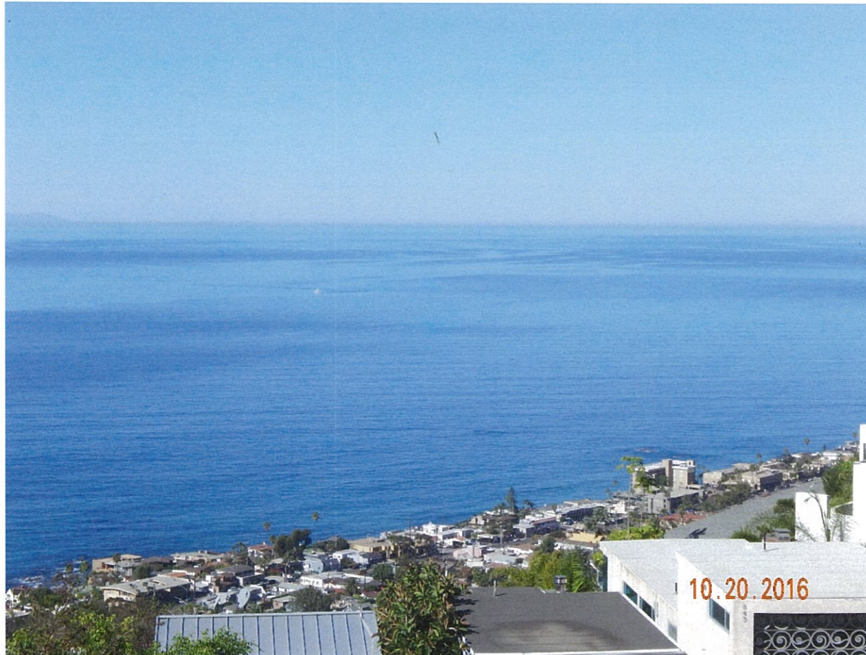
825 La Mirada St.

The photograph above was taken from the living room on the main level of the primary residential structure.