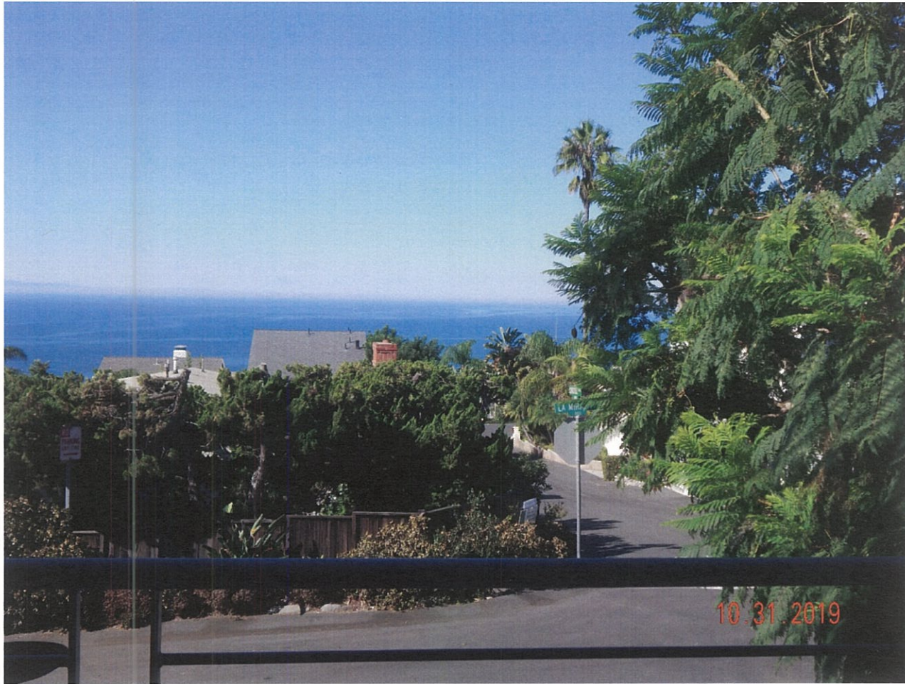
890 La Mirada St.

The photograph above was taken from the lower level bedroom of the primary residential structure.