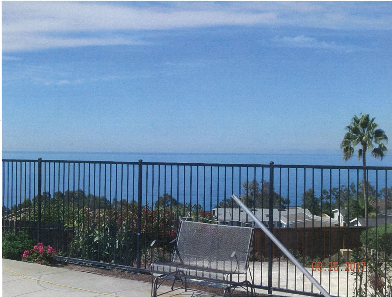
21562 Ocean Vista Dr.

The photograph above was taken from the Kitchen, Great Room, Living/Dining area in the single level primary residential structure.