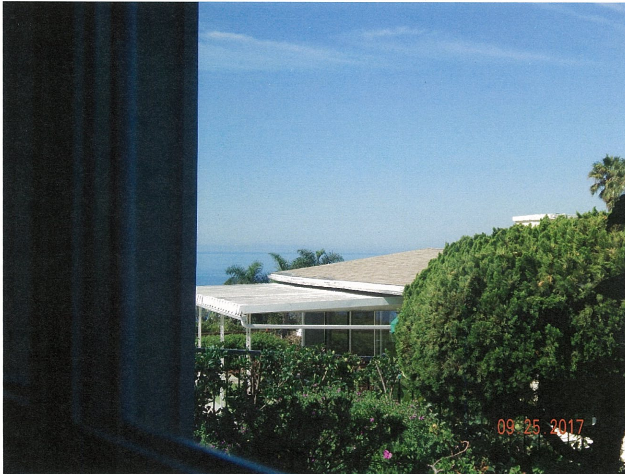
21562 Ocean Vista Dr.

The photograph above was taken from the Master bedroom in the single level primary residential structure.