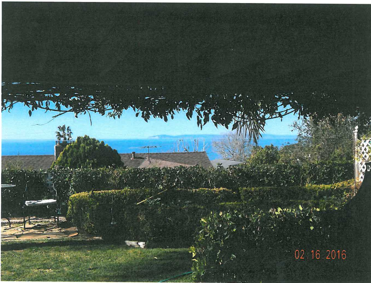
2965 Mountain View Dr.

The photograph above was taken from the property owners' Master bedroom on the main floor of the primary residential structure.