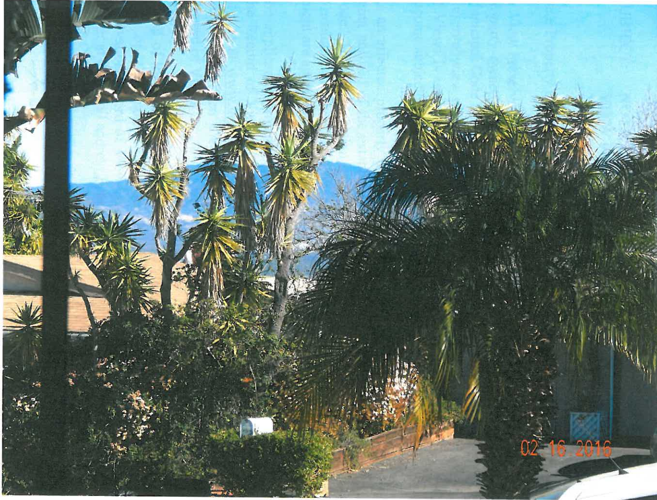
2965 Mountain View Dr.

The photograph above was taken from the property owners' Breakfast nook on the main floor of the primary residential structure.