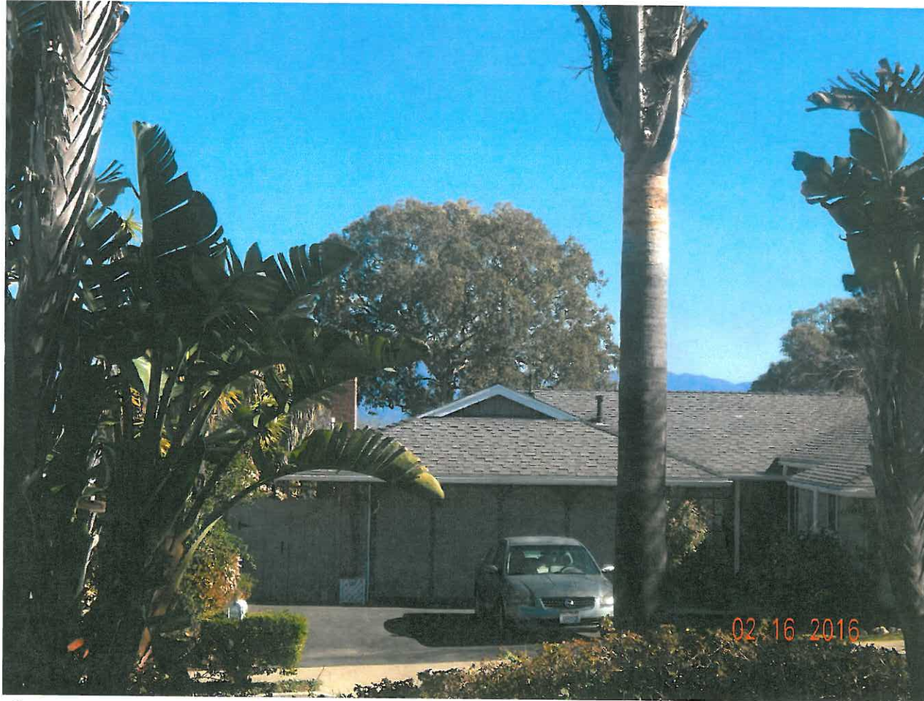
2965 Mountain View Dr.

The photograph above was taken from the property owners' Guest bedroom on the main floor of the primary residential structure.