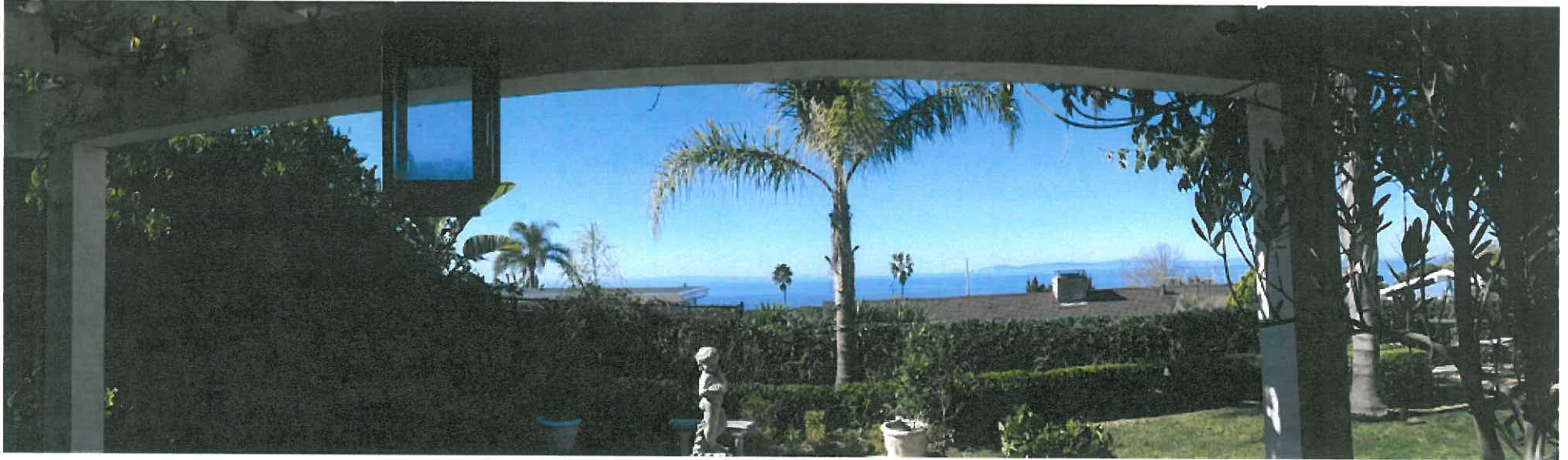
2965 Mountain View Dr.

The photograph above was taken from the property owners' Family room on the main floor of the primary residential structure.