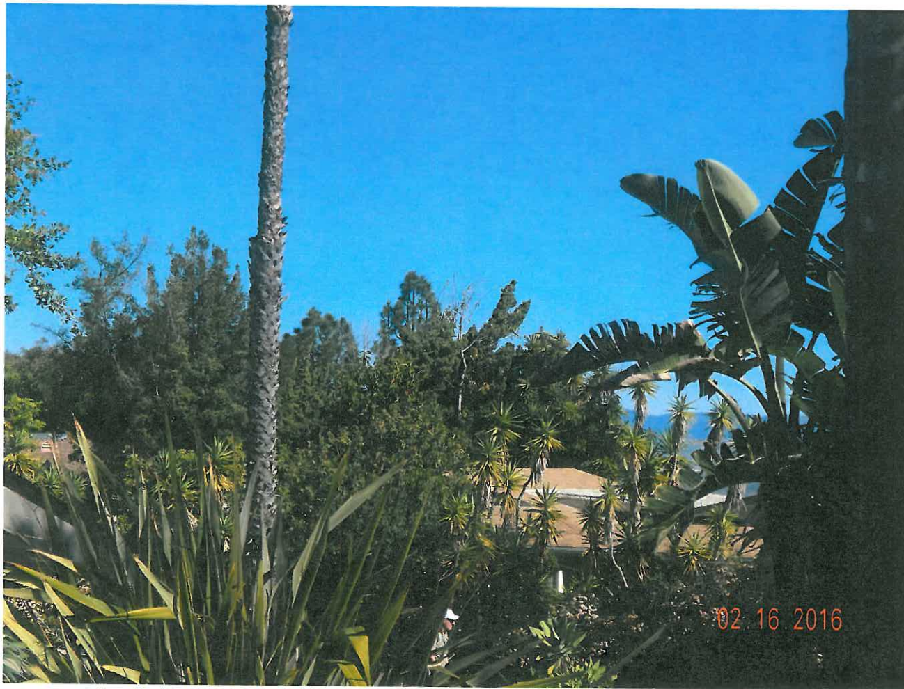
2965 Mountain View Dr.

The photograph above was taken from the property owners' Guest bedroom on the main floor of the primary residential structure.