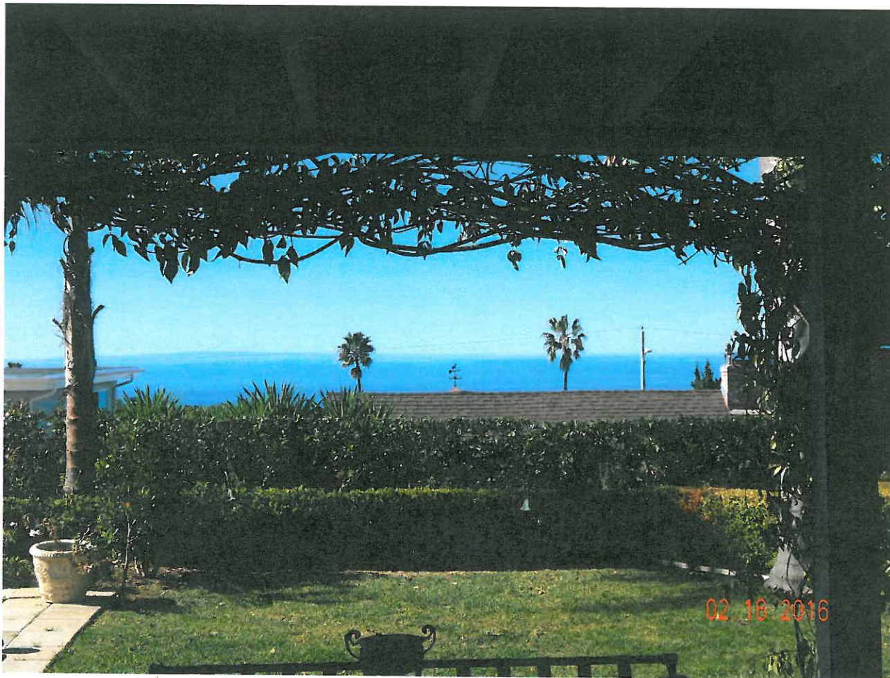
2965 Mountain View Dr.

The photograph above was taken from the property owners' Dining room/Great room on the main floor of the primary residential structure.