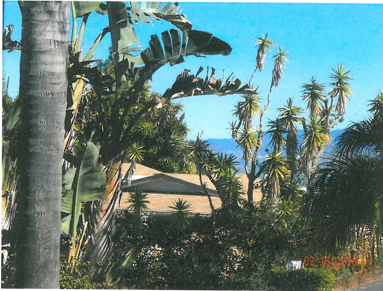
2965 Mountain View Dr.

The photograph above was taken from the property owners' Breakfast nook on the main floor of the primary residential structure.