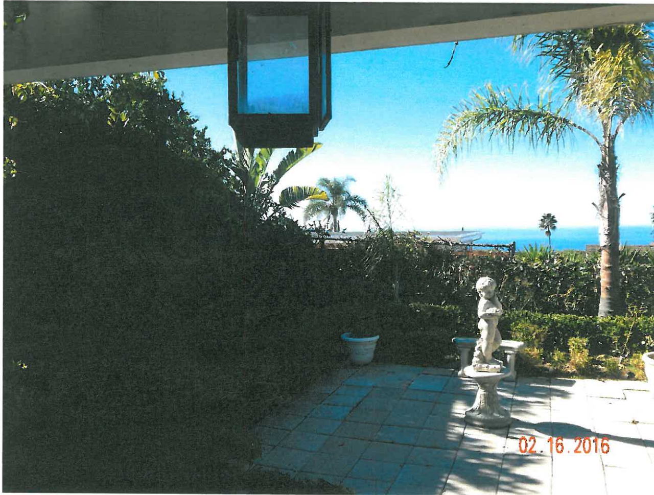
2965 Mountain View Dr.

The photograph above was taken from the property owners' Family room on the main floor of the primary residential structure.