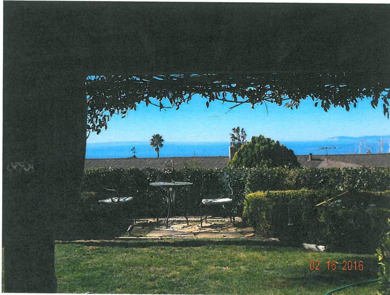
2965 Mountain View Dr.

The photograph above was taken from the property owners' Master bedroom on the main floor of the primary residential structure. Visual scene description: San Clemente and Catalina Islands and ocean horizon.