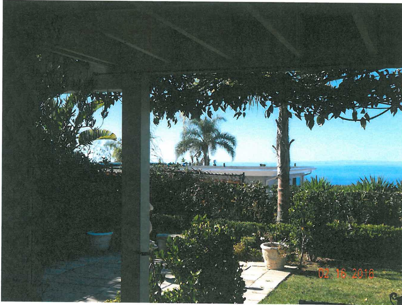
2965 Mountain View Dr.

The photograph above was taken from the property owners' Dining room/Great room on the main floor of the primary residential structure.