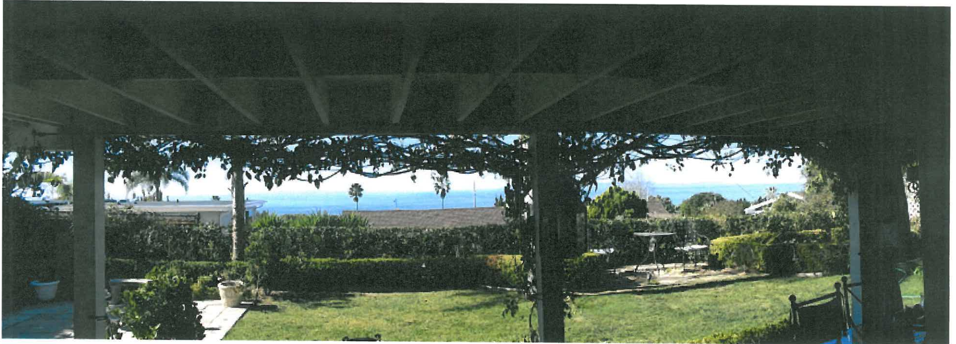
2965 Mountain View Dr.

The photograph above was taken from the property owners' Dining room/Great room on the main floor of the primary residential structure.