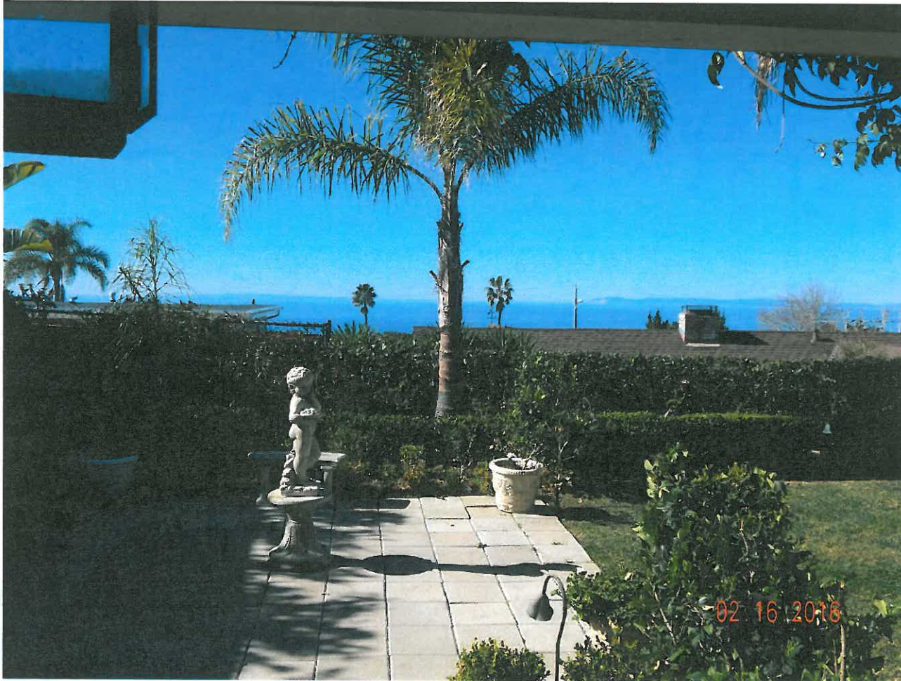
2965 Mountain View Dr.

The photograph above was taken from the property owners' Family room on the main floor of the primary residential structure.