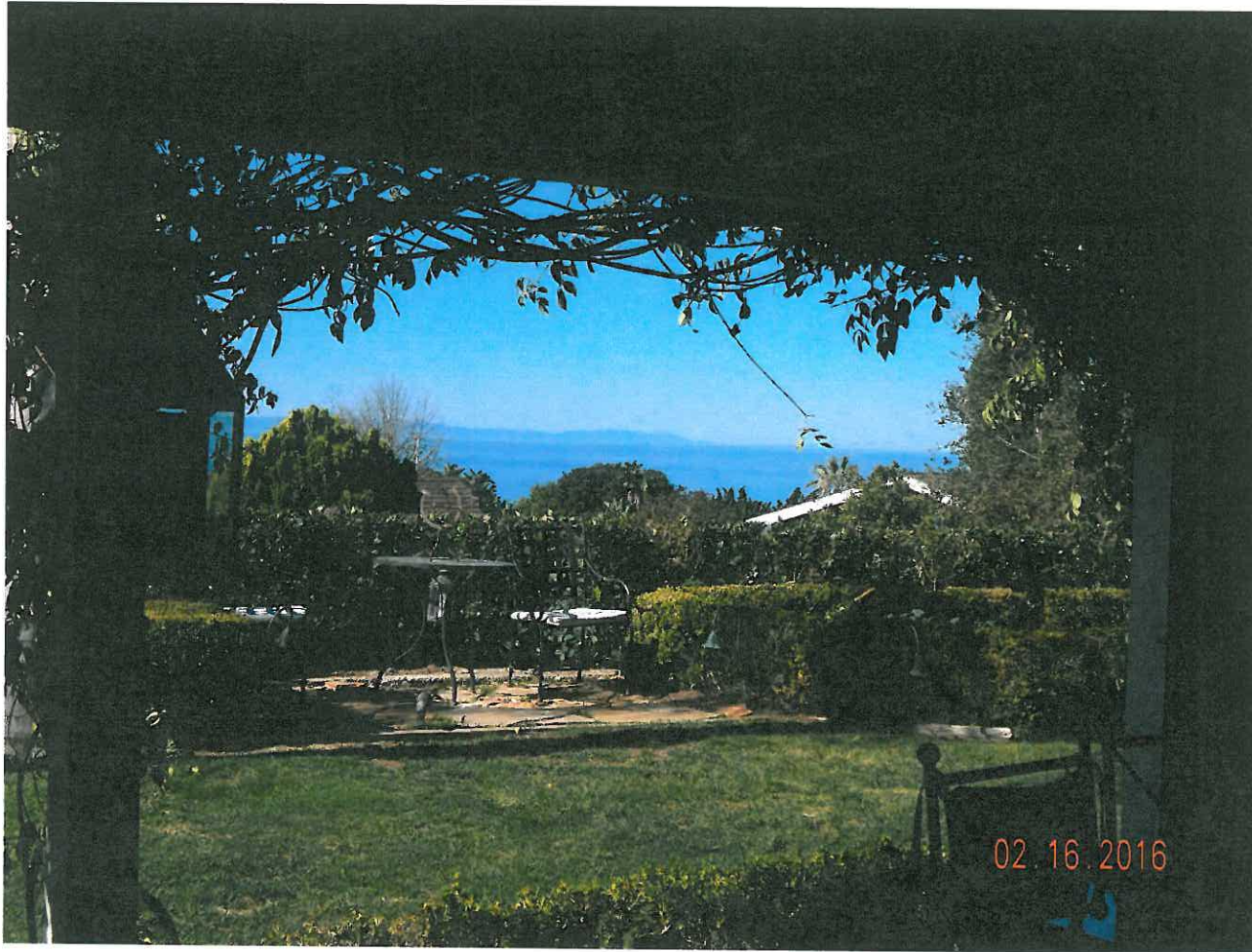
2965 Mountain View Dr.

The photograph above was taken from the property owners' Dining room/Great room on the main floor of the primary residential structure.