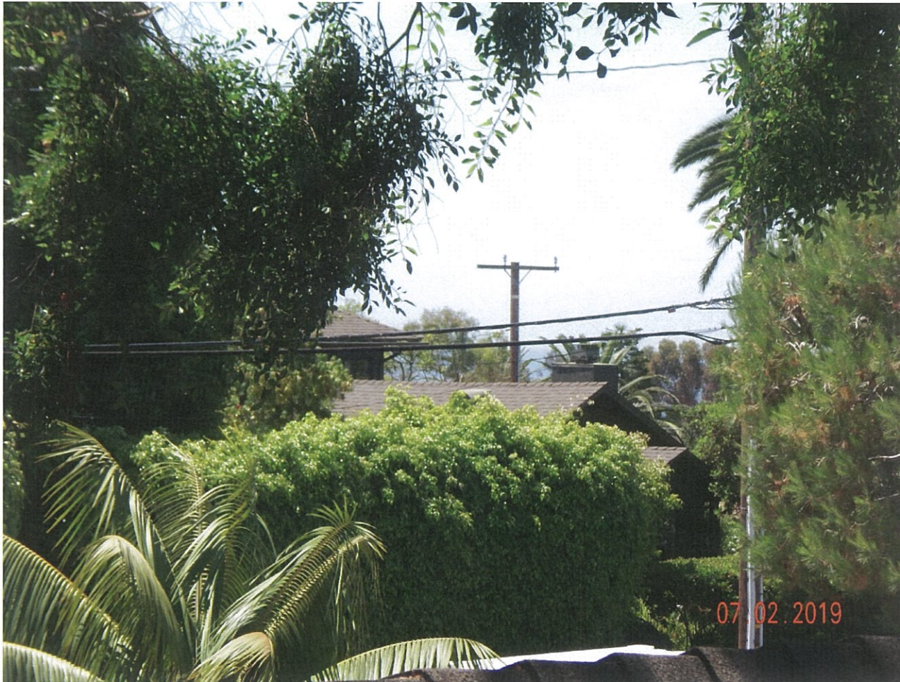
560 Mountain Road

The photograph above was taken from the office on the upper level of the primary residential structure.