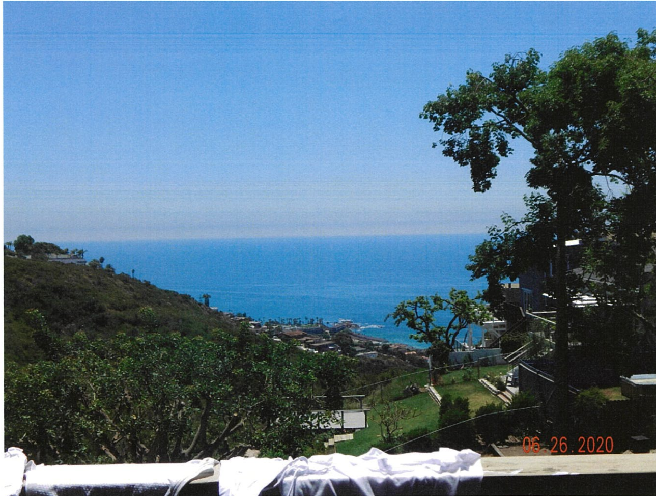
965 Noria Street

The photograph above was taken from the living room on the main floor/upper level of the primary residential structure.