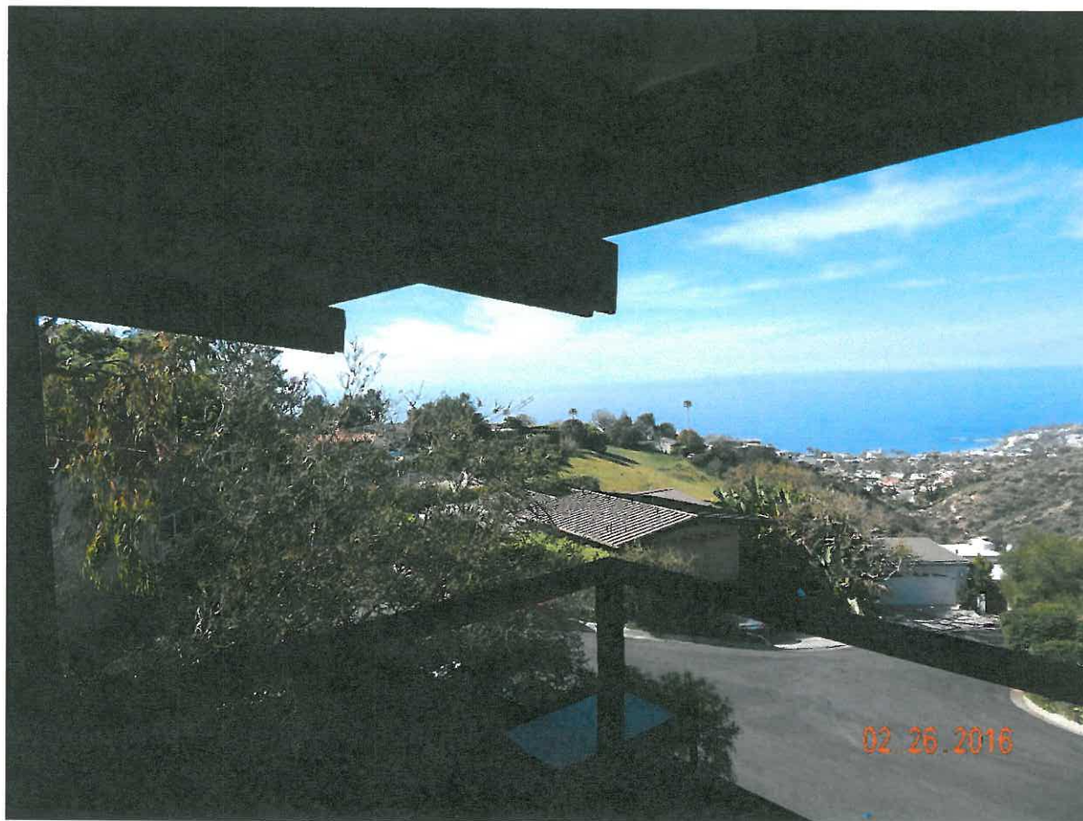
1969 San Remo Dr.

The photograph above was taken from the property owners' Living room on the upper level of the primary residential structure. Visual scene description: Catalina Island, Main Beach, Hotel Laguna, Heisler Park, whitewater and Laguna coastline, ocean horizon, city lights and hillside terrain.