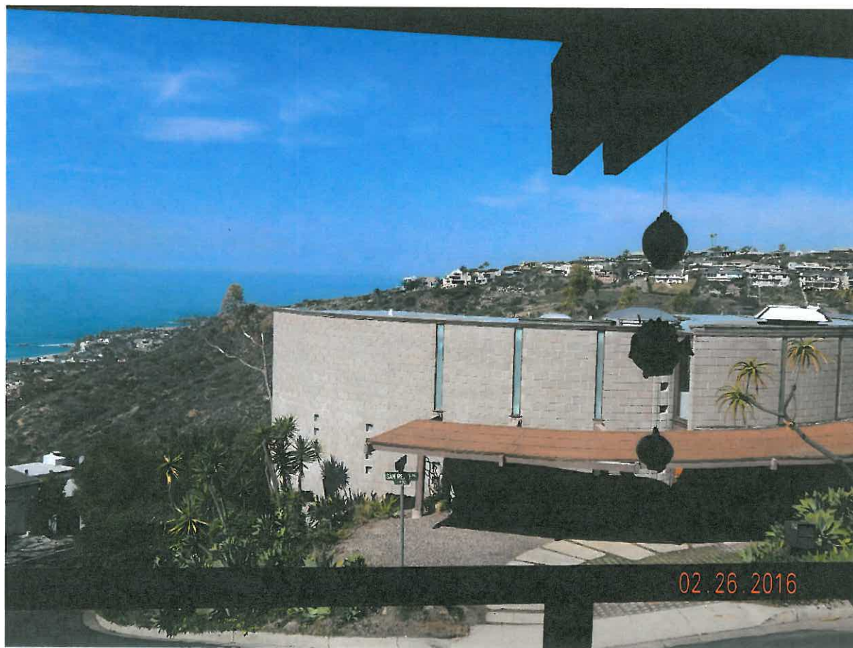
1969 San Remo Dr.

The photograph above was taken from the property owners' Living room on the upper level of the primary residential structure.