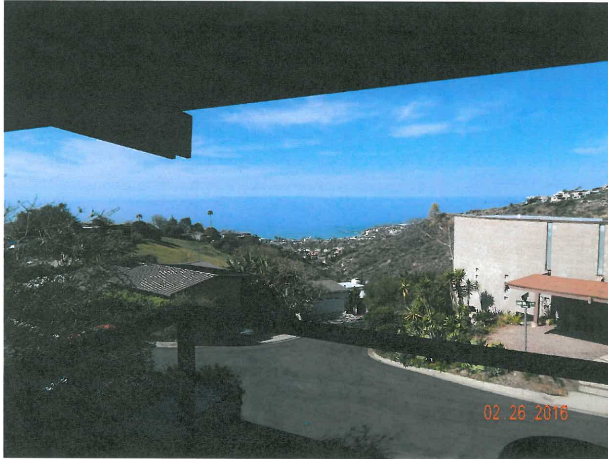
1969 San Remo Dr.

The photograph above was taken from the property owners' Living room on the upper level of the primary residential structure. Visual scene description: Catalina Island, Main Beach, Hotel Laguna, Heisler Park, whitewater and Laguna coastline, ocean horizon, city lights and hillside terrain.