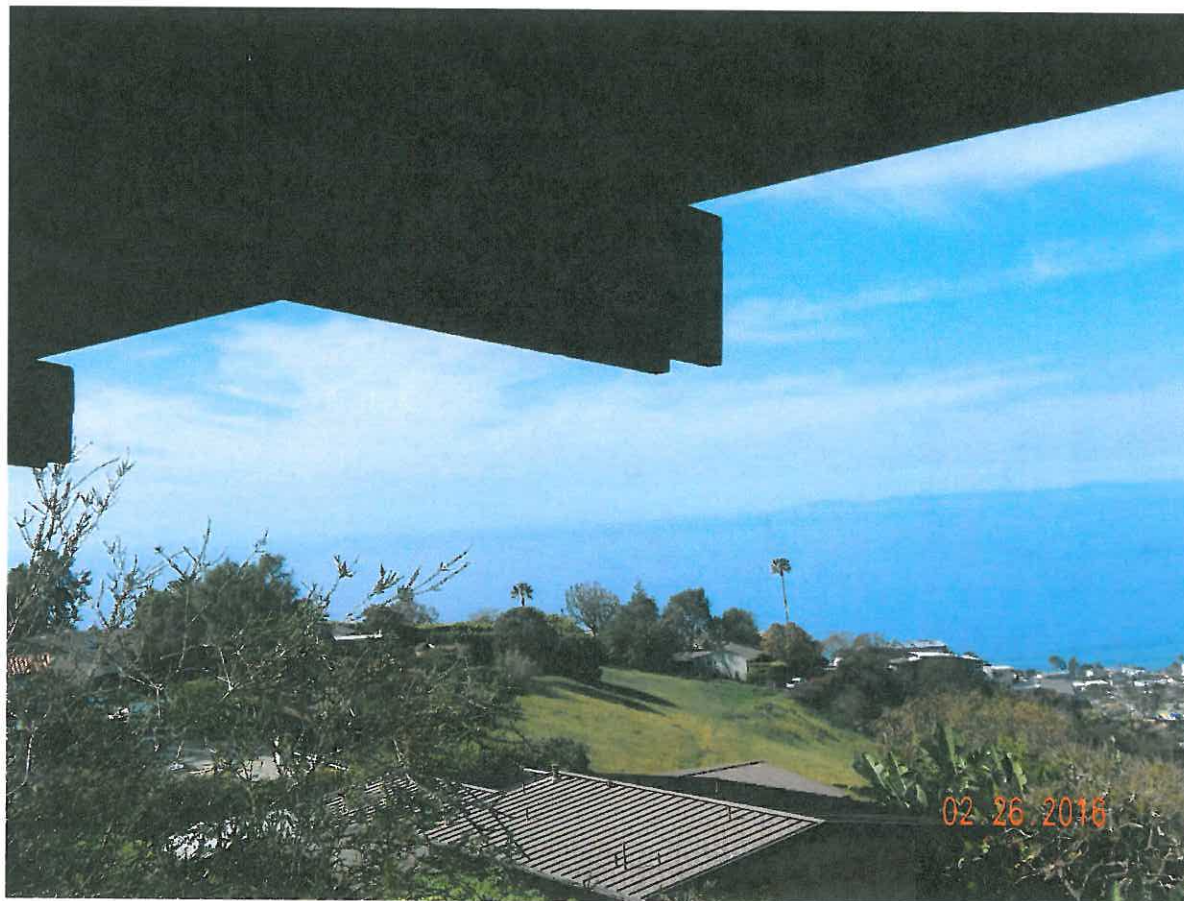
1969 San Remo Dr.

The photograph above was taken from the property owners' Master bedroom on the upper level of the primary residential structure.