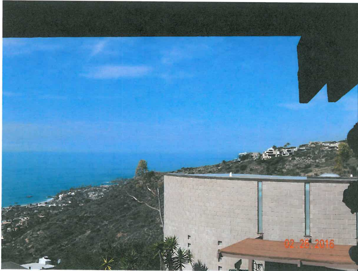
1969 San Remo Dr.

The photograph above was taken from the property owners' Master bedroom on the upper level of the primary residential structure.