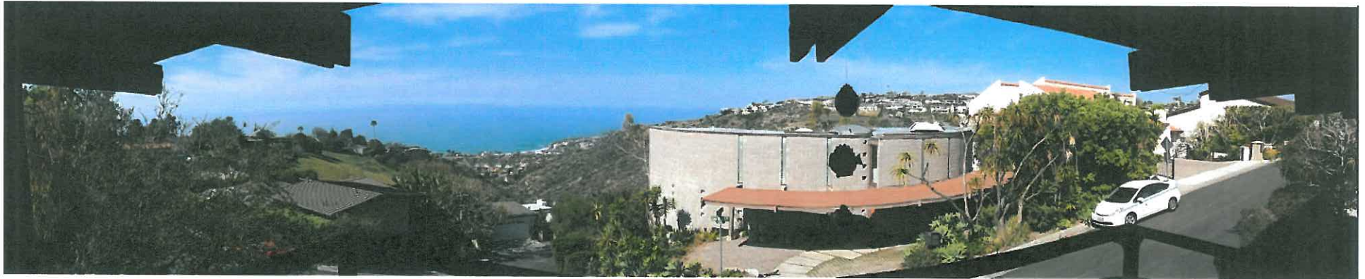
1969 San Remo Dr.

The photograph above was taken from the property owners' Living room on the upper level of the primary residential structure.