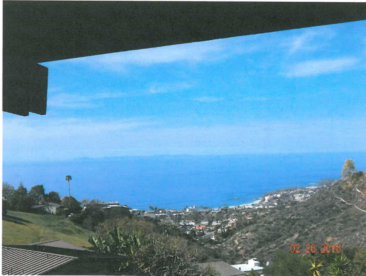
1969 San Remo Dr.

The photograph above was taken from the property owners' Master bedroom on the upper level of the primary residential structure. Visual scene description: Catalina Island, Main Beach, Hotel Laguna, Heisler Park, whitewater and Laguna coastline, ocean horizon, city lights and hillside terrain.