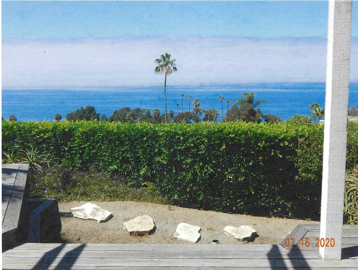
21612 Ocean Vista Drive

The photograph above was taken from the master bedroom of the primary residential structure.