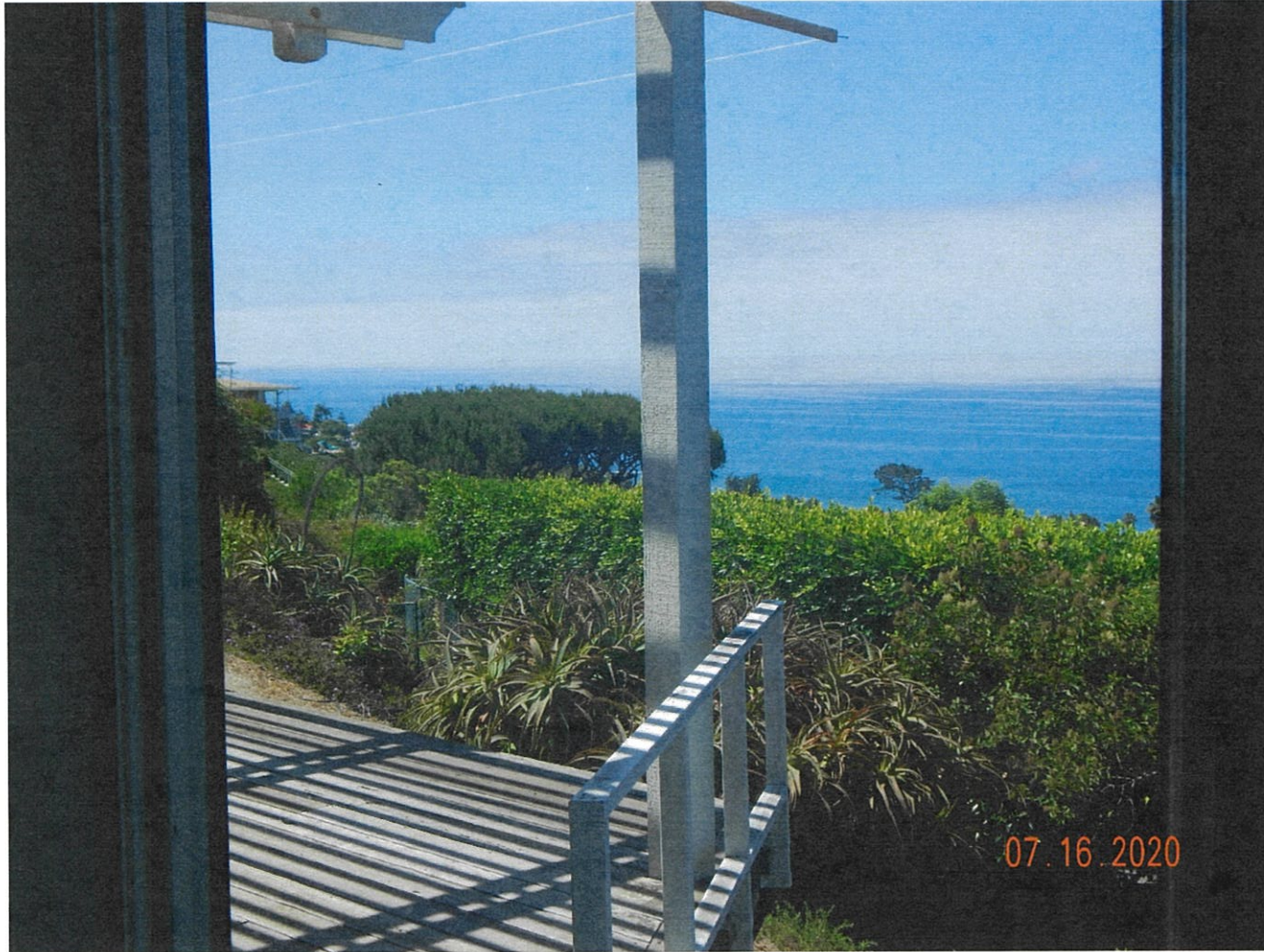
21612 Ocean Vista Drive

The photograph above was taken from the kitchen of the primary residential structure.