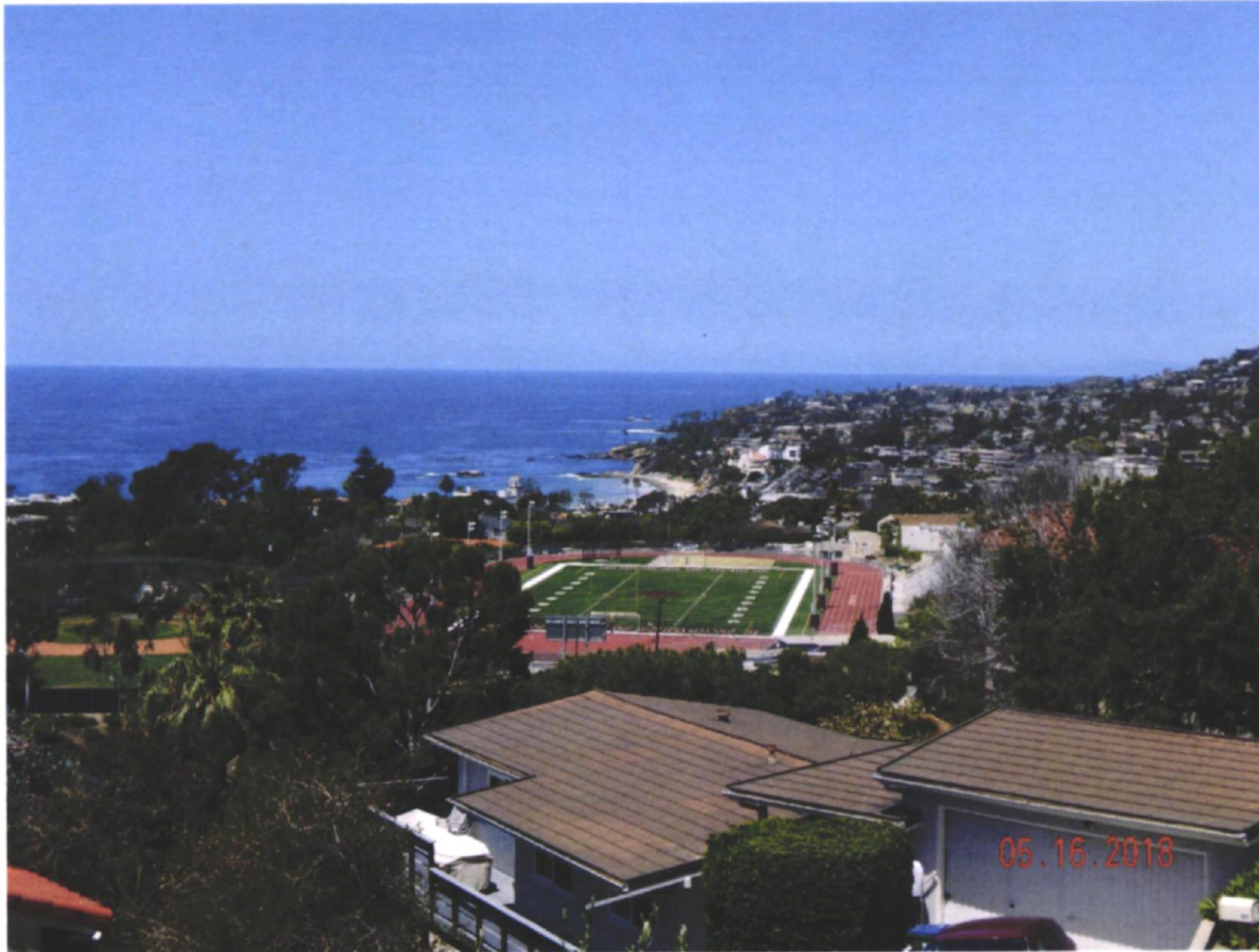
830 Temple Hills Drive

The photograph above was taken from the upper level office/den of the primary residential structure. Visual scene description: Main Beach, Hotel Laguna, Bird Rock, Heisler Park, Contino Point, Catalina Island, whitewater and ocean horizon. Date of photograph: 05/16/18 Submitted to property file: 05/24/2018