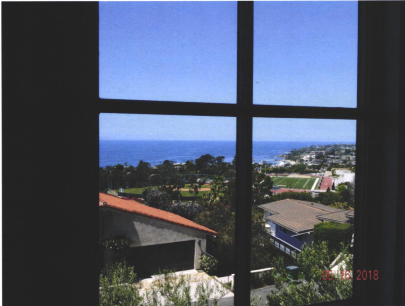
830 Temple Hills Drive

The photograph above was taken from the upper level office/den of the primary residential structure. Visual scene description: Main Beach, Hotel Laguna, Bird Rock, Heisler Park, Catalina Island, whitewater and ocean horizon. Date of photograph: 05/16/18 Submitted to property file: 05/24/2018