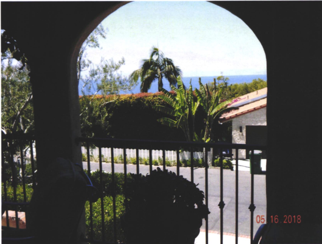
830 Temple Hills Drive

The photograph above was taken from the lower level dining room of the primary residential structure. Visual scene description: Catalina Island, San Clemente Island and ocean horizon. Date of photograph: 05/16/18 Submitted to property file: 05/24/2018