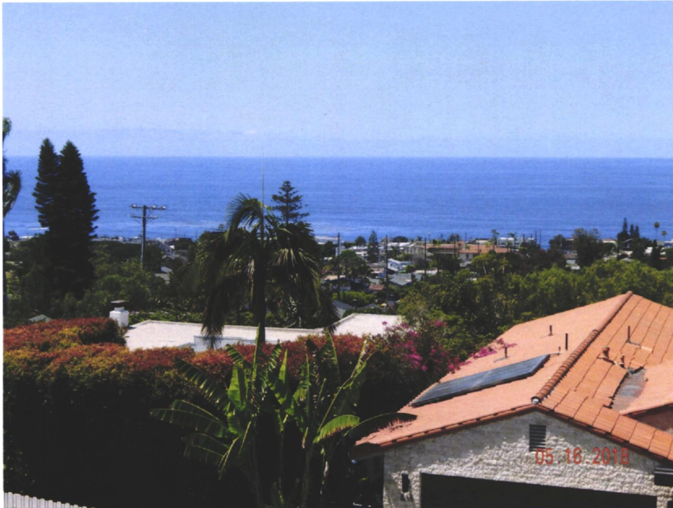
830 Temple Hills Drive

The photograph above was taken from the upper level office/den of the primary residential structure. Visual scene description: Catalina Island, San Clemente Island and ocean horizon. Date of photograph: 05/16/18 Photographed by: [Signature] Submitted to property file: 05/24/2018