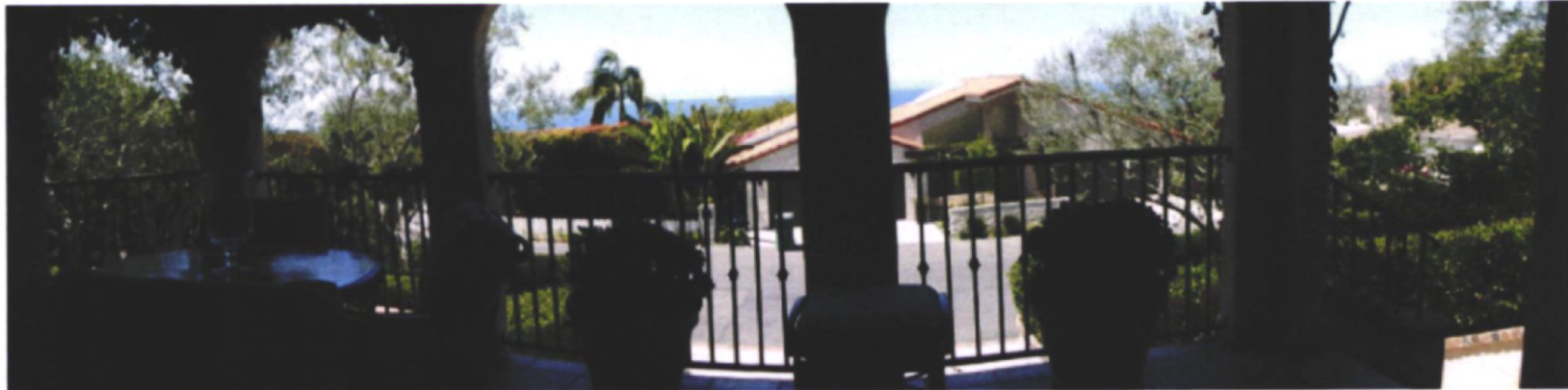
830 Temple Hills Drive

The photograph above was taken from the lower level dining room of the primary residential structure. Visual scene description: Catalina Island, San Clemente Island and ocean horizon. Date of photograph: 05/16/18 Submitted to property file: 05/24/2018