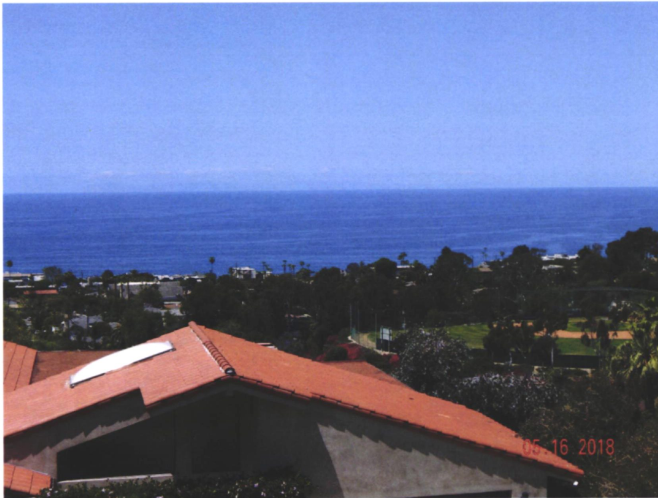
830 Temple Hills Drive

The photograph above was taken from the upper level office/den of the primary residential structure. Visual scene description: Catalina Island, San Clement Island and ocean horizon. Date of photograph: 05/16/18 Photographed by: [Signature] Submitted to property file: 05/24/2018