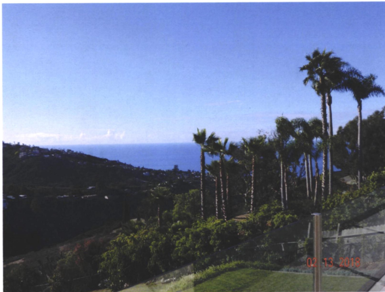
2305 Temple Hills Drive

The photograph above was taken from the upper main level Master bedroom area of the primary residential structure. Visual scene description: San Clemente and Catalina Islands and ocean horizon.