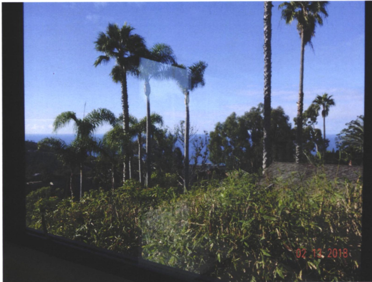
2305 Temple Hills Drive

The photograph above was taken from the upper main level, Kitchen, Dining, Living/Great room area of the primary residential structure. Visual scene description: San Clemente and Catalina Islands and ocean horizon.