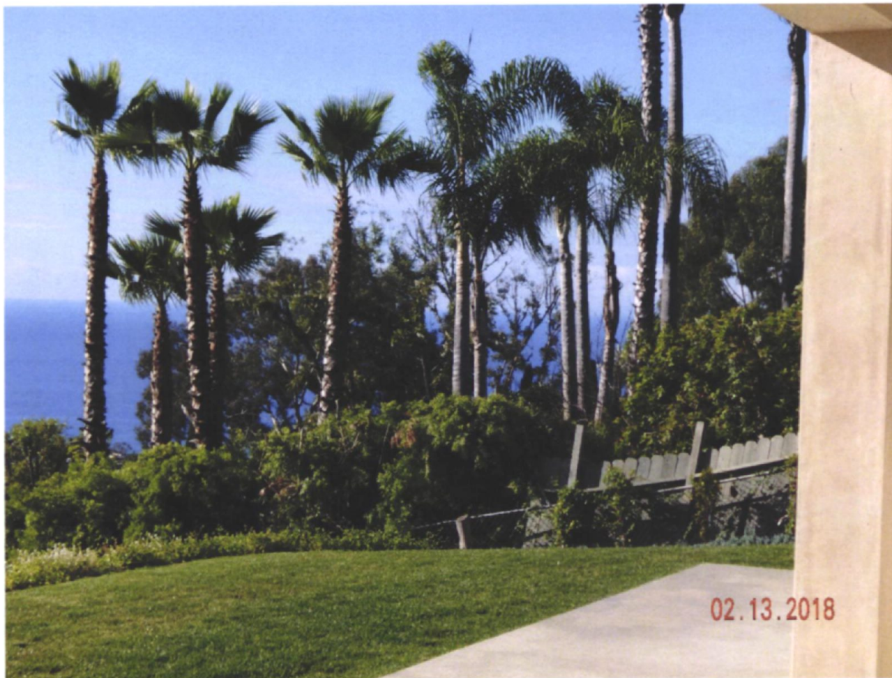
2305 Temple Hills Drive

The photograph above was taken from the lower level Family/TV room area of the primary residential structure. Visual scene description: San Clemente and Catalina Islands and ocean horizon.