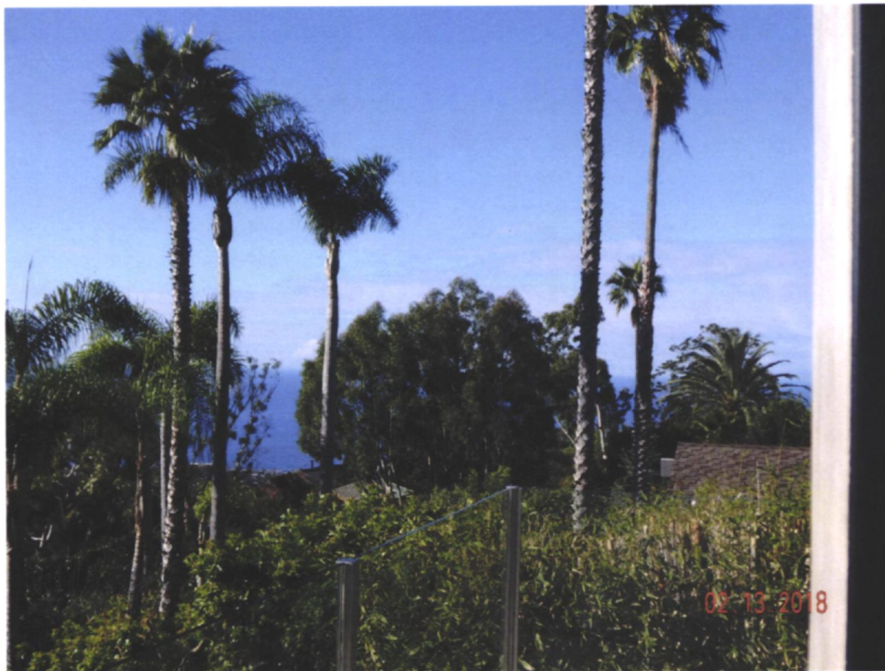
2305 Temple Hills Drive

The photograph above was taken from the upper main level, Kitchen, Dining, Living/Great room area of the primary residential structure. Visual scene description: San Clemente and Catalina Islands and ocean horizon.