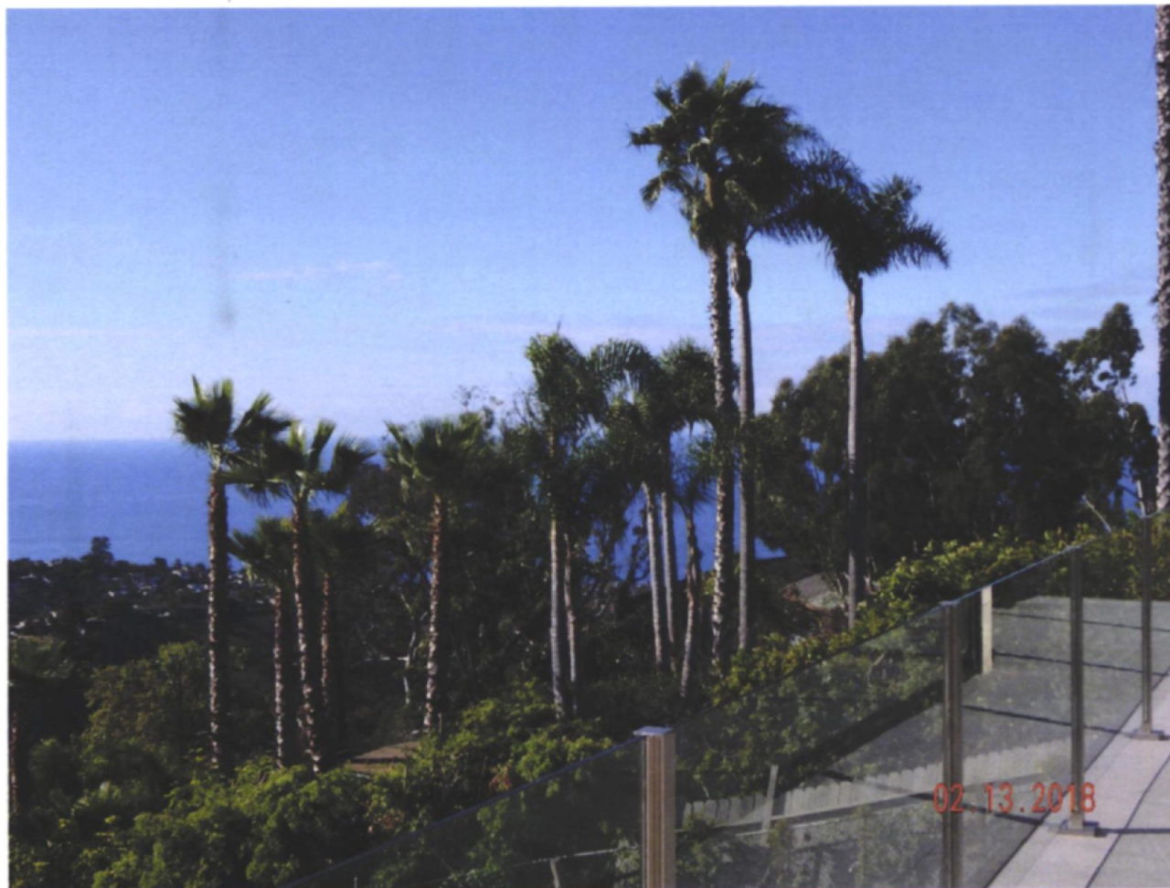
2305 Temple Hills Drive

The photograph above was taken from the upper main level Master bedroom area of the primary residential structure. Visual scene description: San Clemente and Catalina Islands and ocean horizon.