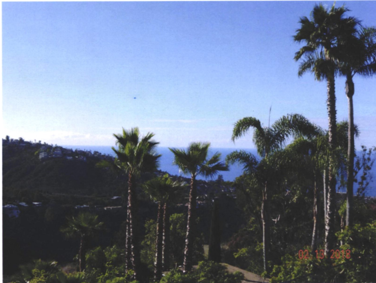
2305 Temple Hills Drive

The photograph above was taken from the upper main level, Kitchen, Dining, Living/Great room area of the primary residential structure. Visual scene description: San Clemente Island and ocean horizon.