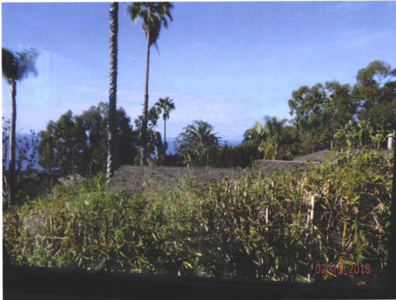
2305 Temple Hills Drive

The photograph above was taken from the upper main level, Kitchen, Dining, Living/Great room area of the primary residential structure. Visual scene description: San Clemente and Catalina Islands and ocean horizon.