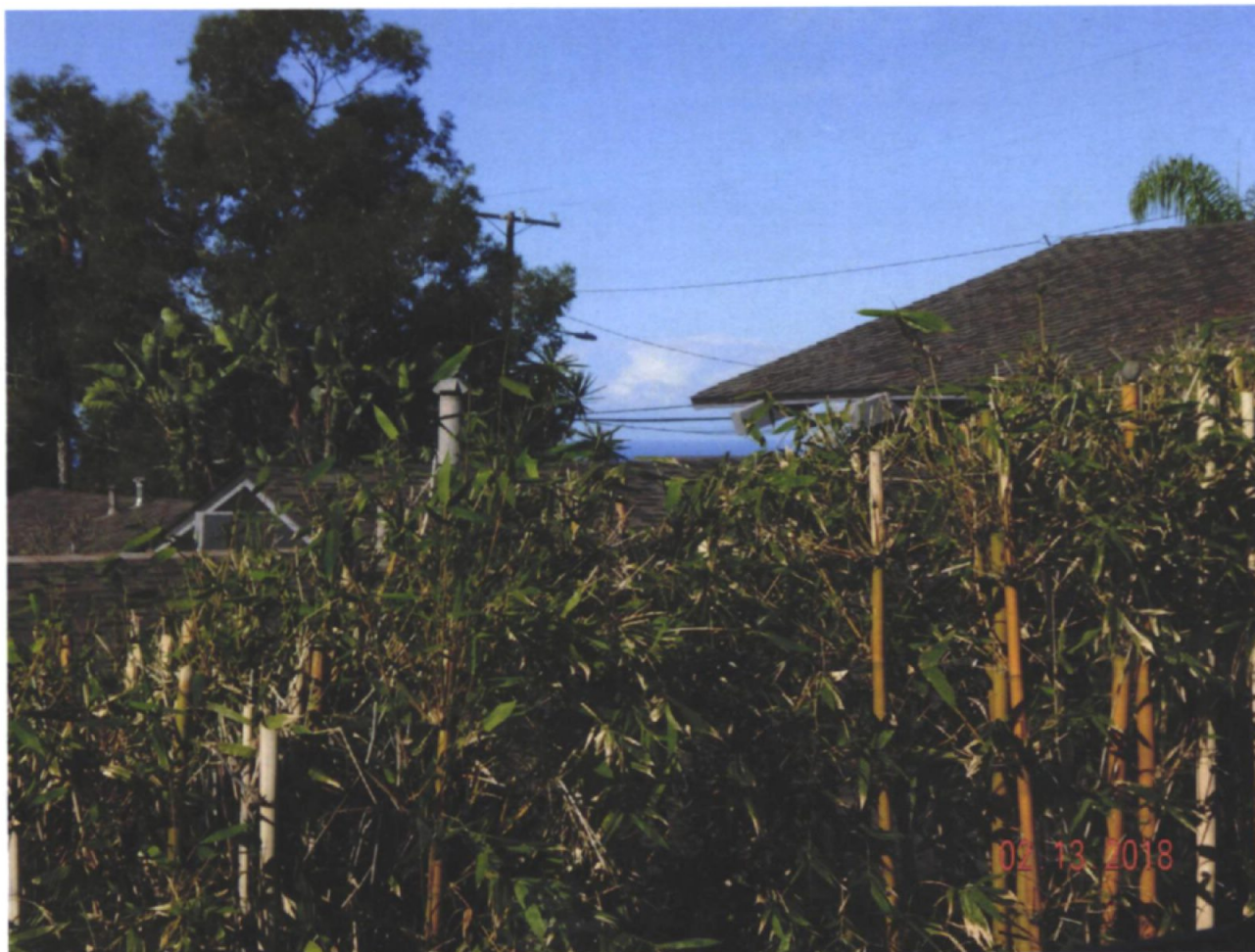
2305 Temple Hills Drive

The photograph above was taken from the upper main level, Kitchen, Dining, Living/Great room area of the primary residential structure. Visual scene description: Catalina Island and ocean horizon.