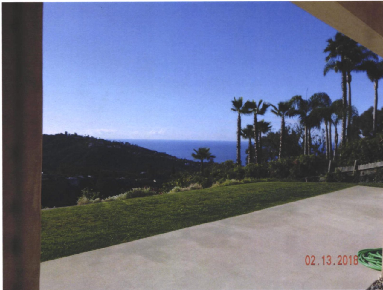
2305 Temple Hills Drive

The photograph above was taken from the lower level Guest bedroom area of the primary residential structure. Visual scene description: San Clemente and Catalina Islands and ocean horizon.