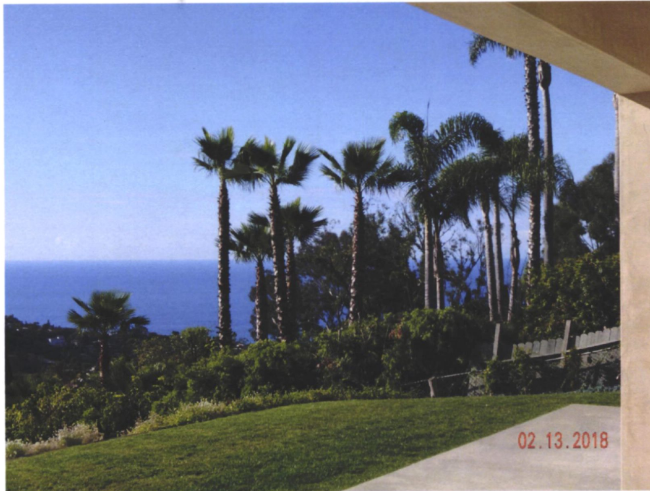
2305 Temple Hills Drive

The photograph above was taken from the lower level Guest bedroom/Exercise room of the primary residential structure. Visual scene description: San Clemente and Catalina Islands and ocean horizon.