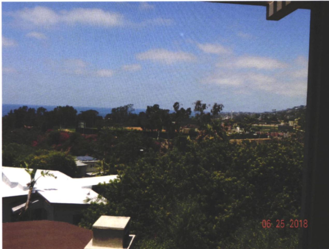
811 Wendt Terrace

The photograph above was taken from the dining room/living room on the main level of the primary residential structure.